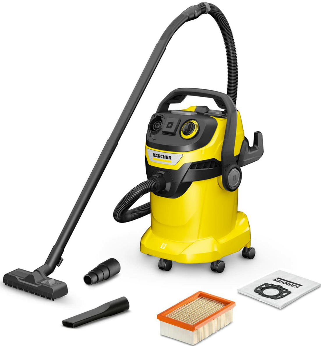
Image 1.1: Kärcher WD 5 P V-25/5/22 Wet and Dry Vacuum Cleaner, showing its compact design and yellow finish.