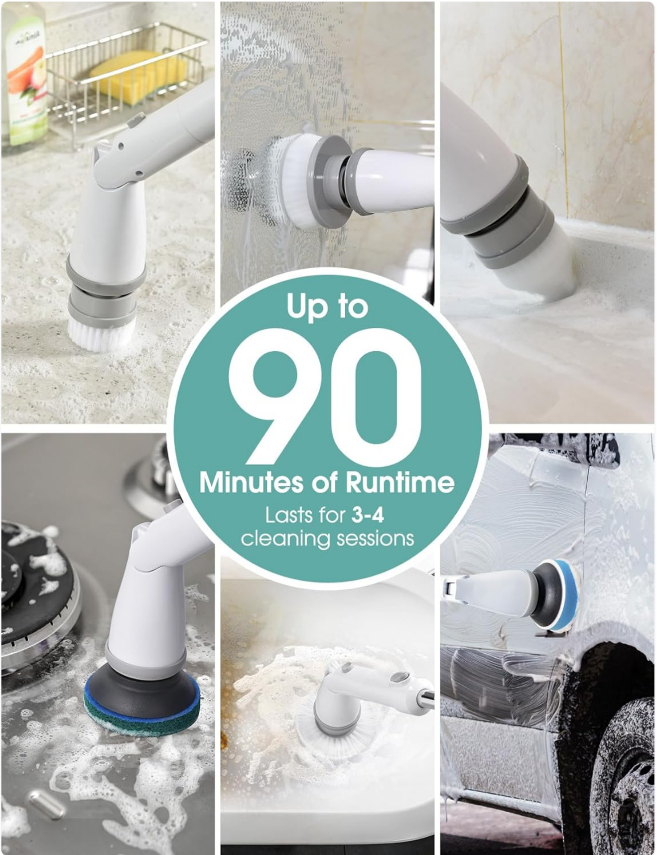
Image: The electric spin scrubber being used to clean a tiled shower wall, highlighting its ability to clean vertical surfaces.