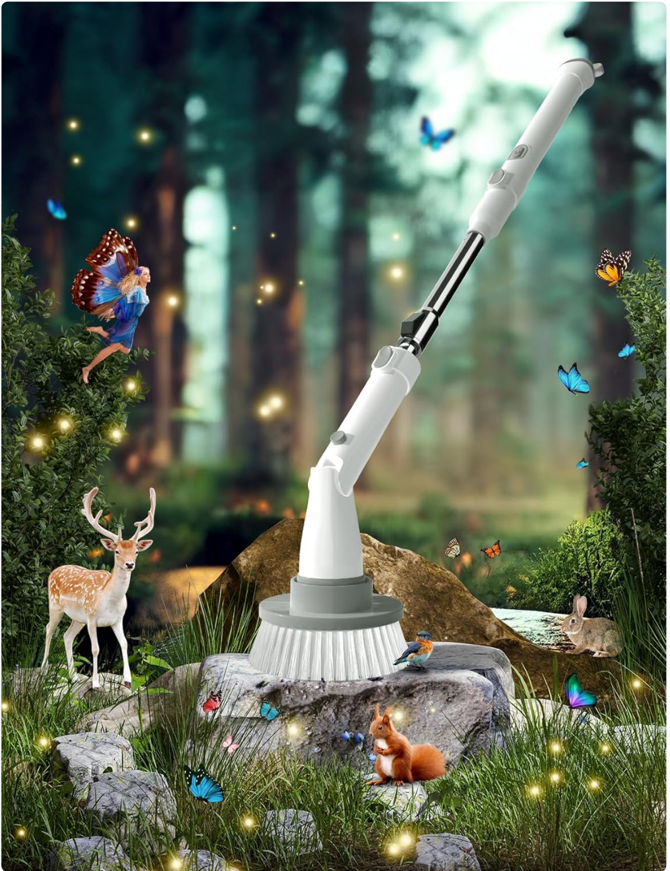
Image: The Sweepulire Electric Spin Scrubber with its handle fully extended, illustrating how the device can be adjusted for different reach requirements.