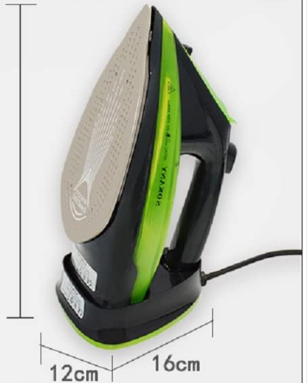
Image: A diagram showing the specifications and dimensions of the SOKANY AJ2085 steam iron, including power, voltage, and frequency.