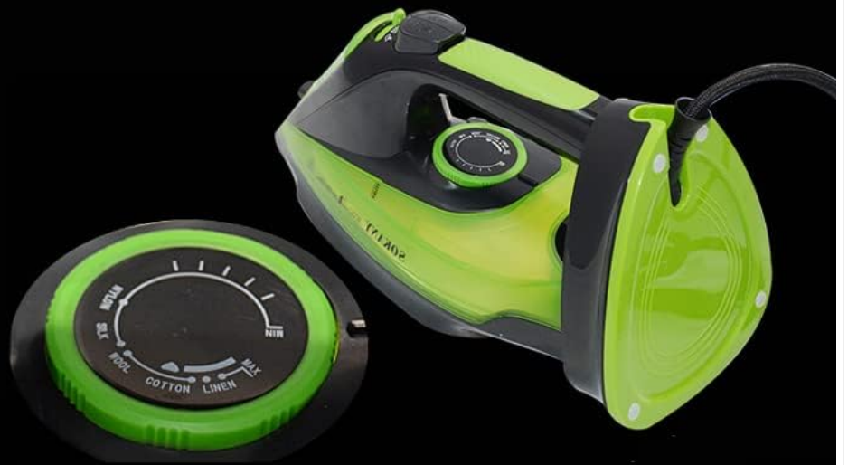
Image: A detailed view of the SOKANY AJ2085 iron, highlighting its adjustable temperature control dial, water storage bin, and adjustable steam volume controls.