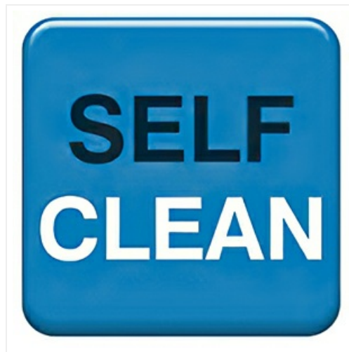
Image: A blue square icon with the text "SELF CLEAN", indicating the self-cleaning feature.