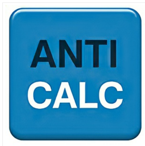
Image: A blue square icon with the text "ANTI CALC", indicating the anti-calc feature.

The integrated anti-calc system helps reduce the build-up of limescale, prolonging the life and efficiency of your iron. Regular use of the self-cleaning function complements this system.