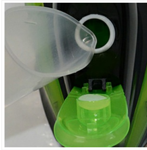
Image: A hand pouring water from a plastic container into the iron's water tank.