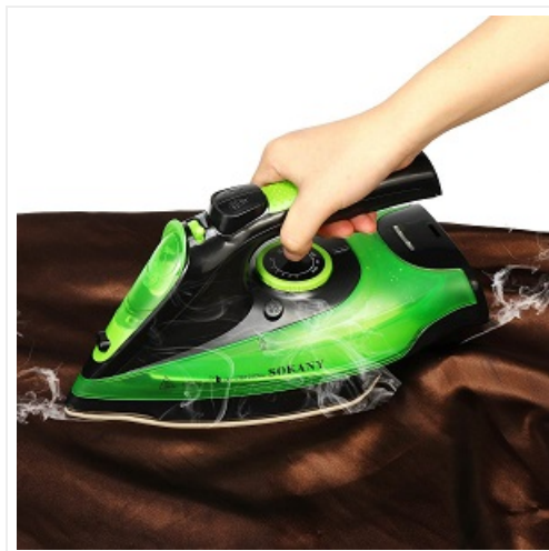
Image: A person actively using the SOKANY AJ2085 iron to smooth out wrinkles on clothing.

The iron can be used for vertical steaming of hanging garments, curtains, or drapes. Hold the iron vertically a few centimeters away from the fabric and press the steam burst button. Ensure the water tank is sufficiently filled.