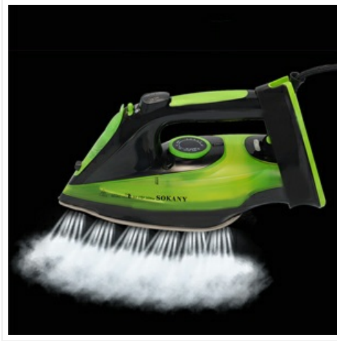
Image: The green and black SOKANY AJ2085 iron releasing a powerful burst of steam from its soleplate.