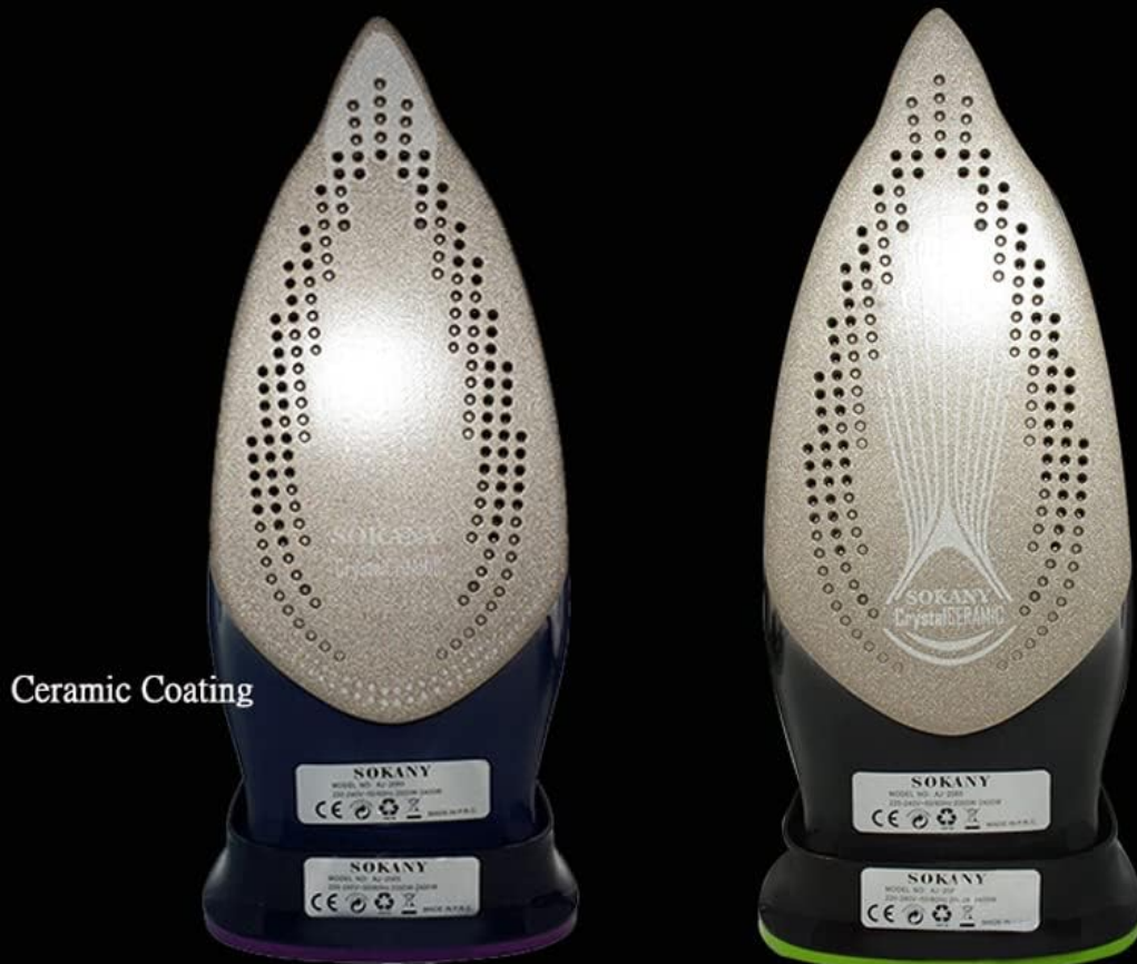
Image: The SOKANY AJ2085 cordless steam iron on its charging base, showcasing its green and black design.

Large contact area and large steam output