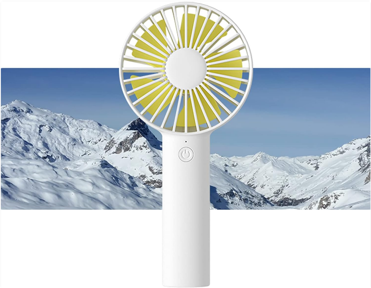
Image: Front view of the JISULIFE Handheld Mini Fan in white, showcasing its compact design and fan blades.