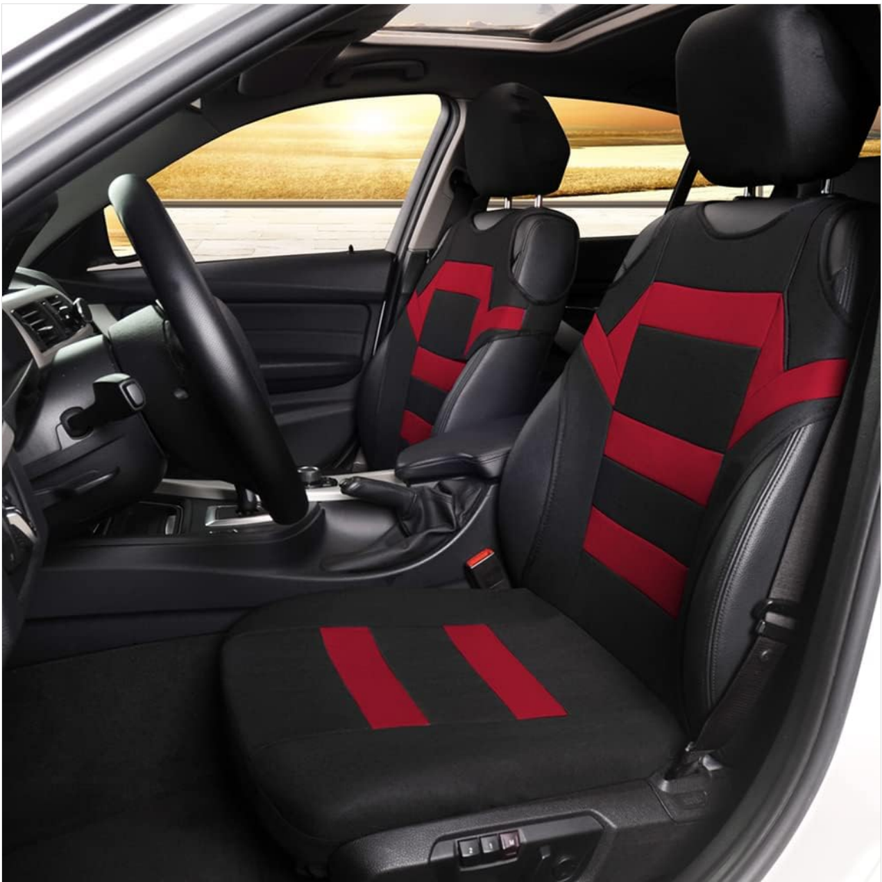
Image Description: A wide shot of the MAITE car seat covers installed on the front seats of a vehicle. The covers feature a striking red and black two-tone design, enhancing the car's interior aesthetics. The image highlights the overall fit and appearance of the covers.