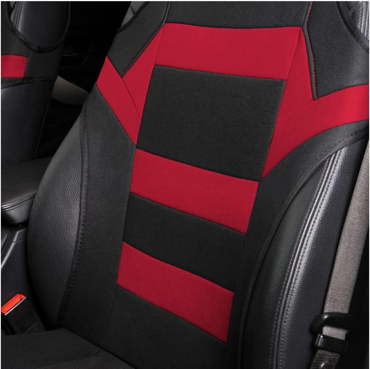
Image Description: A detailed shot of the seat back portion of the MAITE car seat cover. It showcases the intricate geometric red patterns against the black fabric, highlighting the design elements and stitching quality of the product.