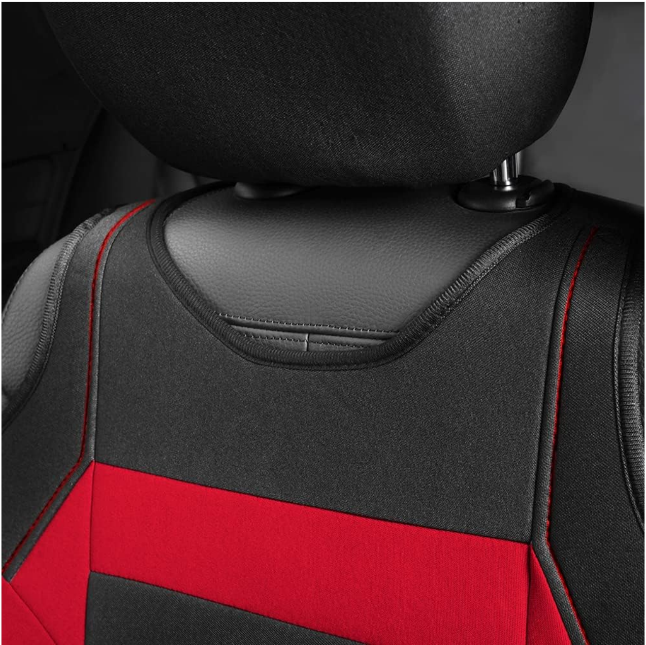
Image Description: A close-up image of the upper part of the seat cover, specifically around the headrest area. It demonstrates how the cover fits around the headrest posts, emphasizing the design that accommodates detachable headrests and the neat finish.