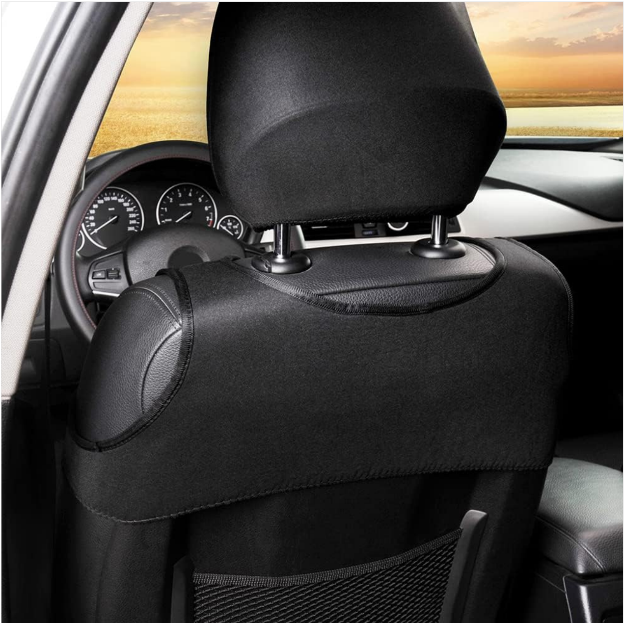
Image Description: This image provides a view of the back of the MAITE car seat cover once installed. It shows the full coverage provided to the rear of the seat and highlights a mesh storage pocket, indicating additional functionality.