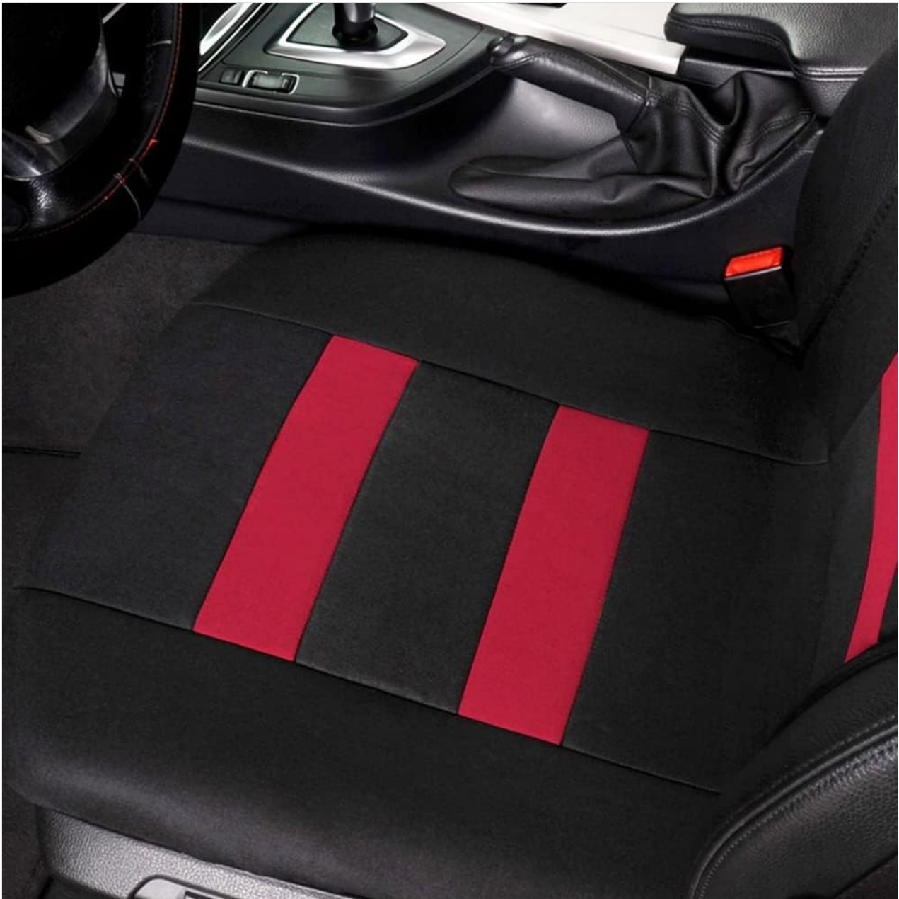
Image Description: A close-up view focusing on the seat base of the MAITE car seat cover. This image clearly shows the texture of the fabric and the distinct red stripe design on the black background, emphasizing the material quality and pattern.