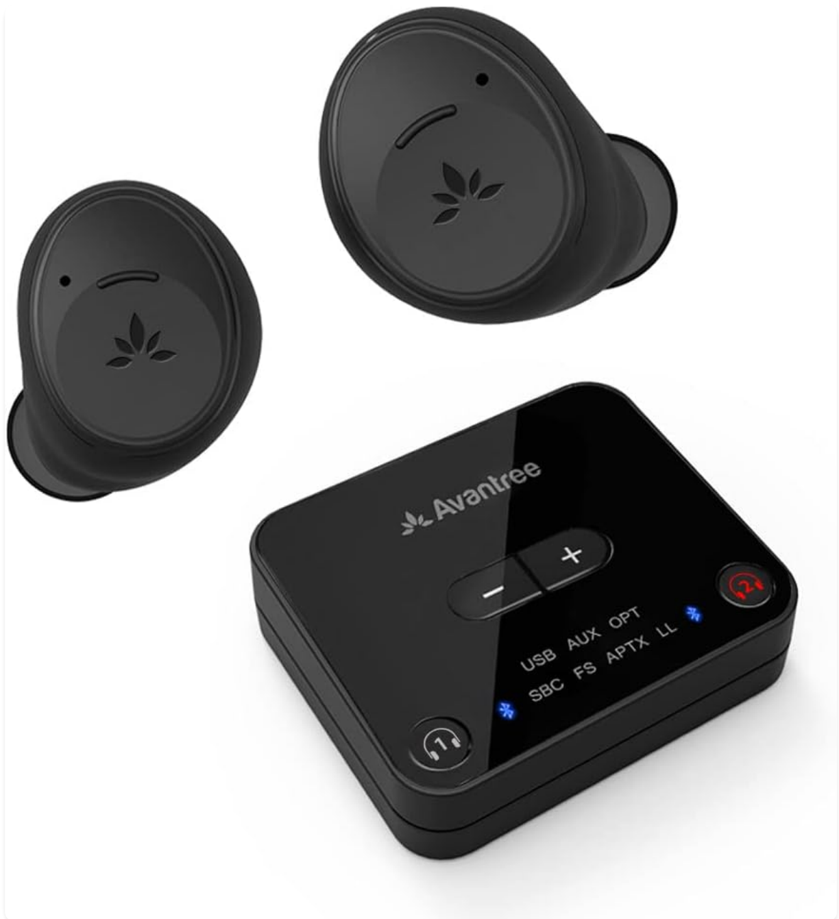
Avantree Ace T40 True Wireless Earbuds and Transmitter.