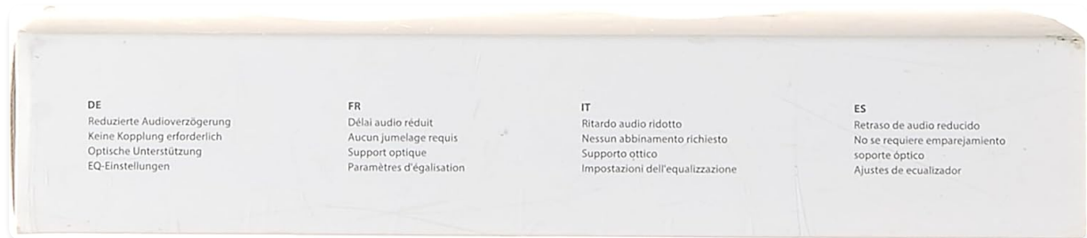
The Avantree Ace T40 True Wireless Earbuds.