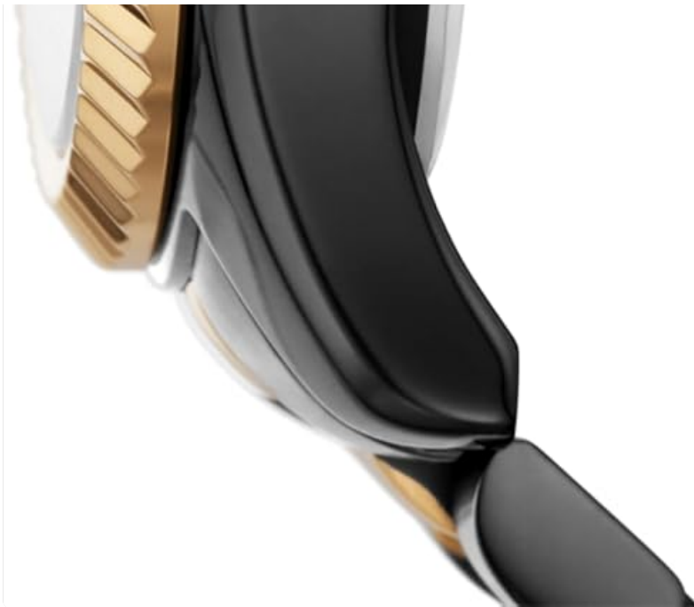
Side view of the watch, highlighting the crown and pushers used for setting time and operating chronograph functions.