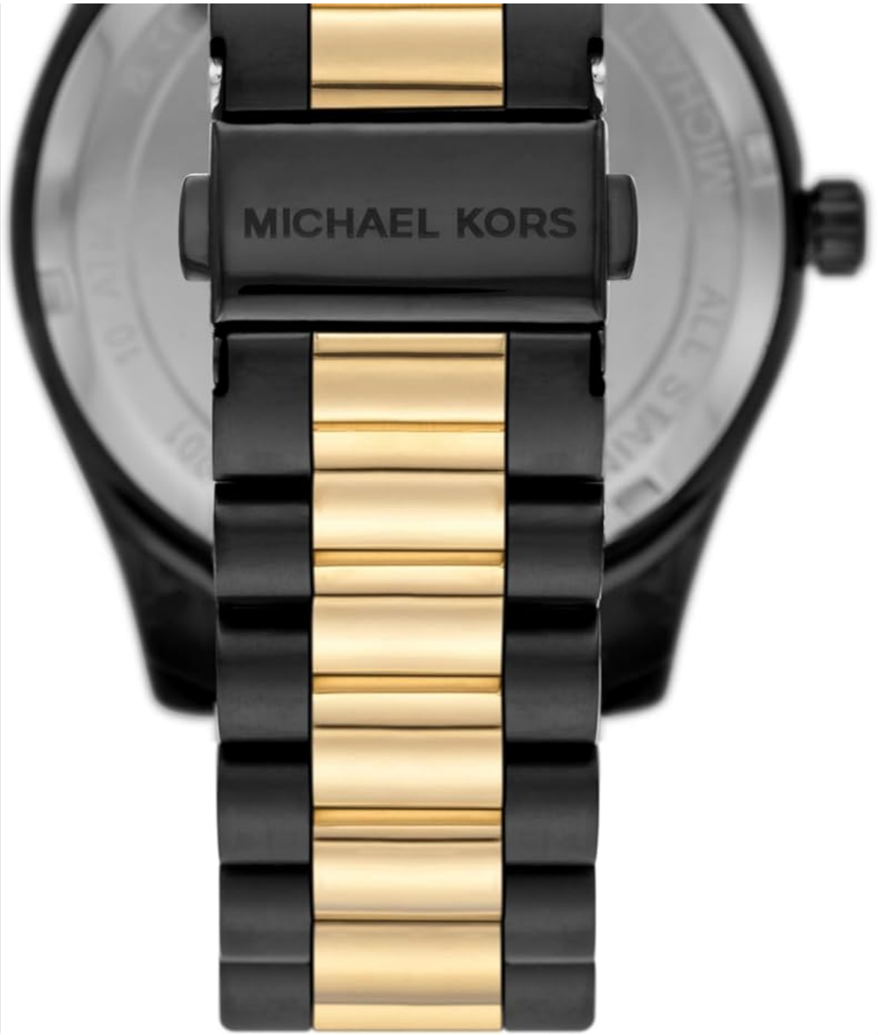
Rear view of the watch band, showing the clasp mechanism. Adjustments to the band size may require professional assistance.