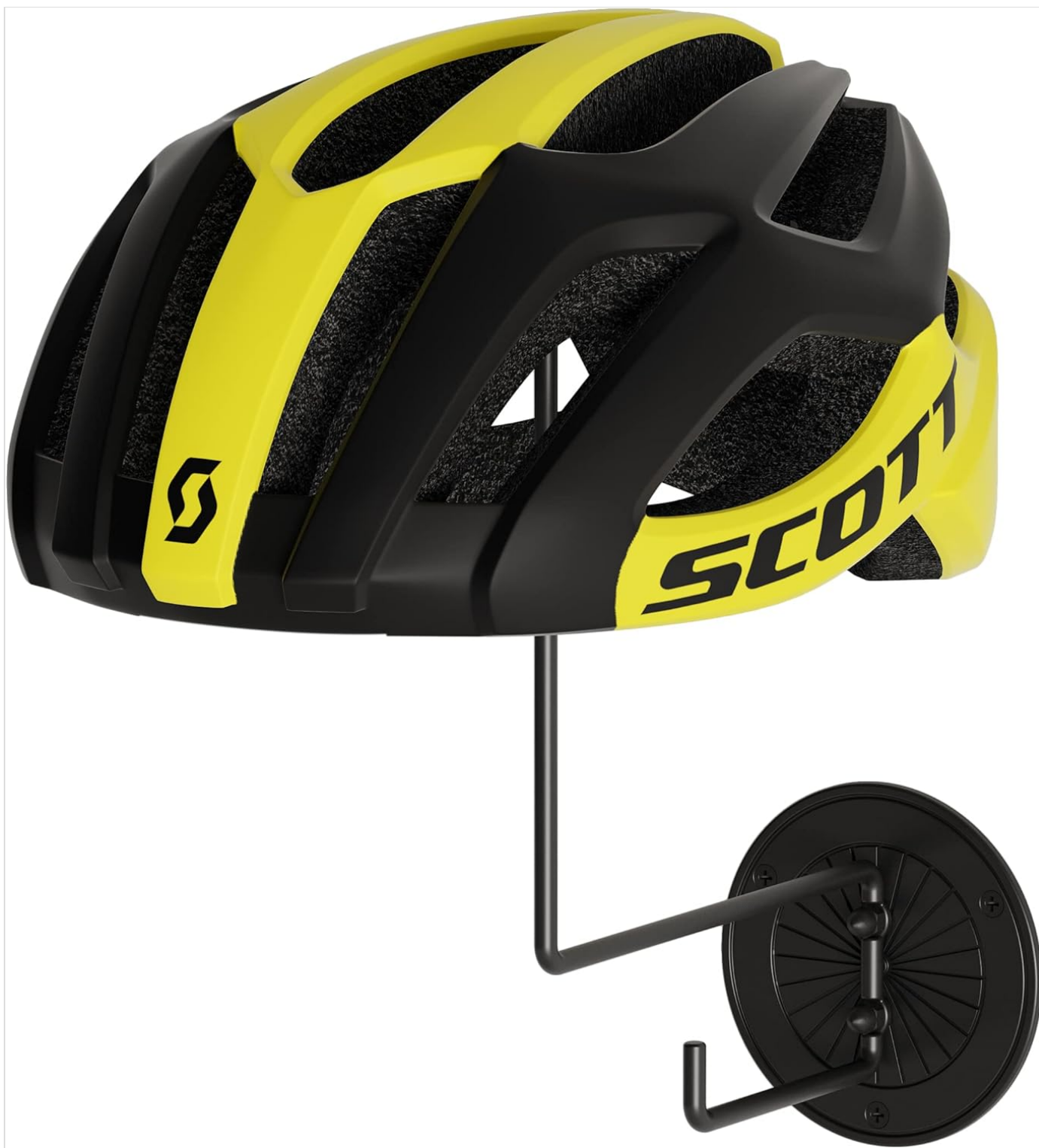
The helmet holder securely displaying a bicycle helmet.