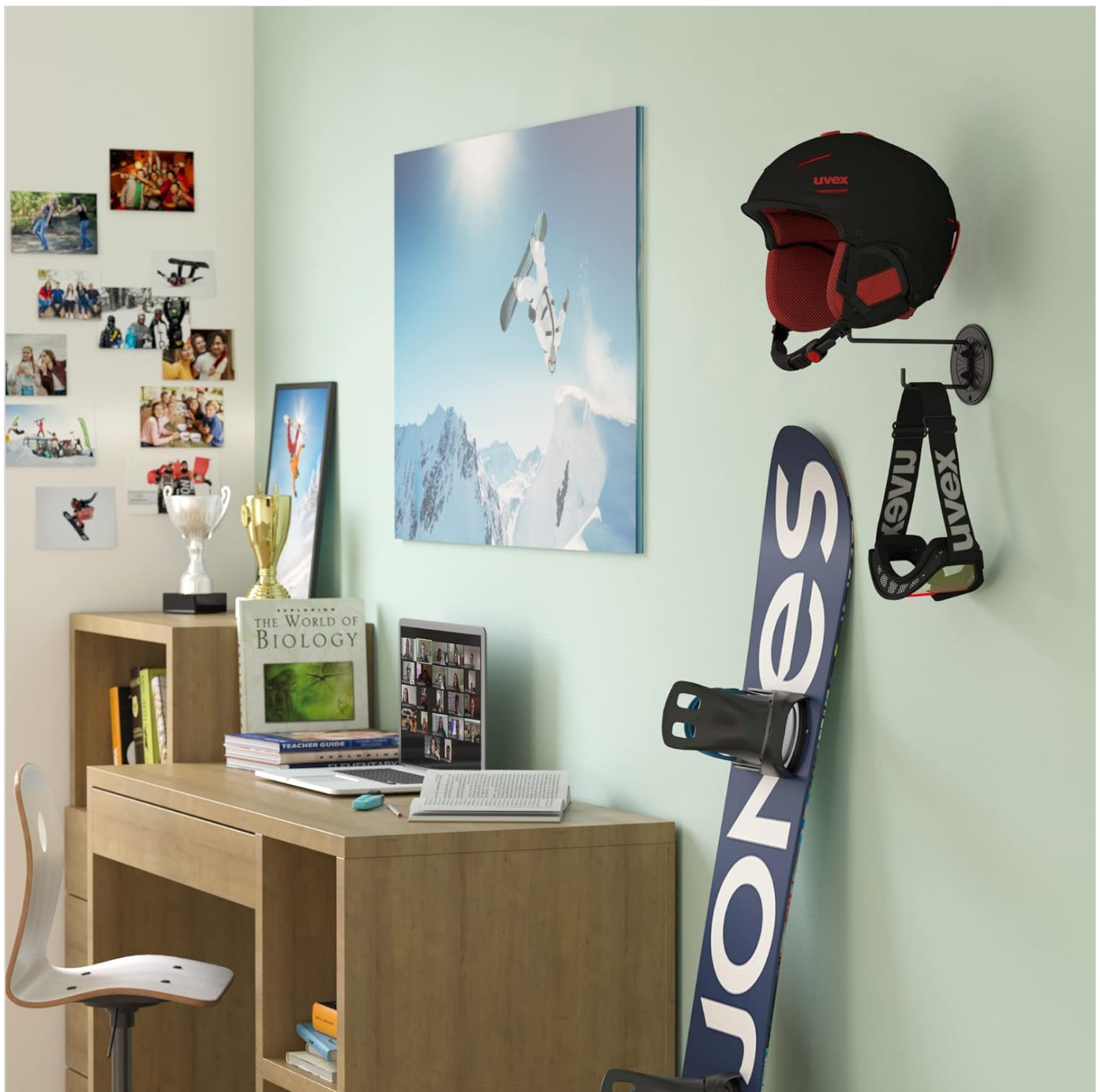
The helmet holder used in a child's room to display a ski helmet and goggles.