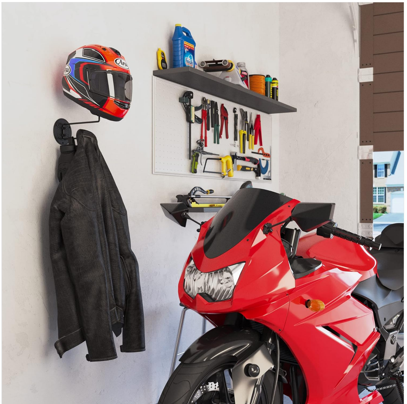
The helmet holder in a garage setting, holding a motorcycle helmet and jacket.