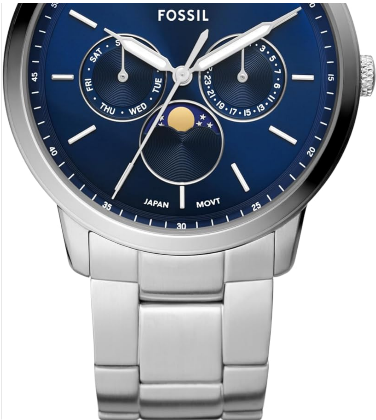
Front view of the Fossil Neutra Quartz Watch, showcasing its blue sunray dial and stainless steel bracelet.