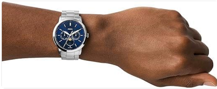
The Fossil Neutra watch worn on a wrist, demonstrating its fit and appearance.