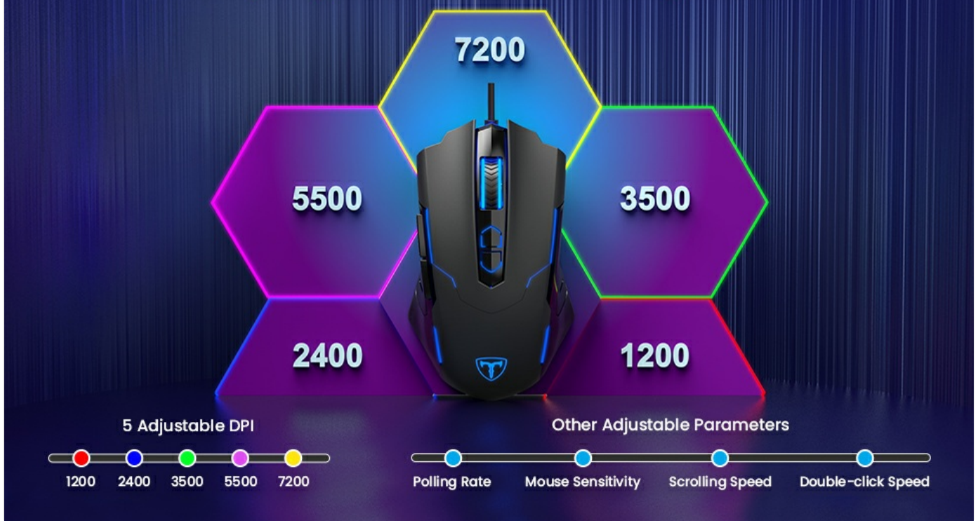
Image: A graphic detailing the various adjustable parameters including DPI, polling rate, mouse sensitivity, scrolling speed, and double-click speed.