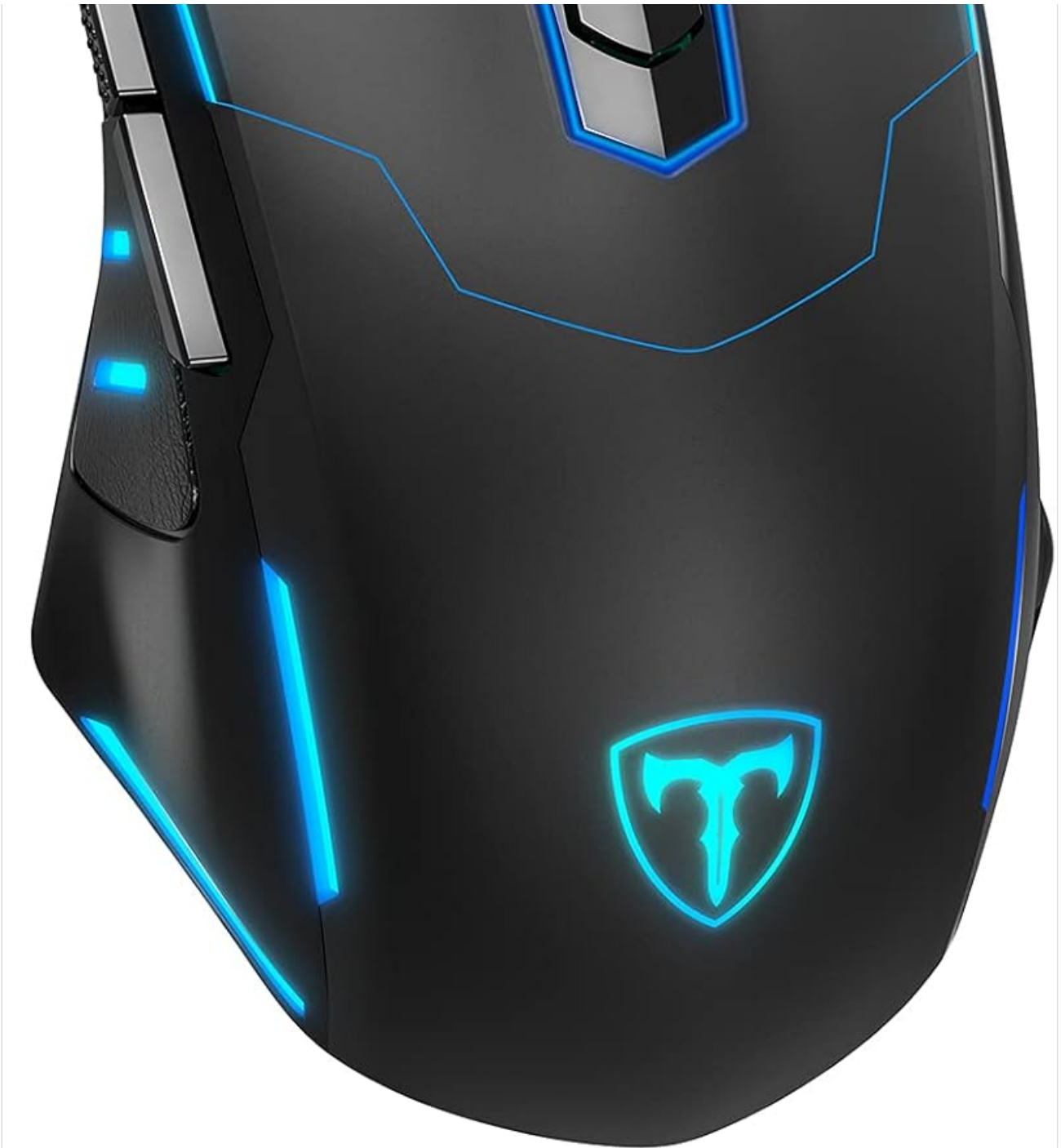
Image: The WEEMSBOX T7 Wired Gaming Mouse, showcasing its ergonomic design and vibrant blue RGB lighting elements.