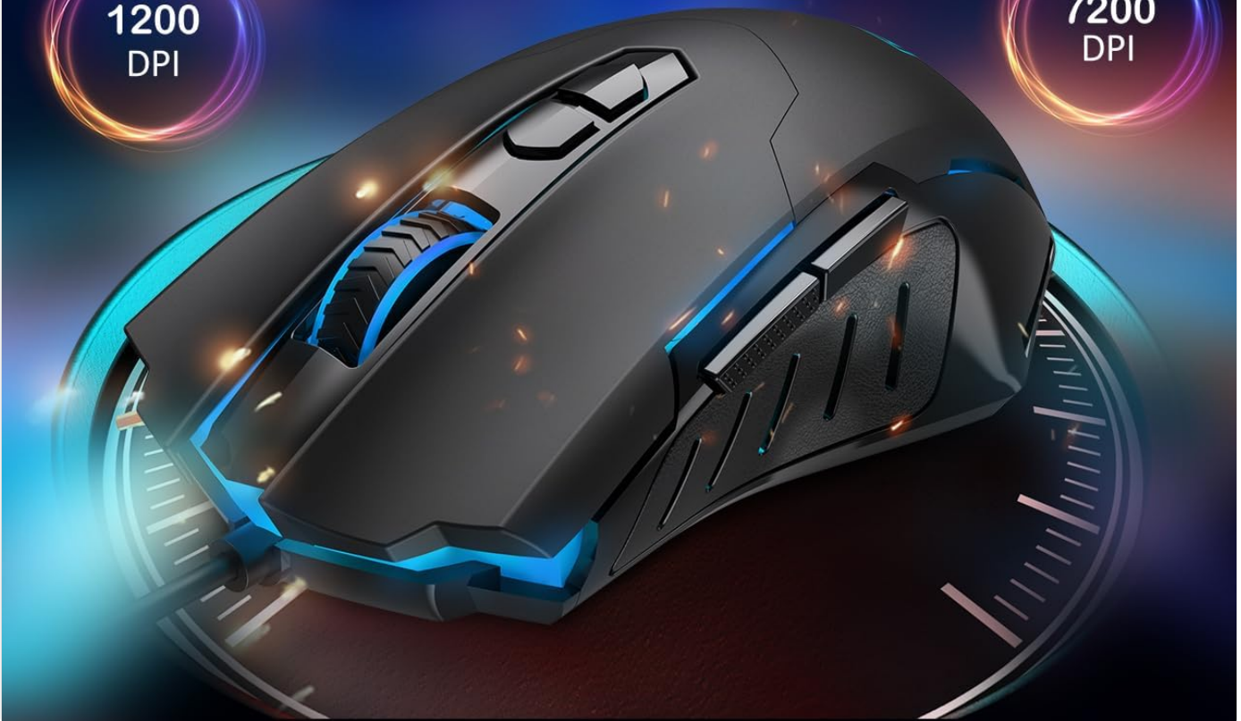
Image: Visual representation of the five adjustable DPI settings available on the WEEMSBOX T7 Gaming Mouse.