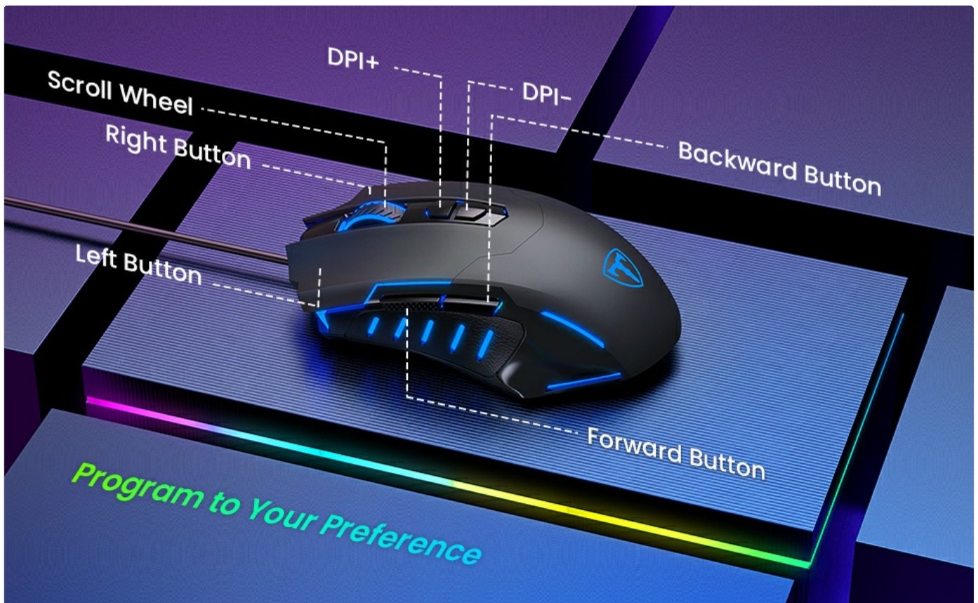
Image: A clear diagram indicating the location and default function of each of the mouse's buttons.