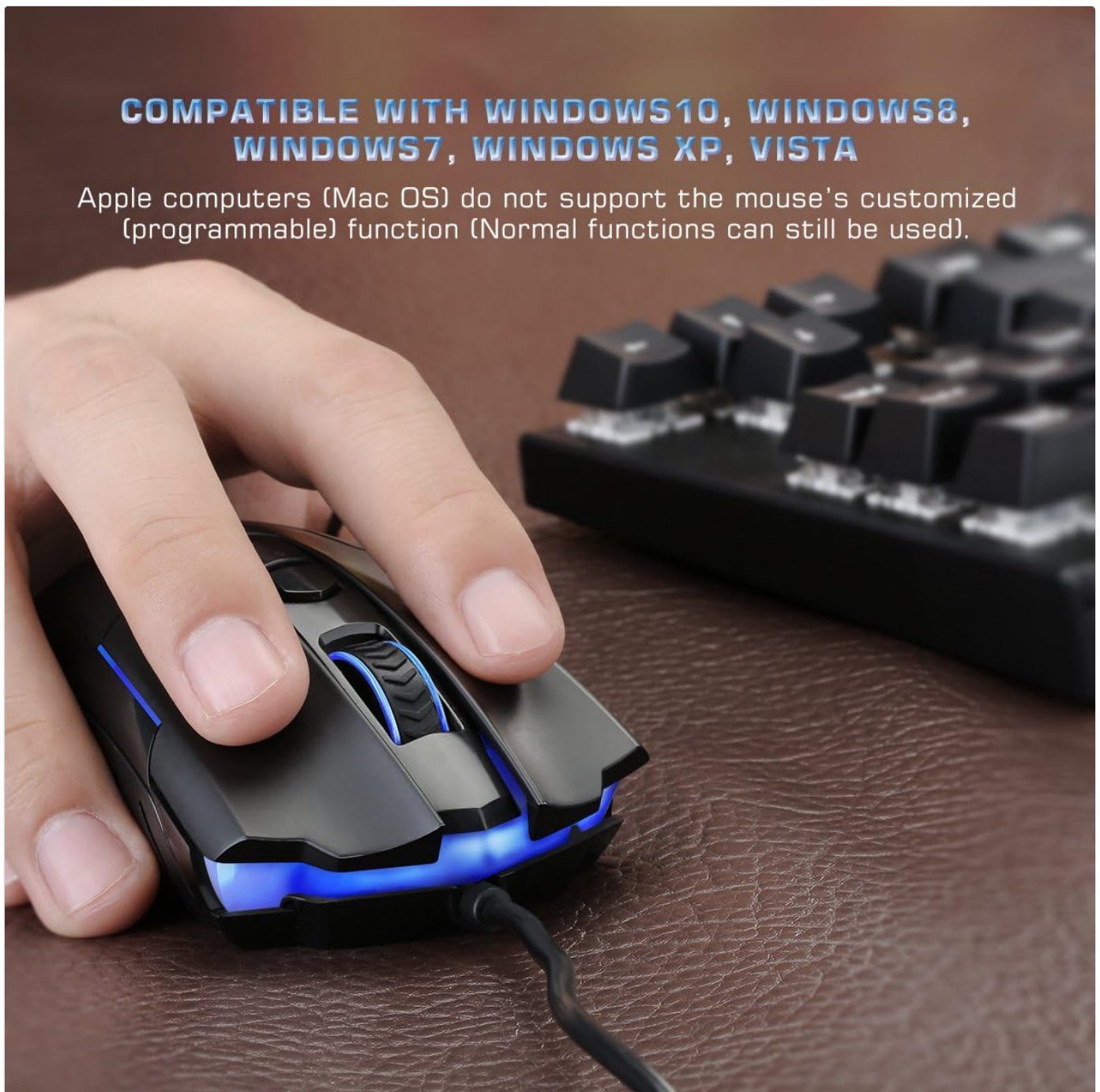
Image: A hand operating the WEEMSBOX T7 mouse, highlighting its wired connection and compatibility with various operating systems.