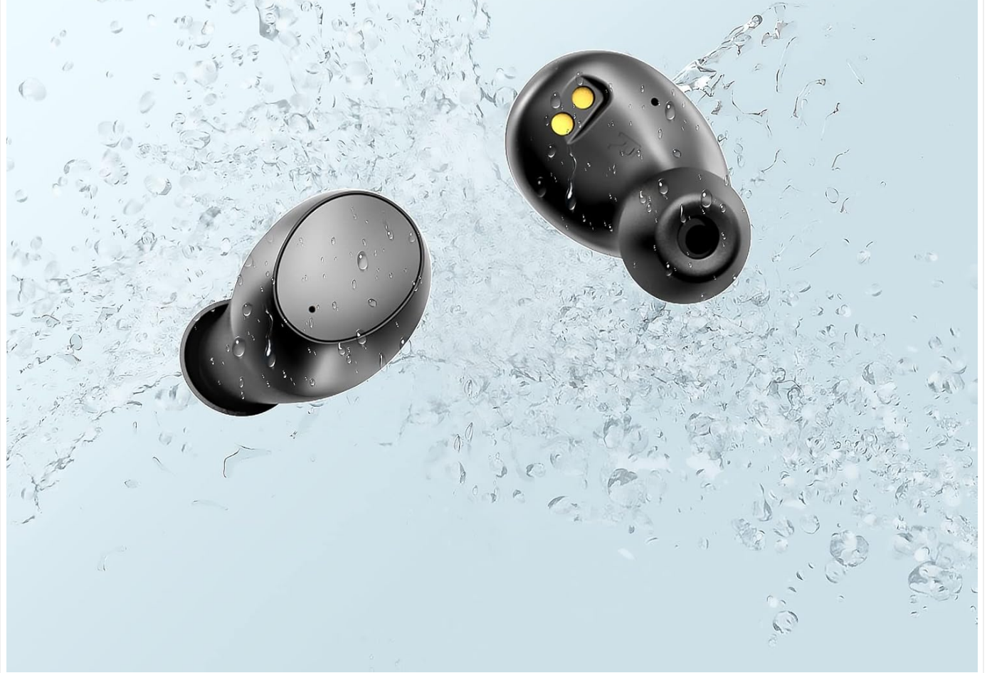
Figure 5.1.1: IPX5 Waterproof Protection

IPX5 waterproof design to protect the earbuds damaged from sweat when in exercise