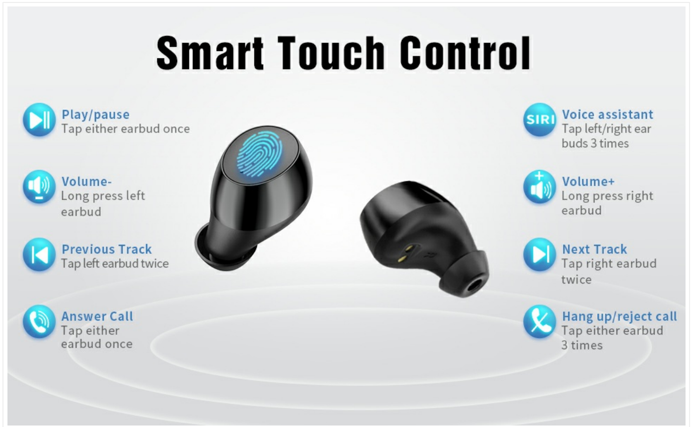
Figure 4.1.1: Smart Touch Control Functions

The Lanteso S21 earbuds feature intuitive touch controls on each earbud. Refer to the diagram below for specific functions: