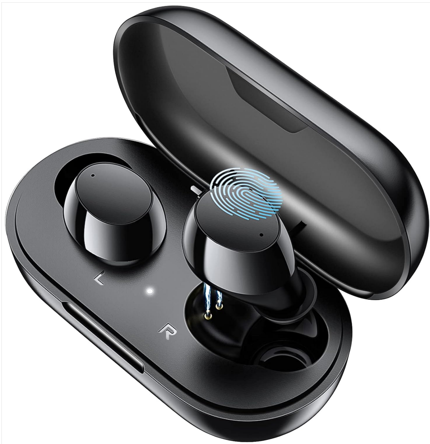
Figure 2.2.1: Lanteso S21 Earbuds and Charging Case

This image displays the Lanteso S21 Wireless Earbuds placed within their open charging case. The earbuds are black, compact, and show their charging contacts. The case is also black with a smooth, matte finish, indicating its portable design.