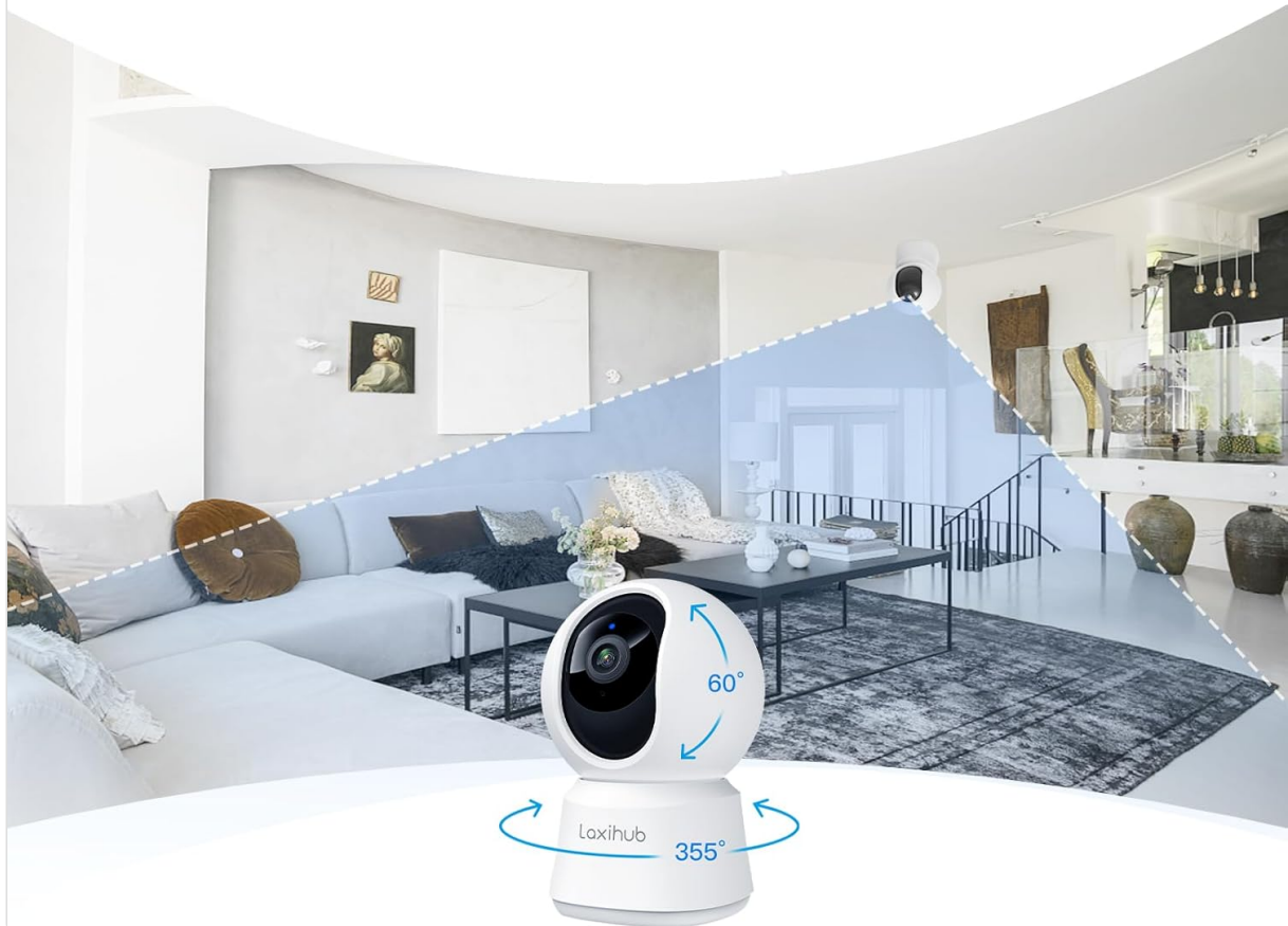
Image: The LAXIHUB P2 camera demonstrating its pan and tilt capabilities, providing a wide view of a living room.

Tilt 0°~60° and Pan 0°~355° Motion Detection