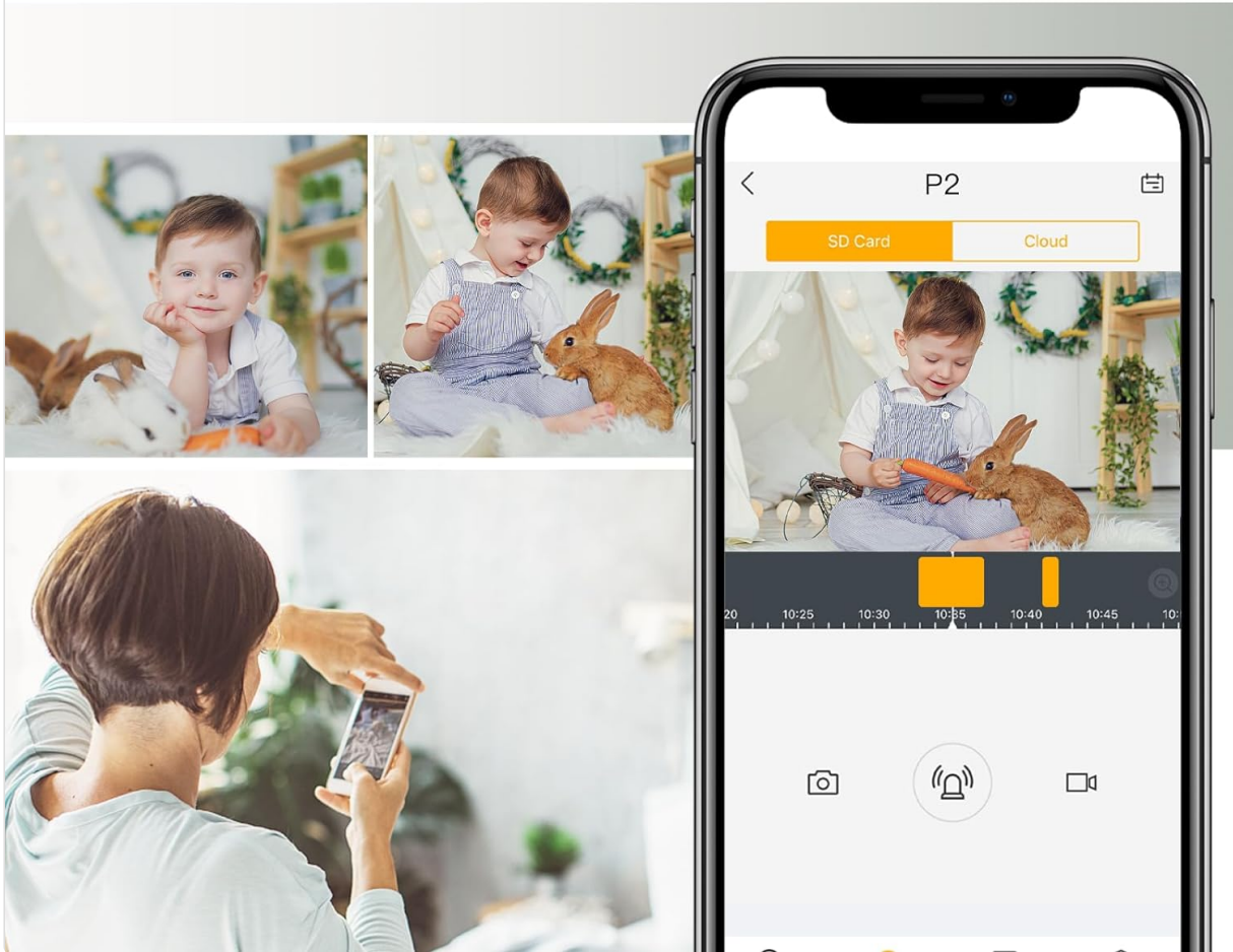
Image: The Arenti app interface on a smartphone, showing options for SD card and cloud storage, with a video playback of a baby.

180's video recording & unlimited sharing