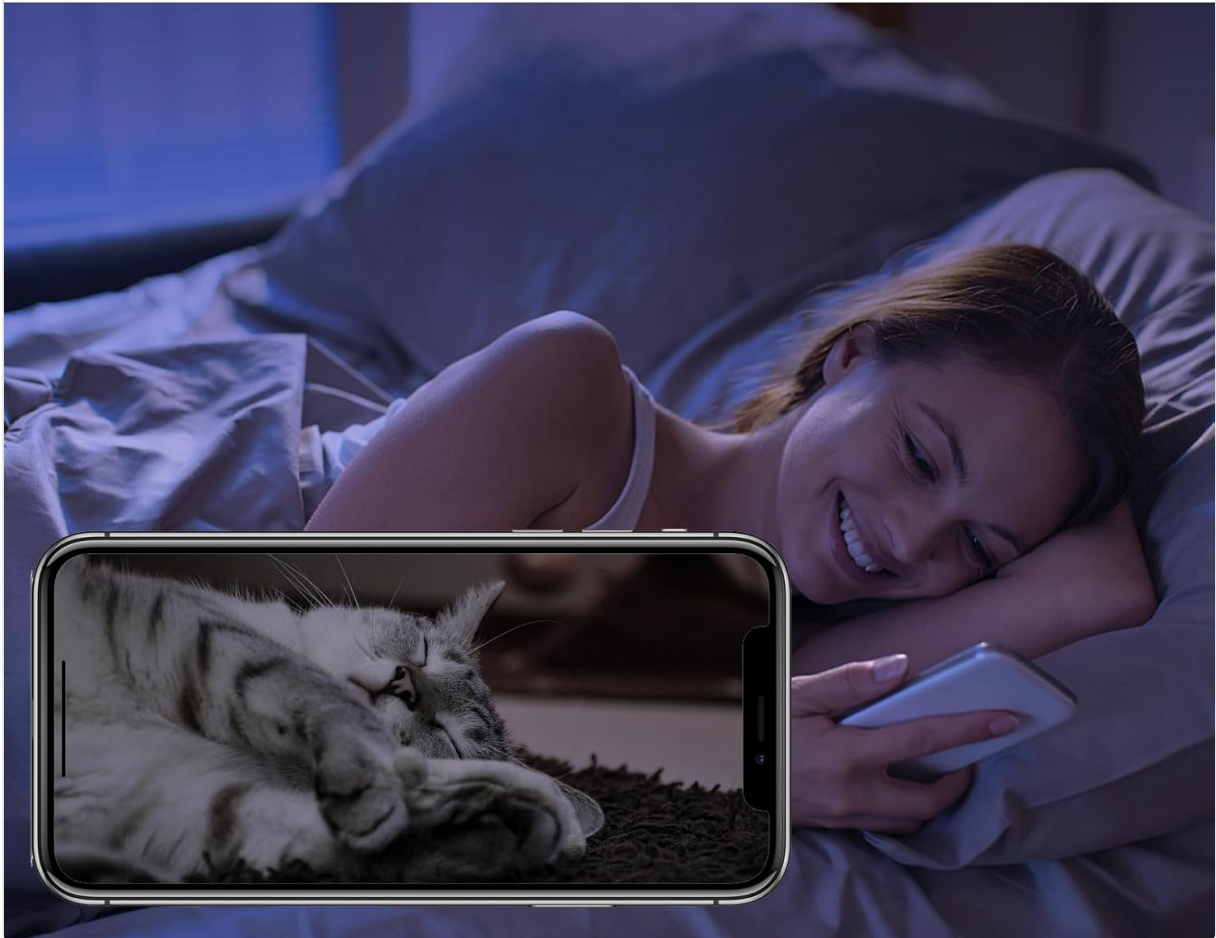
Image: A smartphone displaying clear night vision footage from the LAXIHUB P2 camera, showing a cat sleeping in a dark room.