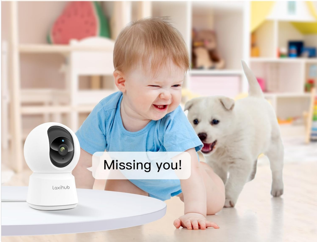
Image: Front view of the LAXIHUB P2 Indoor Security Camera, showcasing its compact design.