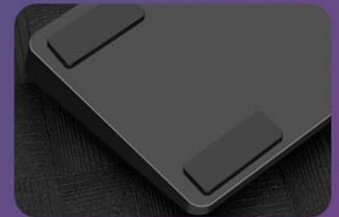
COUSSINET ANTIDÉRAPANT * 4

Image: The detachable wrist rest, made from a soft, leather-like material, designed to provide comfort and reduce wrist strain. Anti-slip pads are visible on the underside.