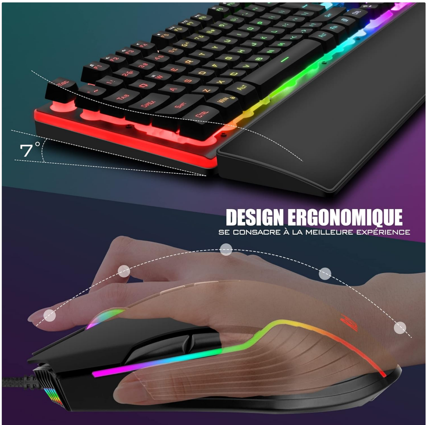
Image: Close-up view of the ergonomic design of the RedThunder K10 keyboard and mouse, demonstrating comfortable hand and wrist positioning for prolonged use.