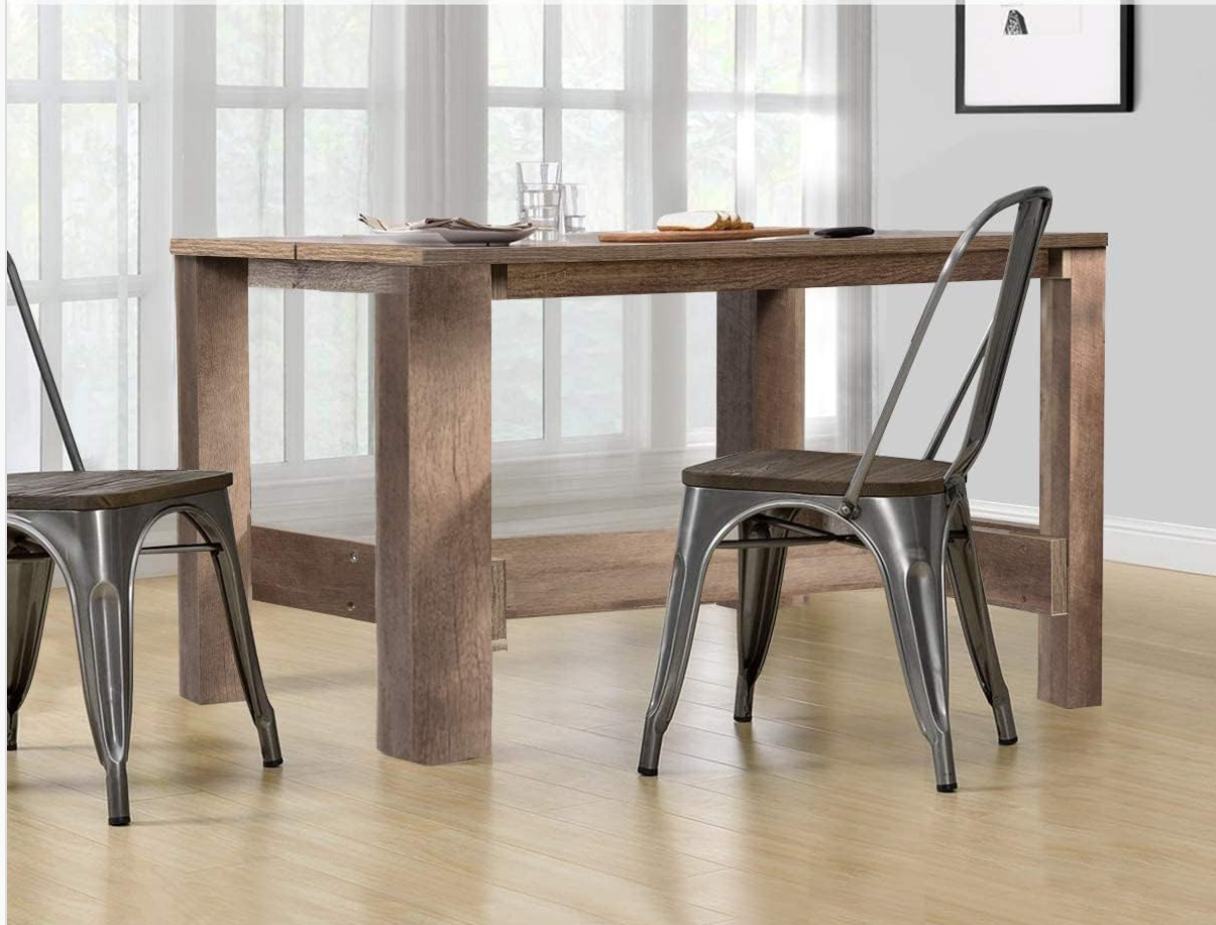
Image 4.2: The assembled table in a typical use environment, demonstrating its sturdy construction.