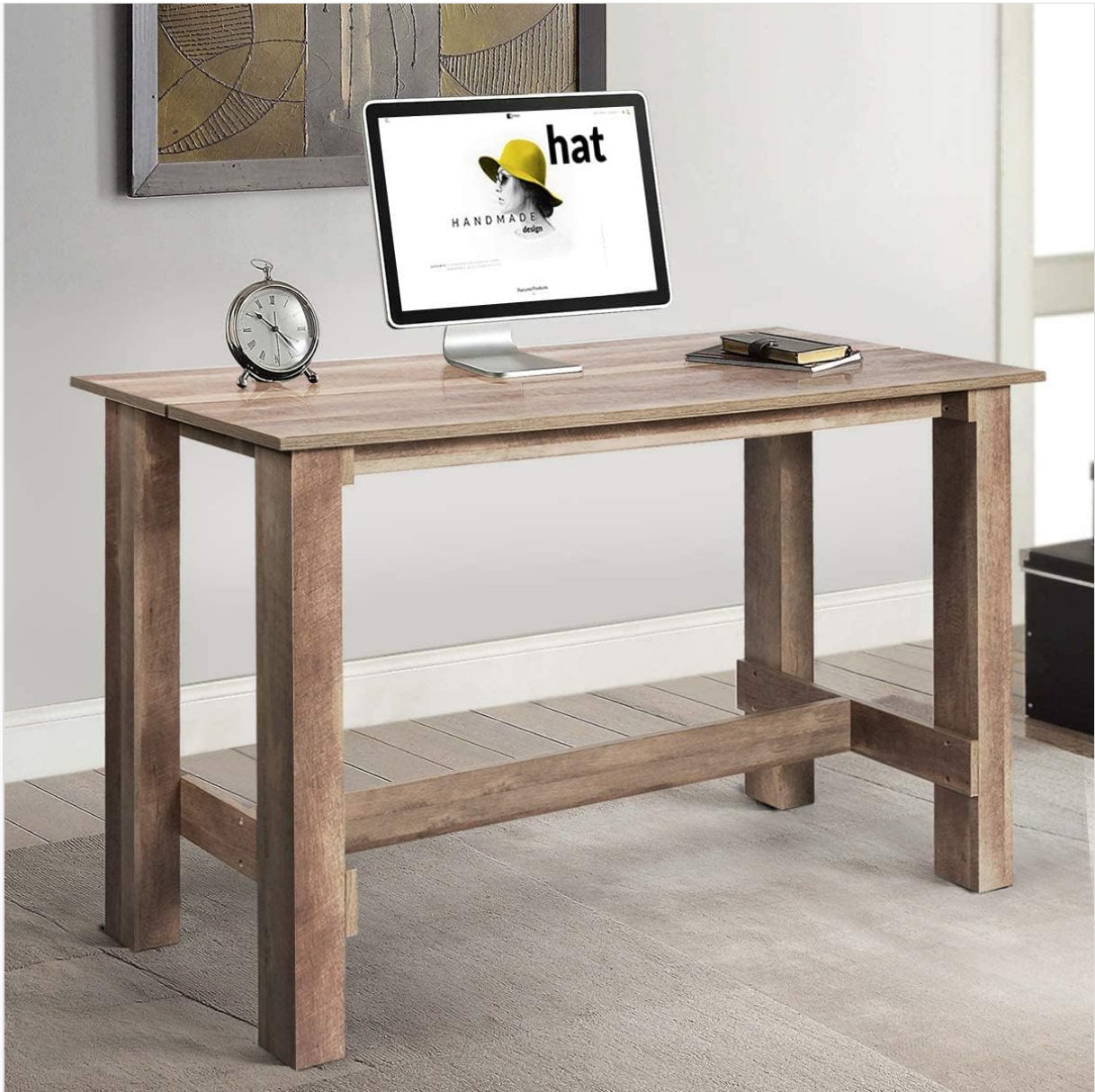
Image 5.1: The table configured as a home office desk, demonstrating its adaptability.