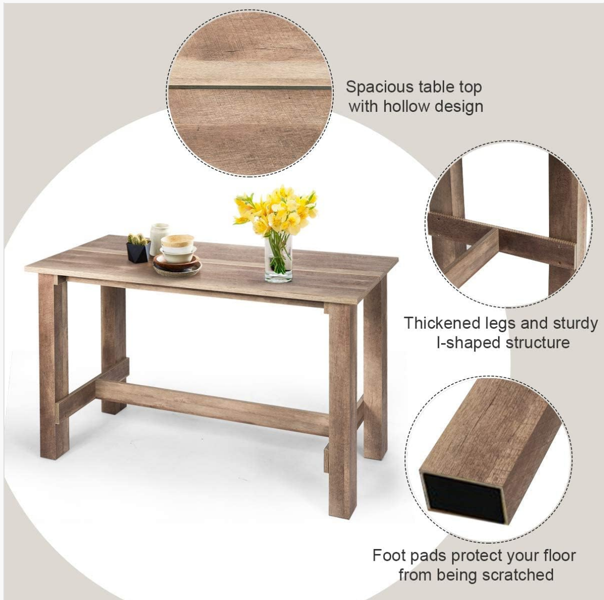
Image 3.1: Illustration of key table components and features, including the tabletop, thickened legs, and footpads.