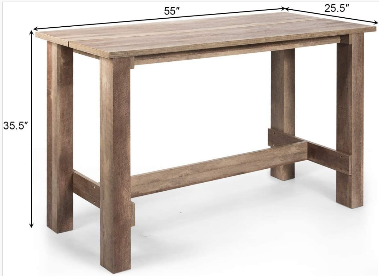
Image 4.1: Table dimensions for reference during assembly and placement.