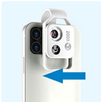
Step 2 of installation: Adjust the microscope horizontally to align with the phone's main camera.