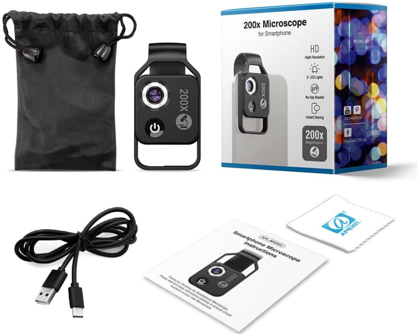
Image showing the microscope package contents: microscope unit, USB-C charging cable, storage bag, dust-proof cloth, and instruction manual.