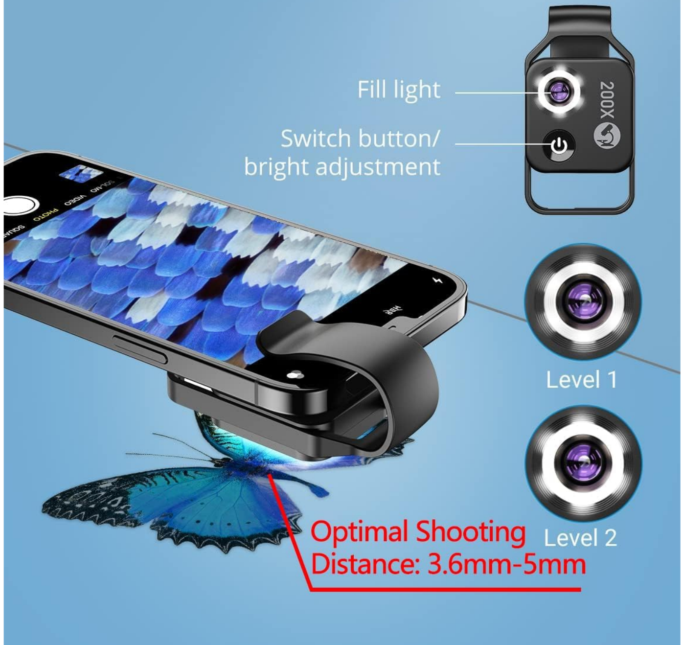
The microscope unit showing its built-in LED light with two brightness levels and optimal shooting distance.