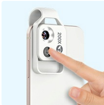
Step 3 of installation: Press the power button on the microscope to turn on the LED light.