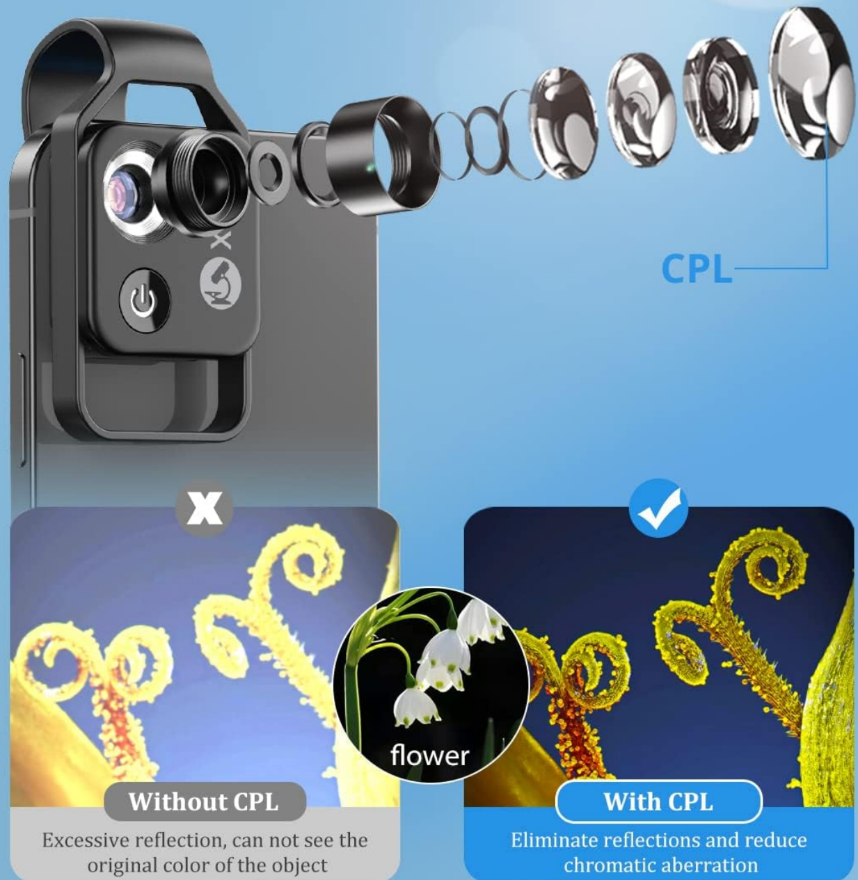
An exploded view of the microscope lens assembly, highlighting the CPL (polarizing filter) and its effect on reducing reflections in magnified images.

Effectively eliminate the reflections and restore true colors of the objects