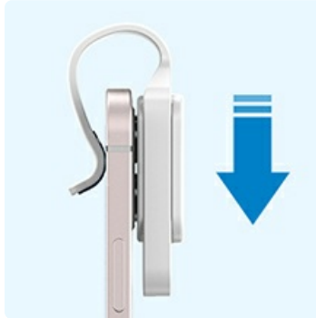
Step 1 of installation: Slide the microscope clip downwards onto the phone.