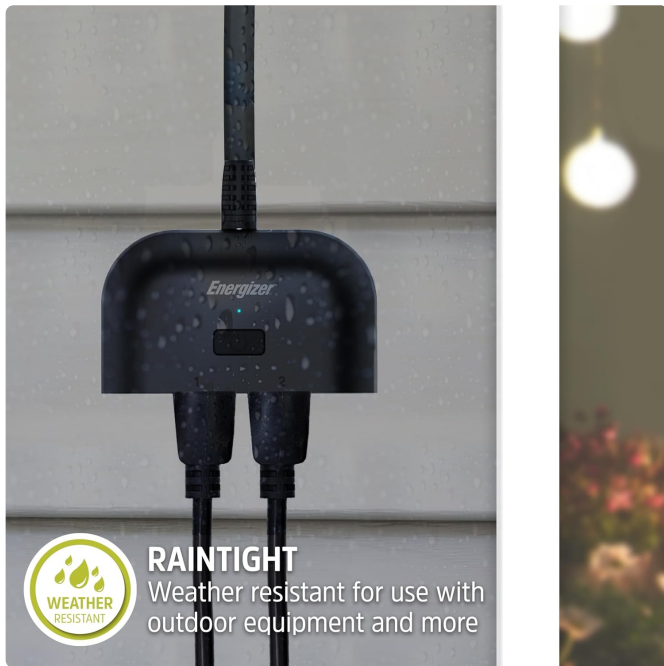
Image: The outdoor plug shown with water droplets, highlighting its weather-resistant capabilities.