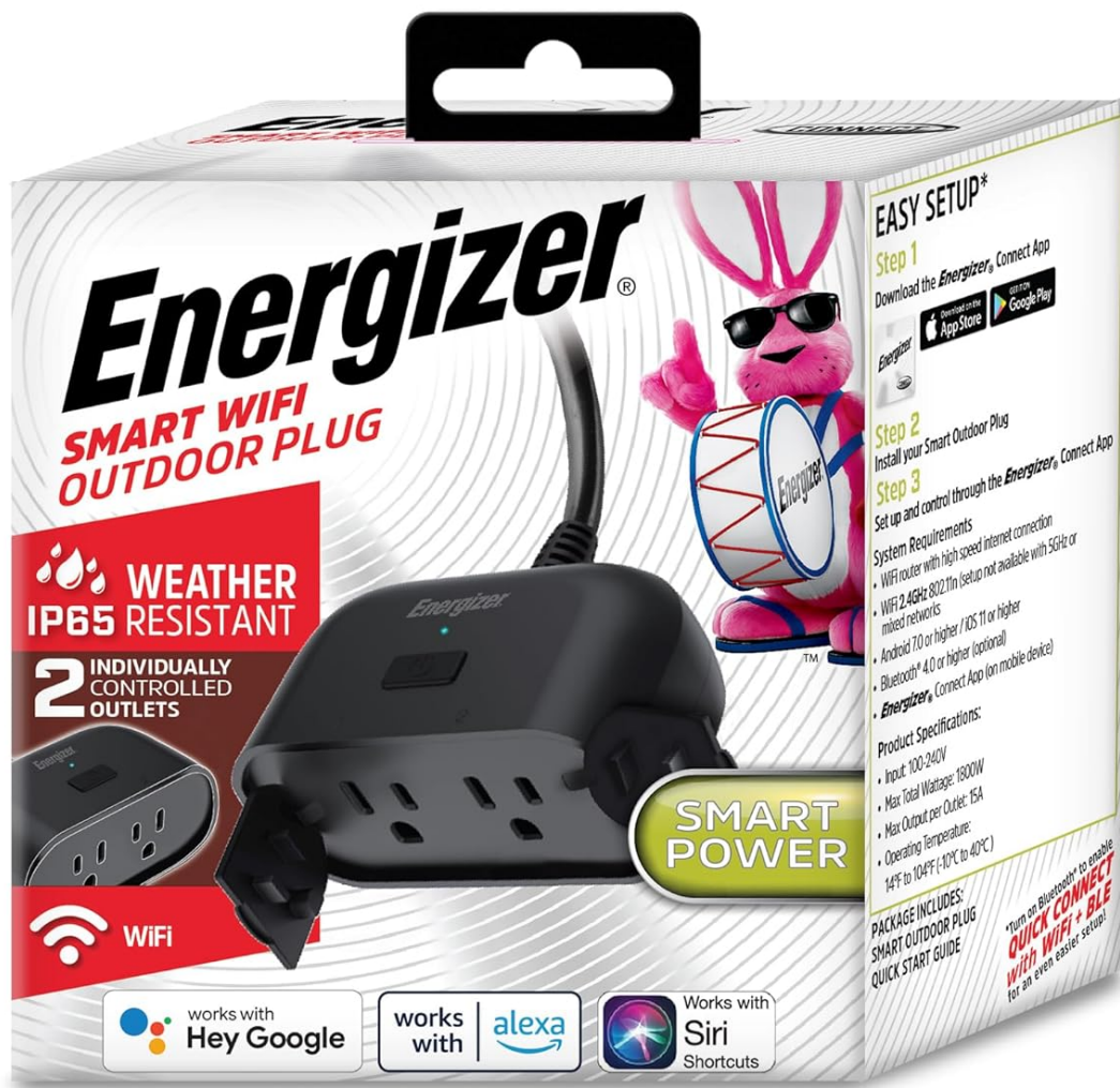
Image: The Energizer Smart Wi-Fi Outdoor Plug shown in its original packaging, indicating included items.