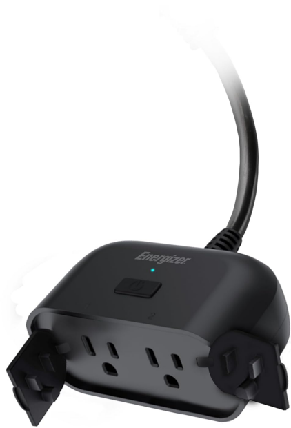
Image: Detail of the two outlets with protective covers and the hanging buckle.