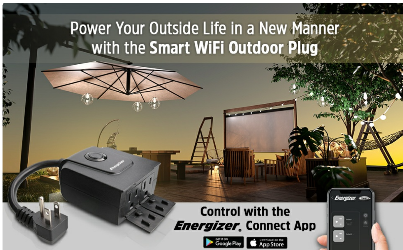
Image: The Energizer Smart Wi-Fi Outdoor Plug seamlessly integrated into an outdoor living space, controlled via a mobile application.

This manual provides comprehensive instructions for the installation, operation, and maintenance of your Energizer Smart Wi-Fi Outdoor Plug, Model EWO3-1002-BLK. This device allows you to control two individual outdoor outlets remotely via the Energizer Connect app, set schedules, and integrate with voice assistants like Alexa, Google Assistant, and Siri. Its water-resistant design ensures reliable performance in outdoor environments.