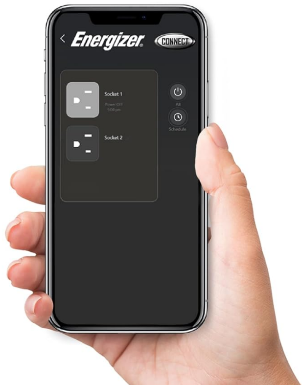
Image: The Energizer Connect app displaying individual controls for each of the two smart plug outlets.