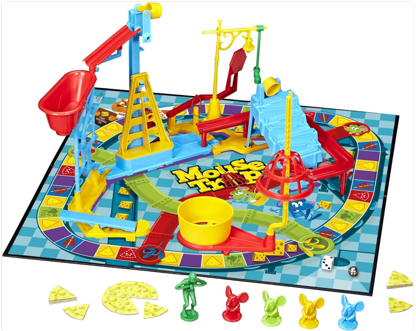
Figure 3: The complete Mouse Trap game setup, ready for play.

4. Keep the marble, die, and cheese wedges accessible for gameplay.