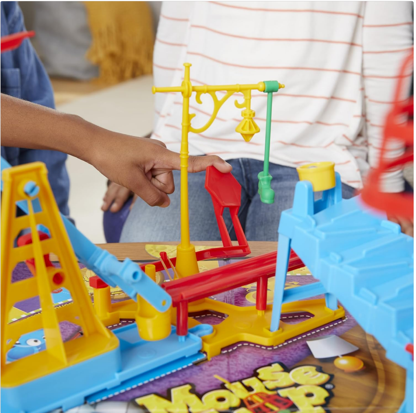
Figure 6: Activating the trap mechanism during gameplay.