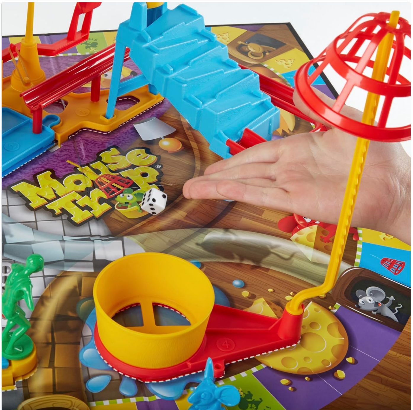
Figure 4: A close-up view of the intricate contraption, showing the detail of the assembled parts.