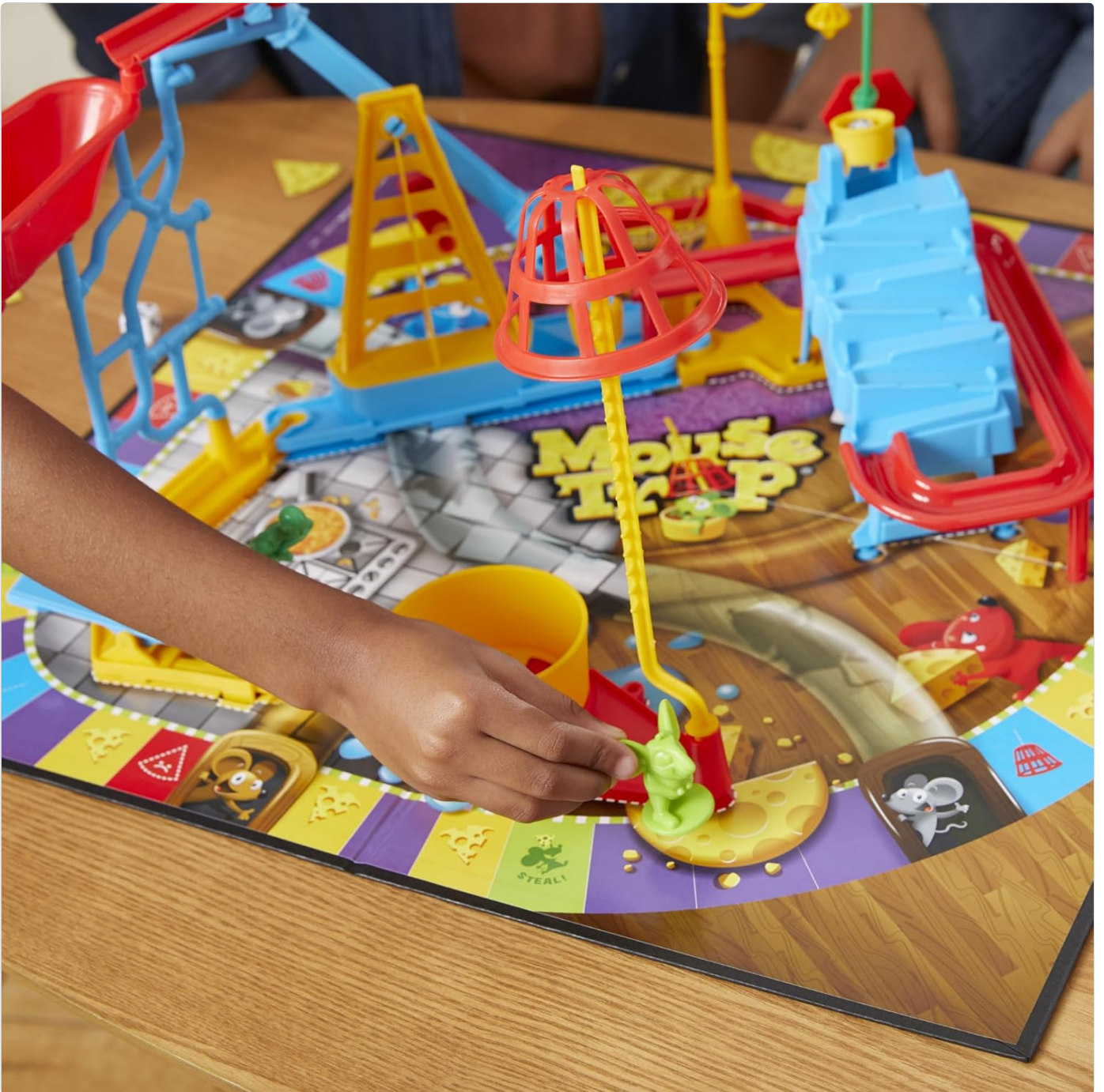
Figure 7: Players moving their mouse pawns across the board.