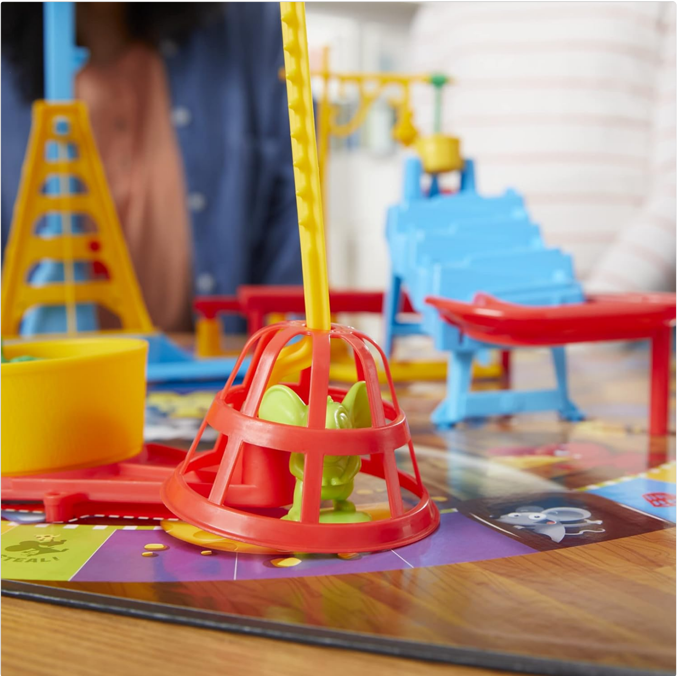
Figure 5: A mouse pawn successfully trapped by the contraption.

Video 1: Official gameplay overview of the Mouse Trap Board Game, demonstrating how to play and activate the trap.