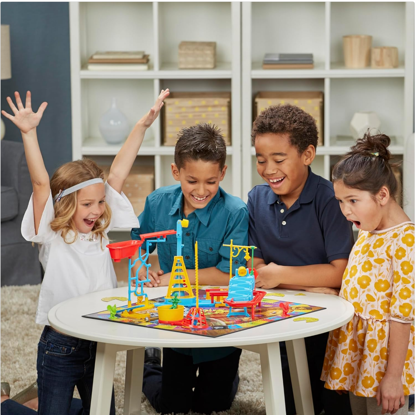
Figure 8: Family enjoying a game of Mouse Trap.