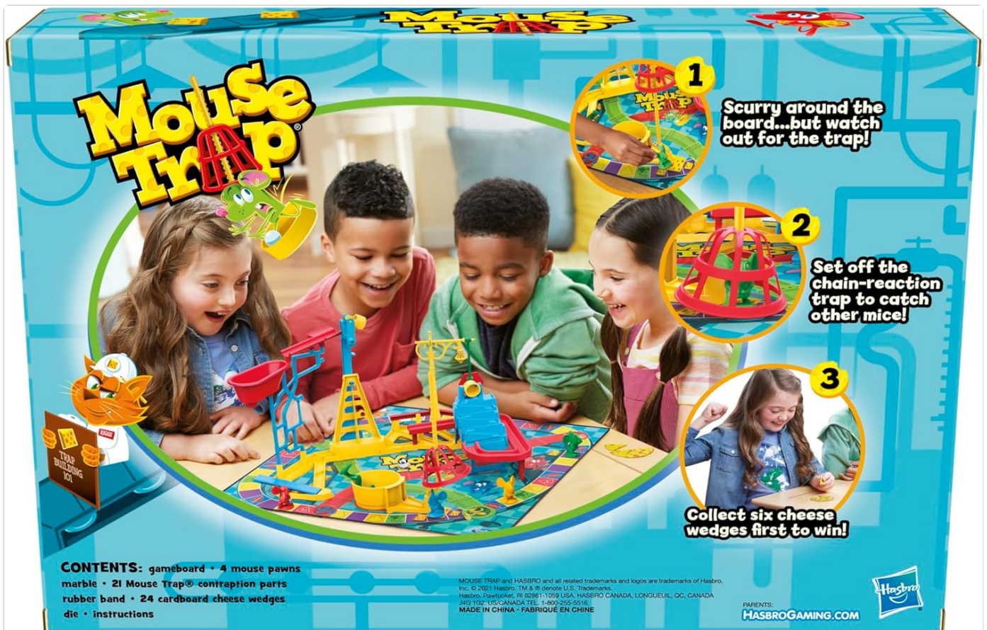
Figure 2: The back of the game box, illustrating the game components and a quick overview of play.