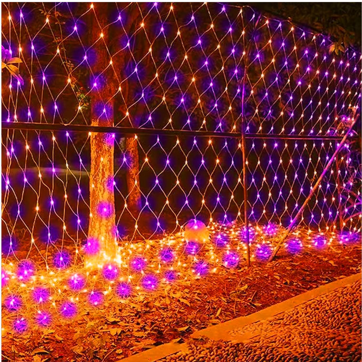
Figure 2: Dazzle Bright Net Lights illuminating an outdoor patio.