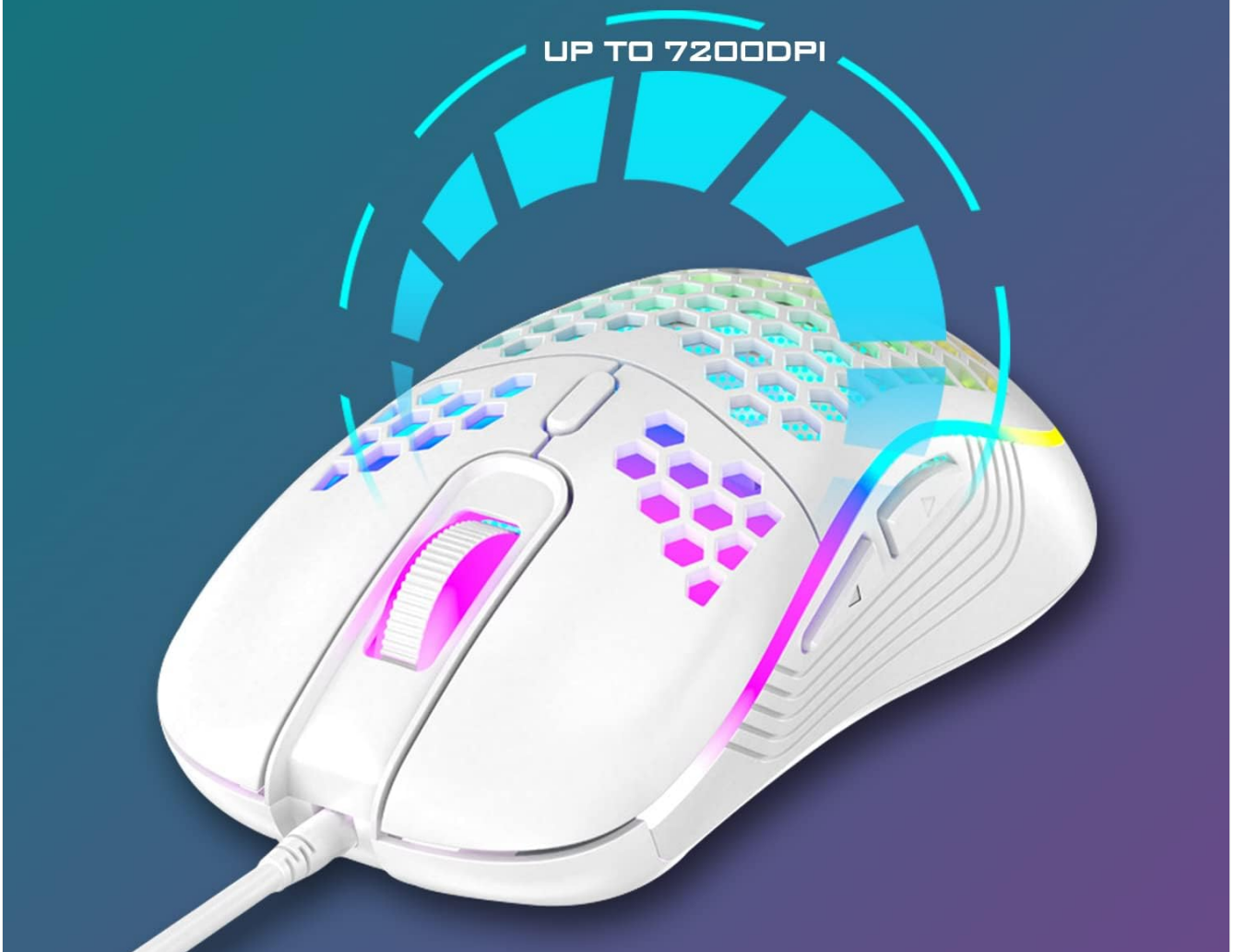
Image: The RedThunder honeycomb optical mouse, highlighting its lightweight design and vibrant RGB lighting.

Video: An official product video showcasing the RGB lighting effects and features of the RedThunder K62 White Keyboard and Mouse Combo.