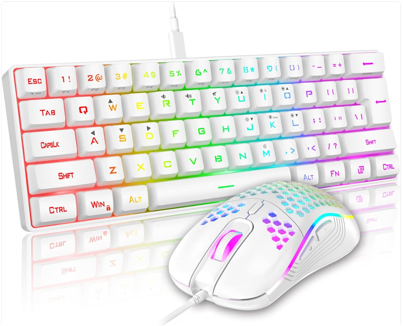
Image: The RedThunder 60% Mini Gaming Keyboard and its accompanying honeycomb optical mouse, both in white with vibrant RGB lighting.