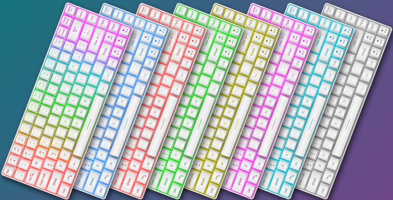
Image: Visual guide to controlling the RGB lighting modes, colors, and brightness on the RedThunder keyboard.