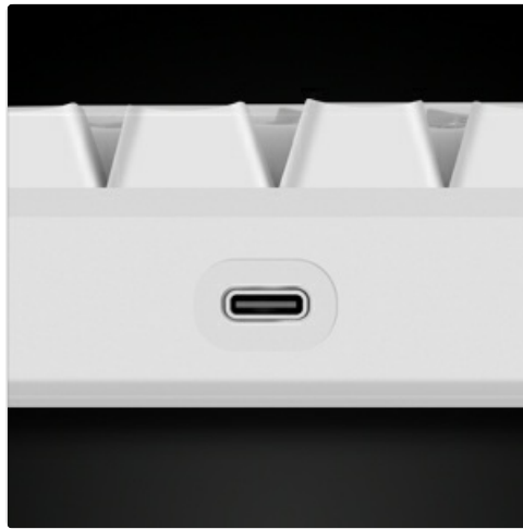
Image: A close-up view of the USB Type-C port on the RedThunder keyboard, highlighting its connection point.