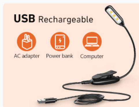
Image: The book light is USB rechargeable, compatible with various power sources like AC adapters, power banks, and computers.