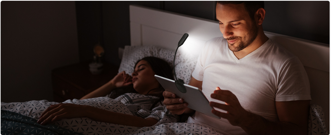
Image: The focused beam of the Monotremp Book Light allows for private reading without disturbing a sleeping partner.