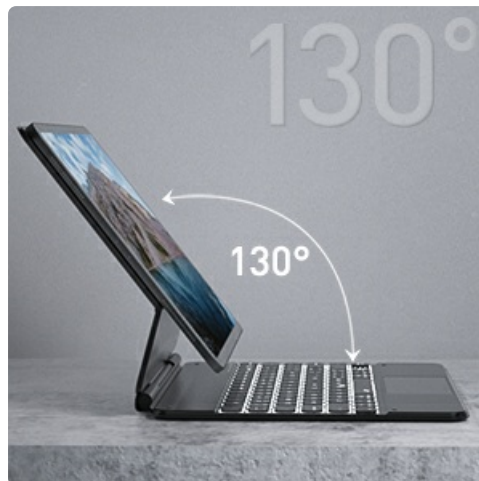
Image: A side view of the keyboard folio demonstrating its 130-degree adjustable viewing angle.