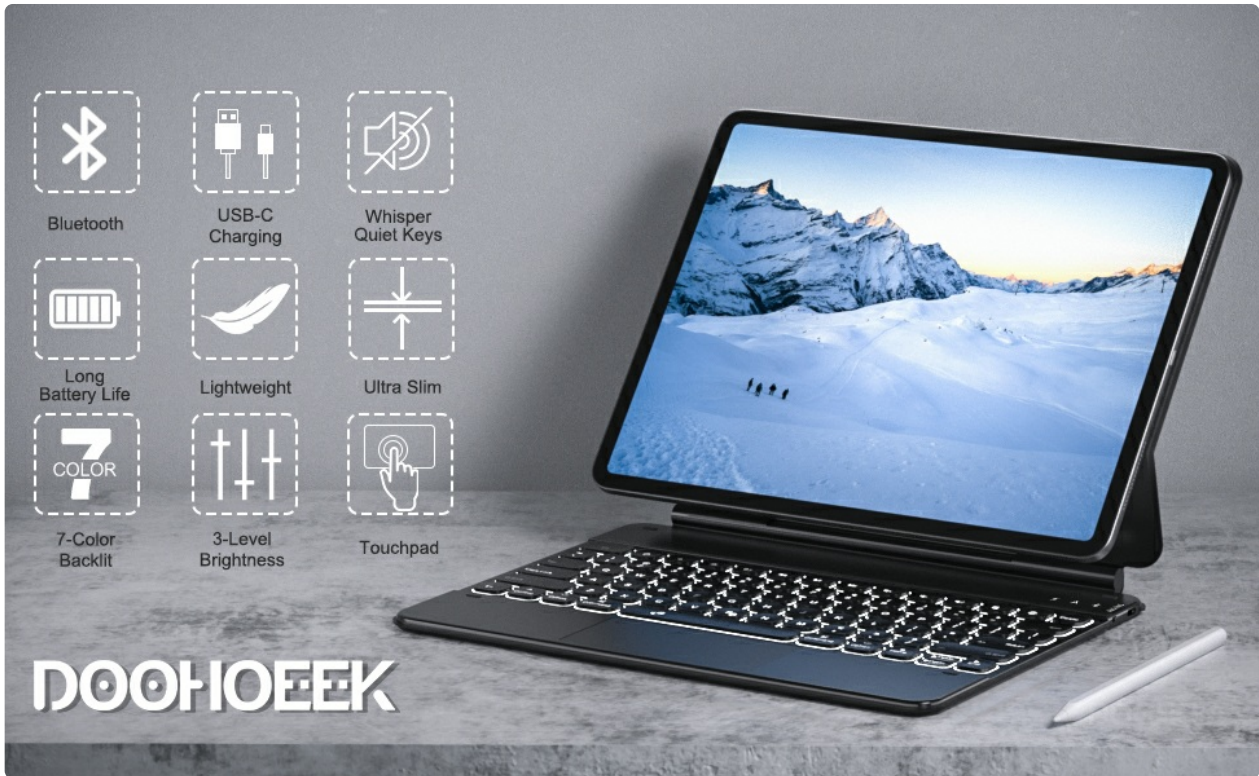
Image: An iPad Pro magnetically levitating above the keyboard base, illustrating the floating design.

The keyboard features a special floating design that allows you to magnetically attach your iPad Pro. This design enables smooth adjustment to the perfect viewing angle for various tasks, from typing to media consumption.