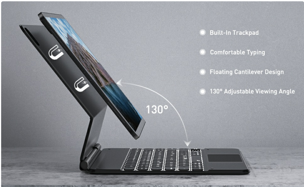
Image: The keyboard folio with an iPad Pro, highlighting its slim profile and protective casing.

The folio design provides durable protection for both the front and back of your iPad, safeguarding it from scratches and spills. When folded, it offers secure protection for travel.