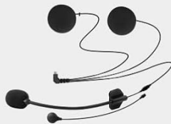
2 in 1 Soft & Hard Mic Earphone