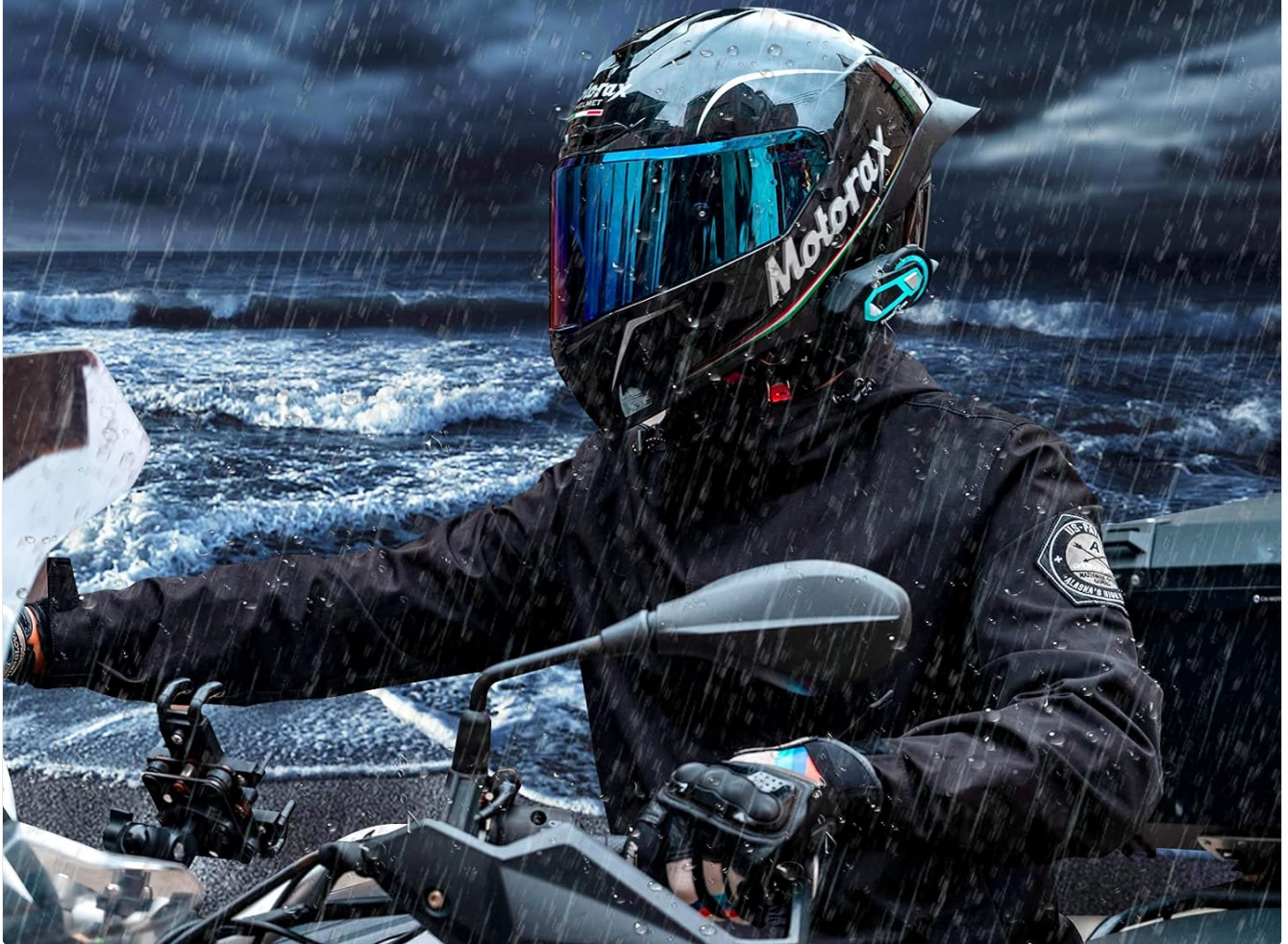
Image: A rider in the rain, showcasing the IP65 rainproof and dustproof capabilities of the TMAX PRO headset.