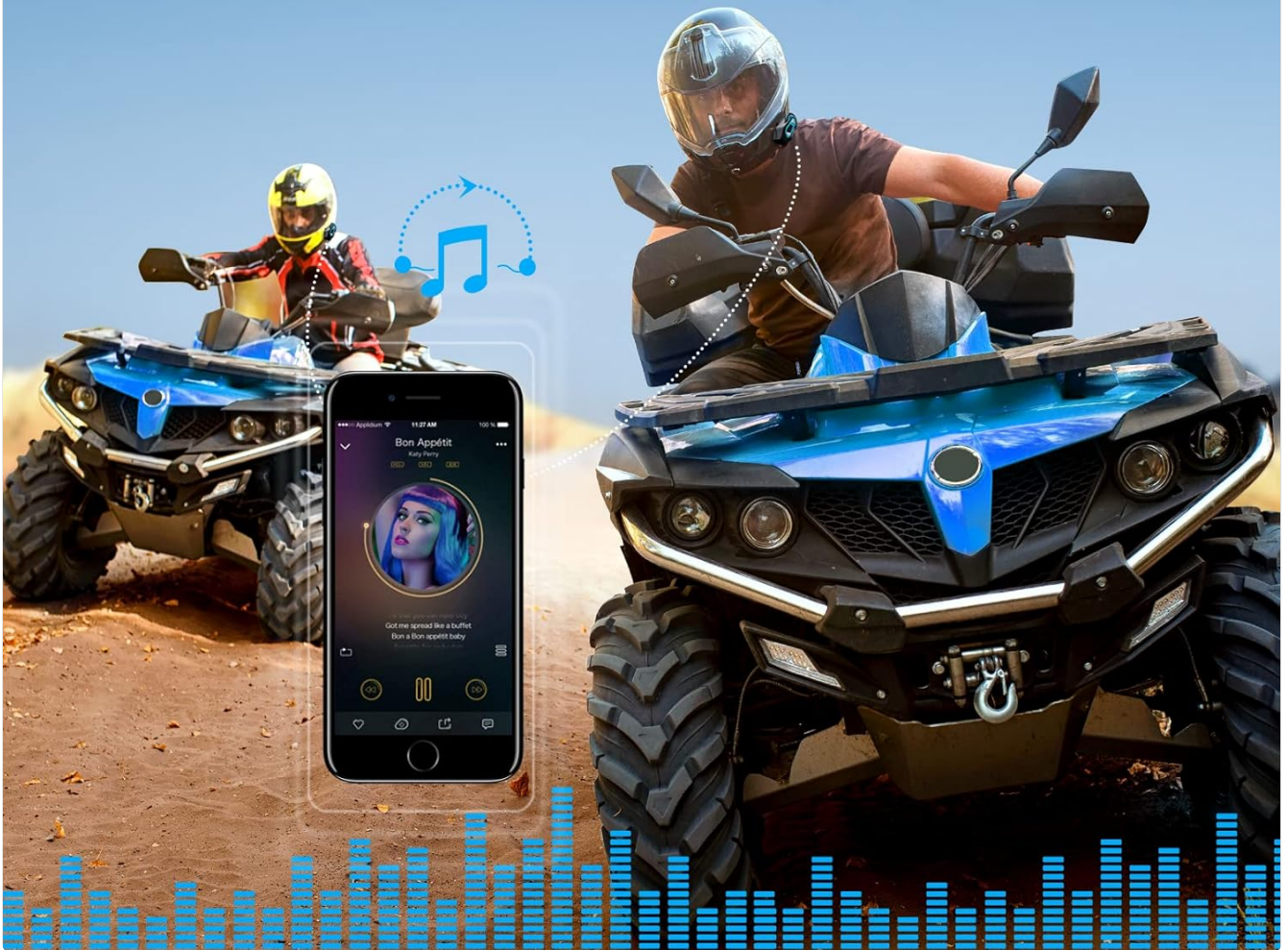
Image: Two riders on ATVs with one phone displaying a music player, indicating remote music sharing functionality.