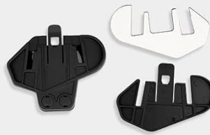
Hook Clip and Velcro Clip