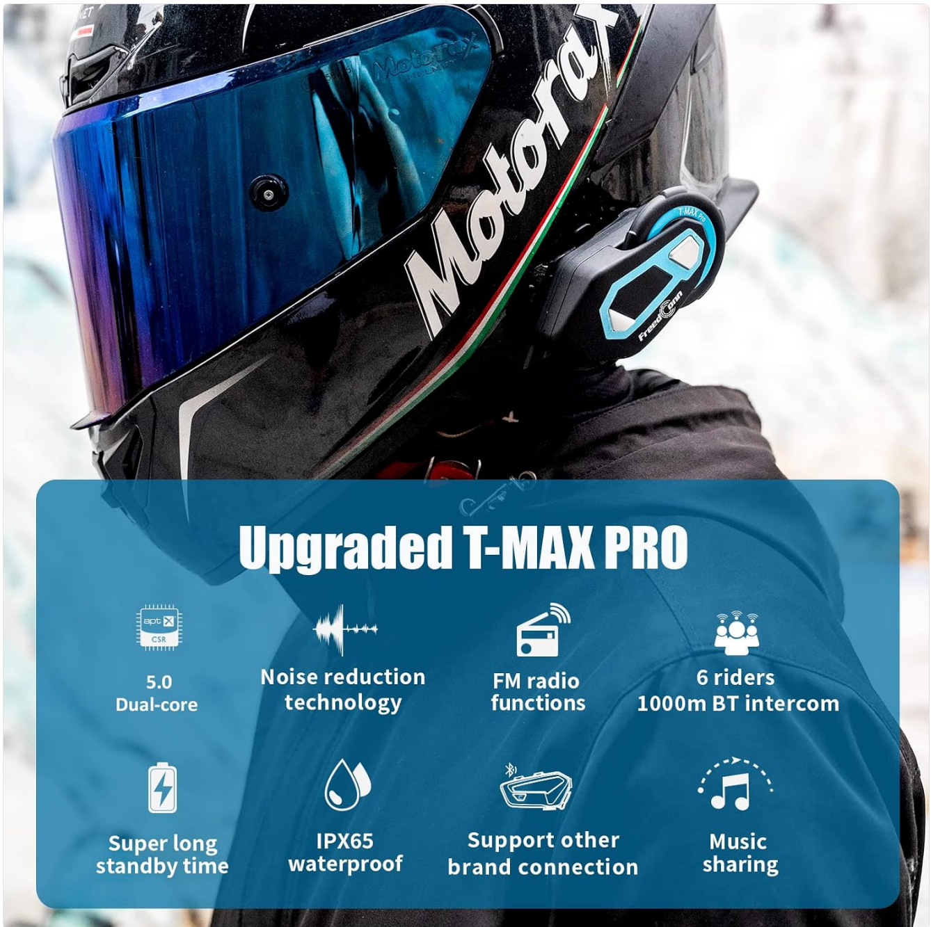
Image: Visual representation of 6 riders communicating via the TMAX PRO intercom system on a road.

For detailed pairing and group intercom setup, please refer to the specific instructions in the included user manual.