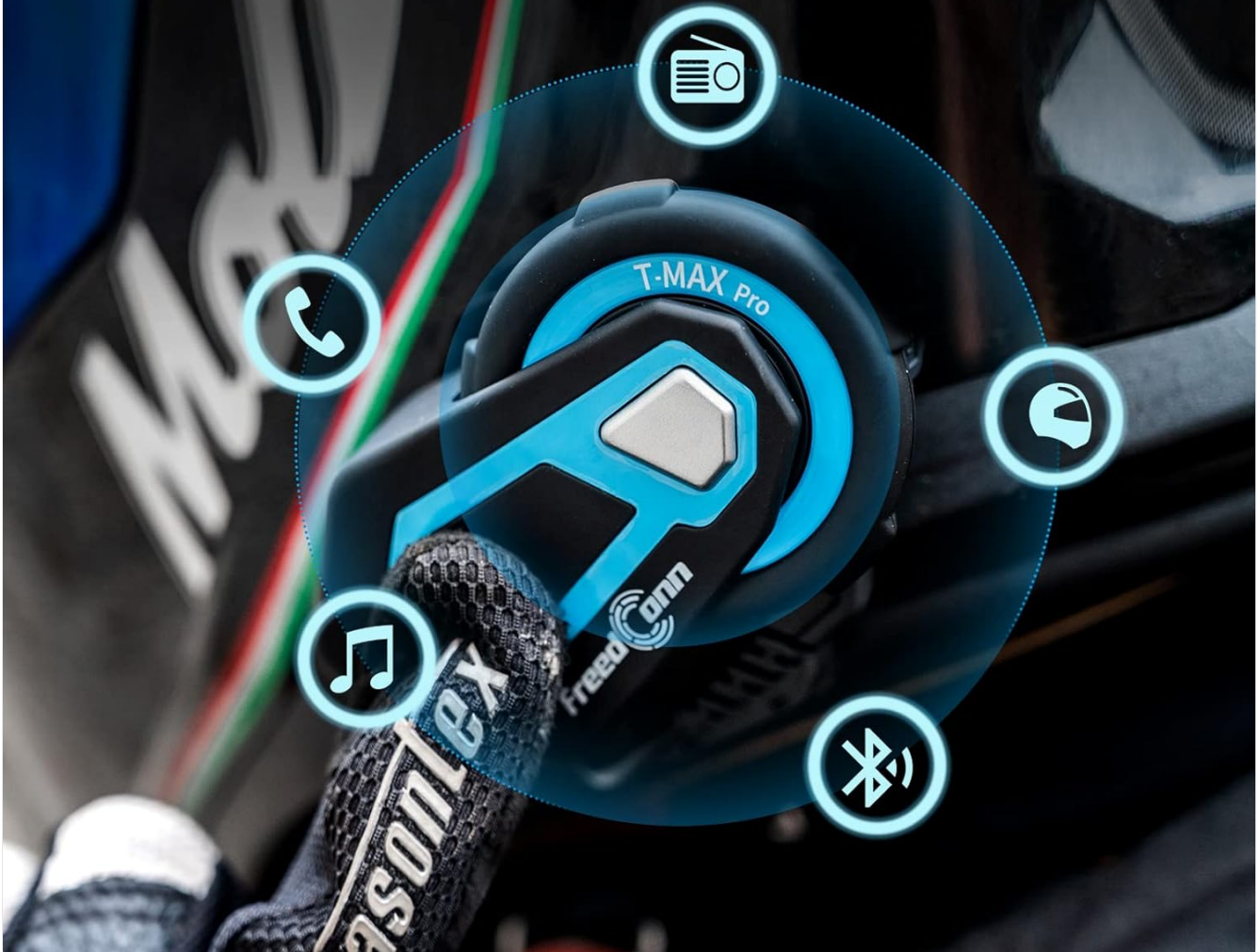
Image: Close-up of the TMAX PRO unit on a helmet, highlighting the multi-function button for one-key operation of calls, music, and other features.

One-key operation even when wearing gloves, flexible buttons, convenient and practical.