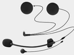
2 in 1 Soft & Hard Mic Earphone