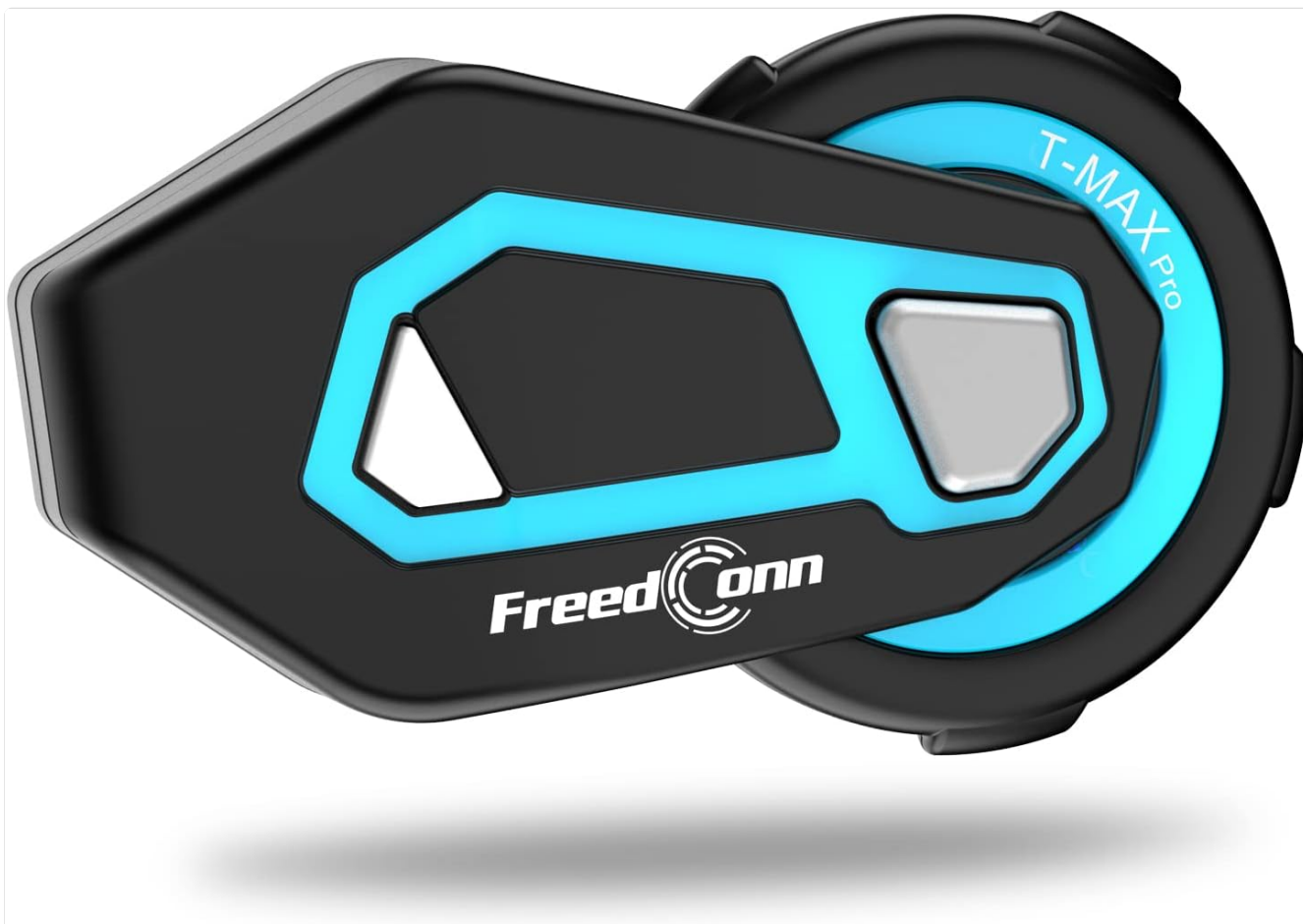
Image: The FreedConn TMAX PRO headset attached to the side of a motorcycle helmet.

secure attachment to the helmet edge or the adhesive velcro clip for flat surfaces. Ensure the unit is firmly attached and does not obstruct your vision or helmet functionality.