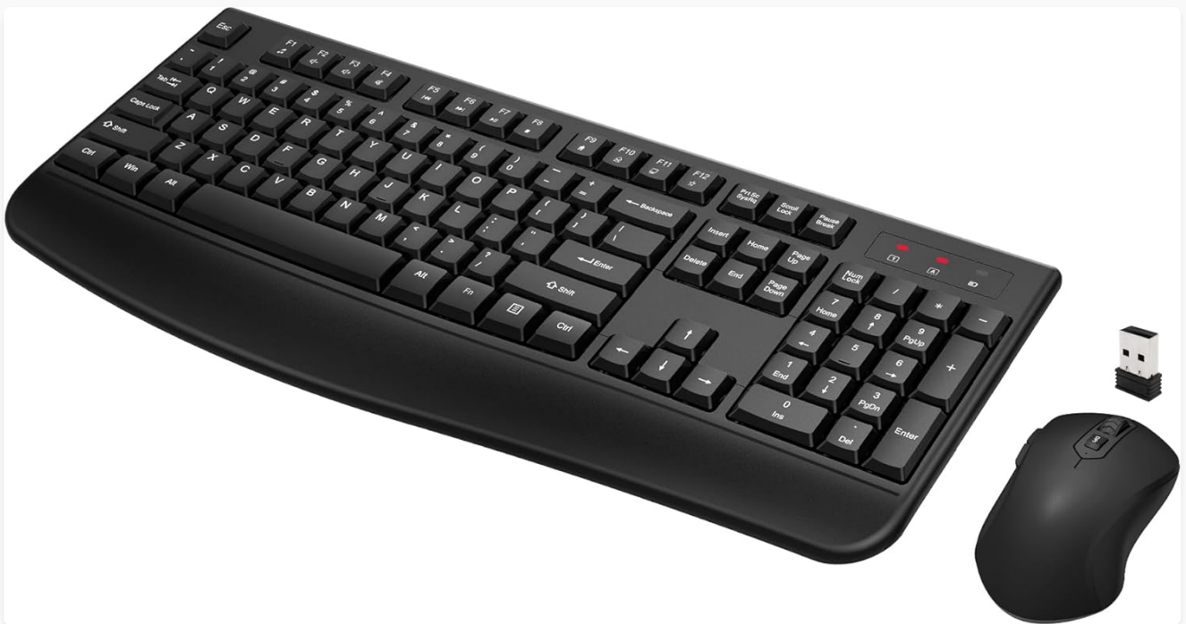
Image: The QUASIO Wireless Keyboard and Mouse Combo, featuring a full-sized black keyboard with an integrated palm rest and a matching black optical mouse, alongside its compact USB receiver.

The QUASIO Wireless Keyboard and Mouse Combo offers a comfortable and efficient solution for your computing needs. Designed for seamless connectivity and extended use, this combo features a full-sized keyboard with an integrated palm rest and an optical mouse with adjustable sensitivity. It's a plug-and-play solution, requiring no additional software installation.