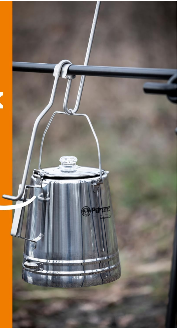
The Petromax percolator suspended over an open campfire, ready for brewing.