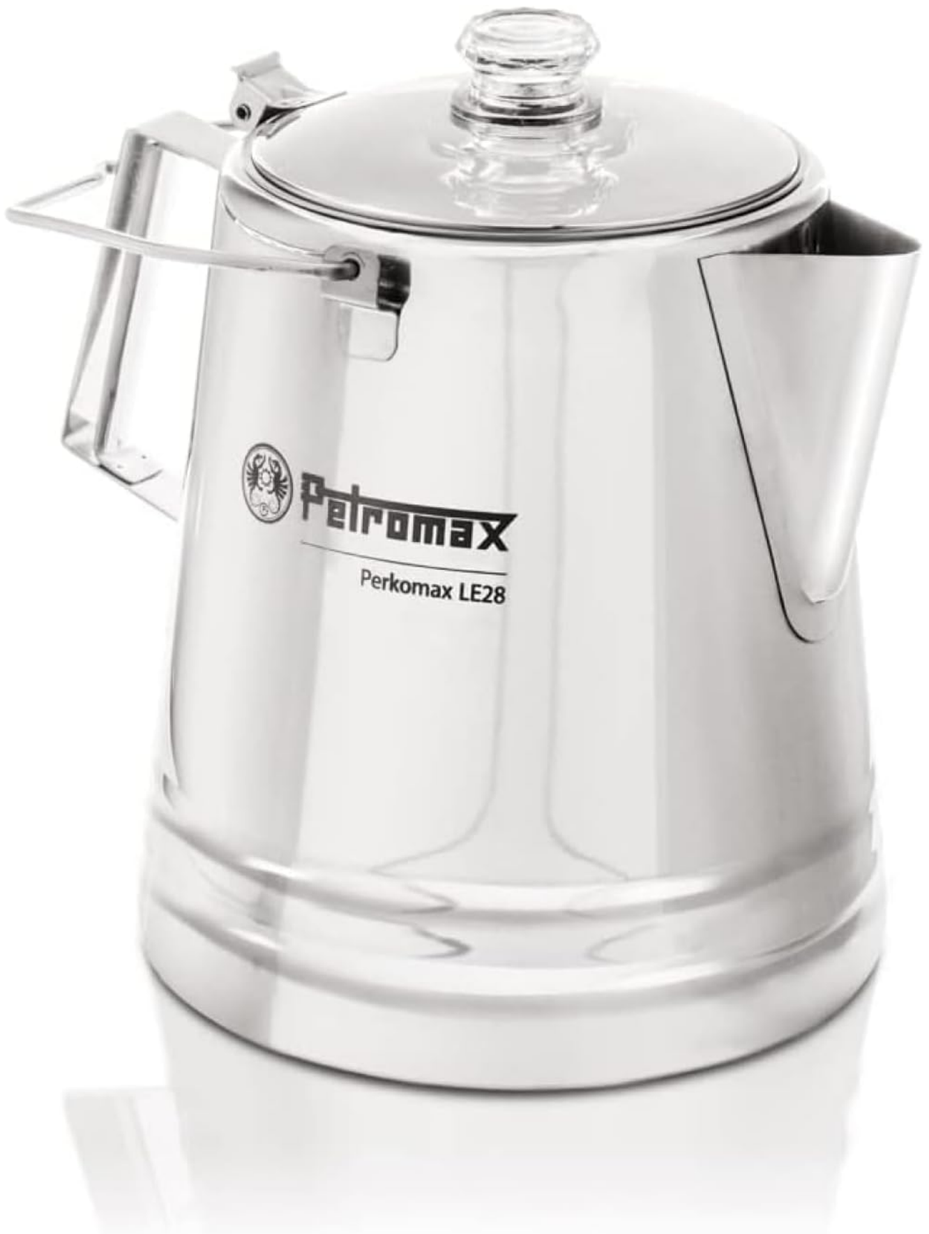
A shiny stainless steel percolator with a glass knob on top, featuring the Petromax logo.