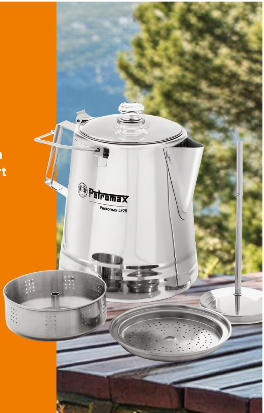
Disassembled view of the percolator showing the main pot, the central tube, and the coffee basket with its lid.