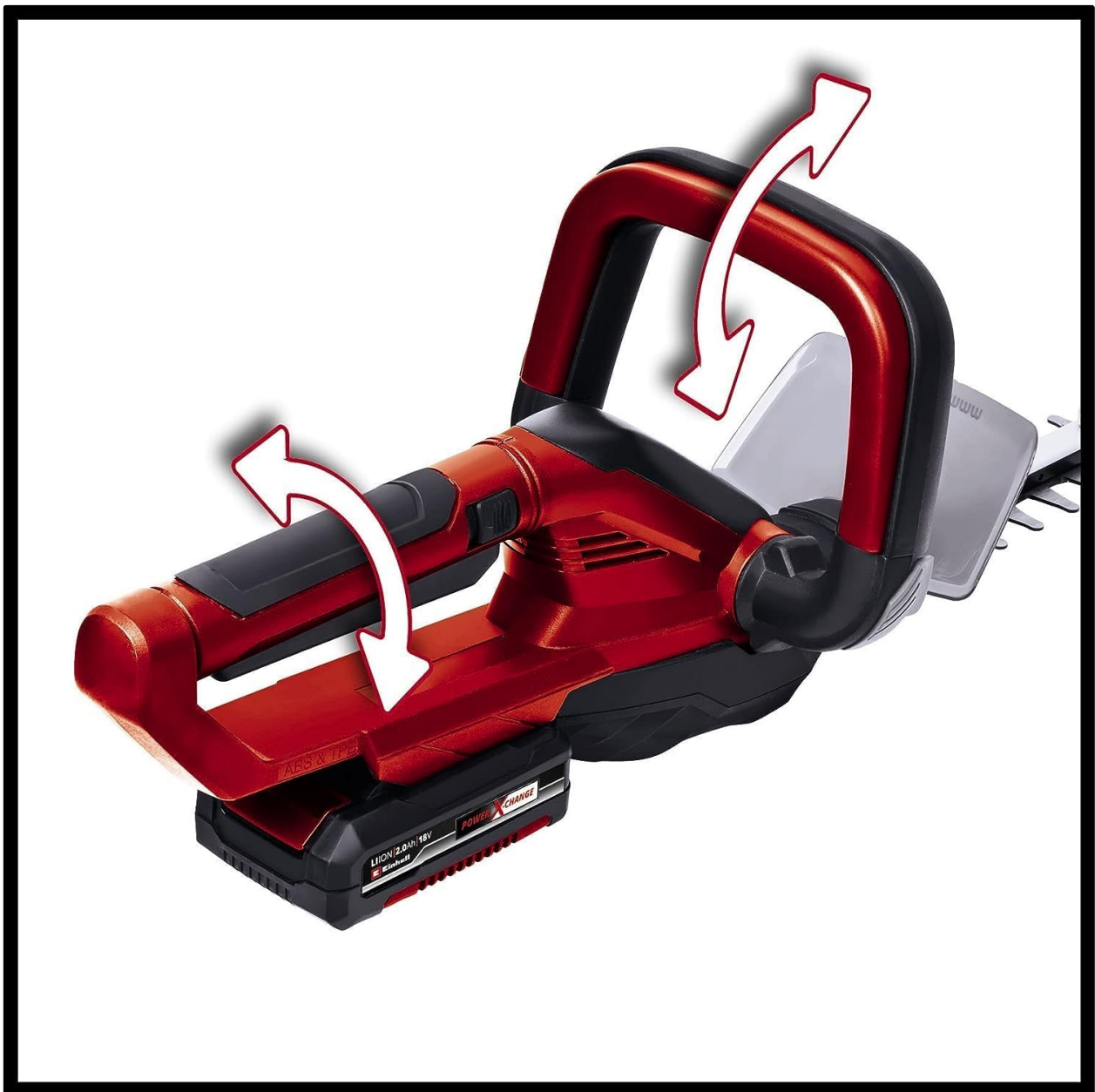
Image 5.2: The pivot handle allows for ergonomic adjustments during use.