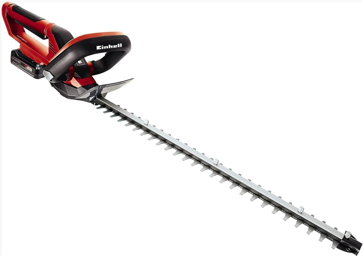
Image 1.1: The Einhell GC-CH 1855/1 Li Kit Cordless Hedge Trimmer.