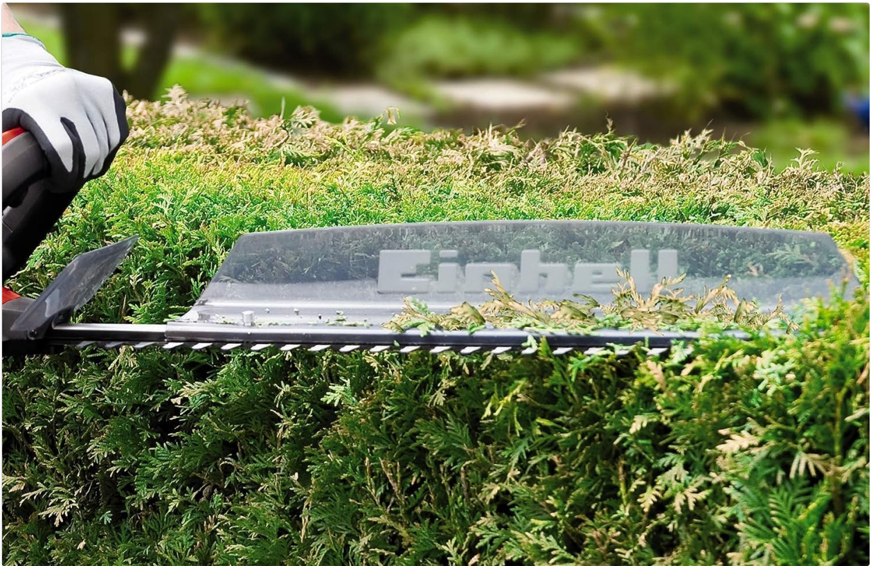
Image 5.3: The waste collector helps manage cuttings during trimming.