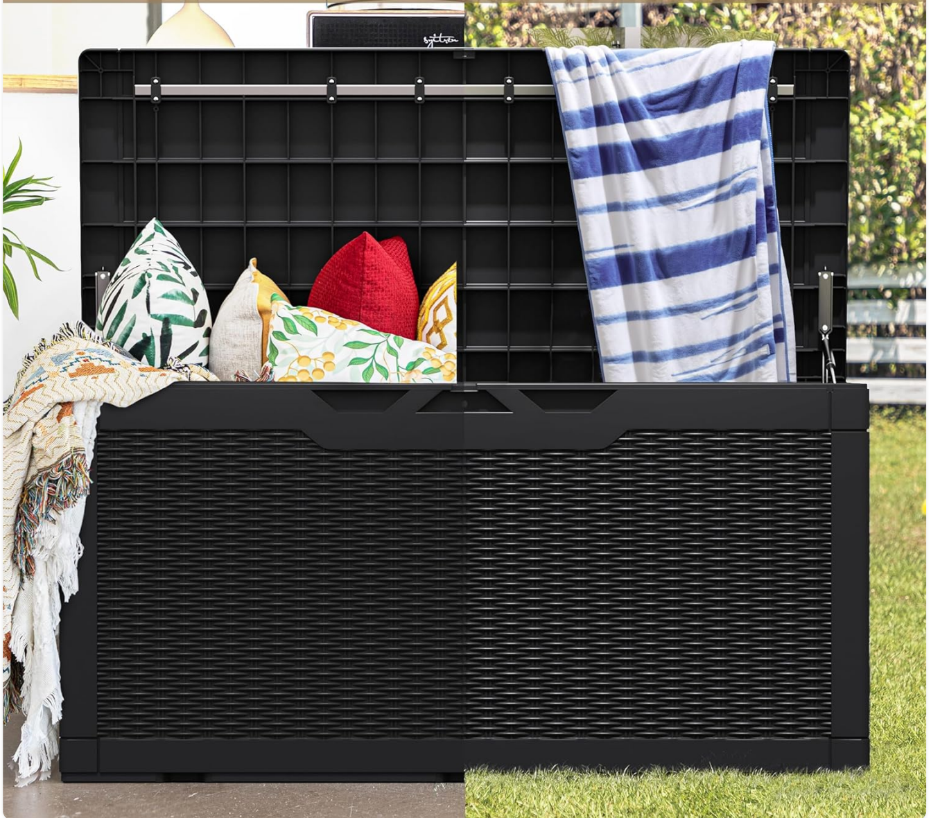
Image: Illustrates the deck box's suitability for both indoor and outdoor environments.