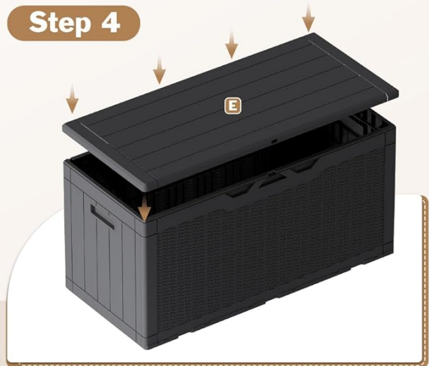
Image: The lockable lid feature, highlighting the secure design for outdoor placement.