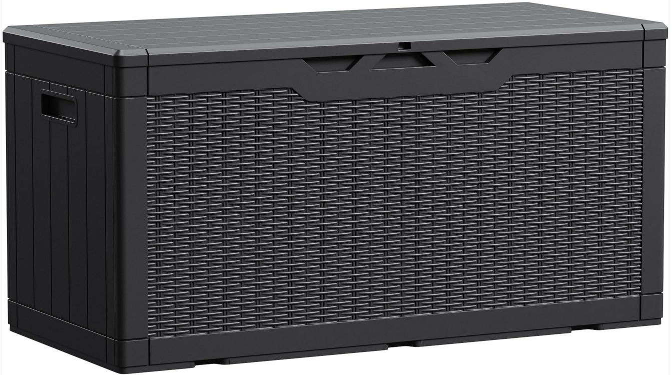
Image: The Devoko 100 Gallon Waterproof Large Resin Deck Box, showcasing its sleek design and ample size.