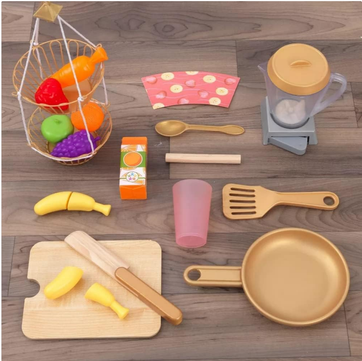
Image Description: A flat lay photograph showcasing the 22 play accessories included with the KidKraft Smoothie Fun Wooden Play Kitchen. Items visible include a toy blender, a frying pan, a spatula, a spoon, a cutting board, a knife, various toy fruits (banana, orange, apple, grapes, strawberry), a juice carton, a cup, and two hanging baskets with more fruit. These accessories are essential for interactive play.