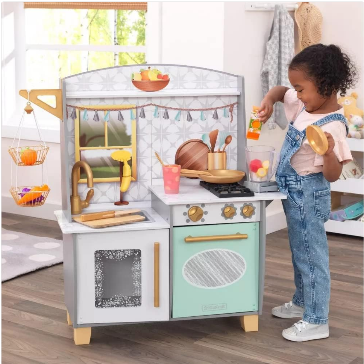
Image Description: A young child, seen from the side, actively engaged in playing with the KidKraft Smoothie Fun Wooden Play Kitchen. The child is holding a play juice carton and appears to be adding play fruit into the blender, demonstrating the interactive nature of the toy.