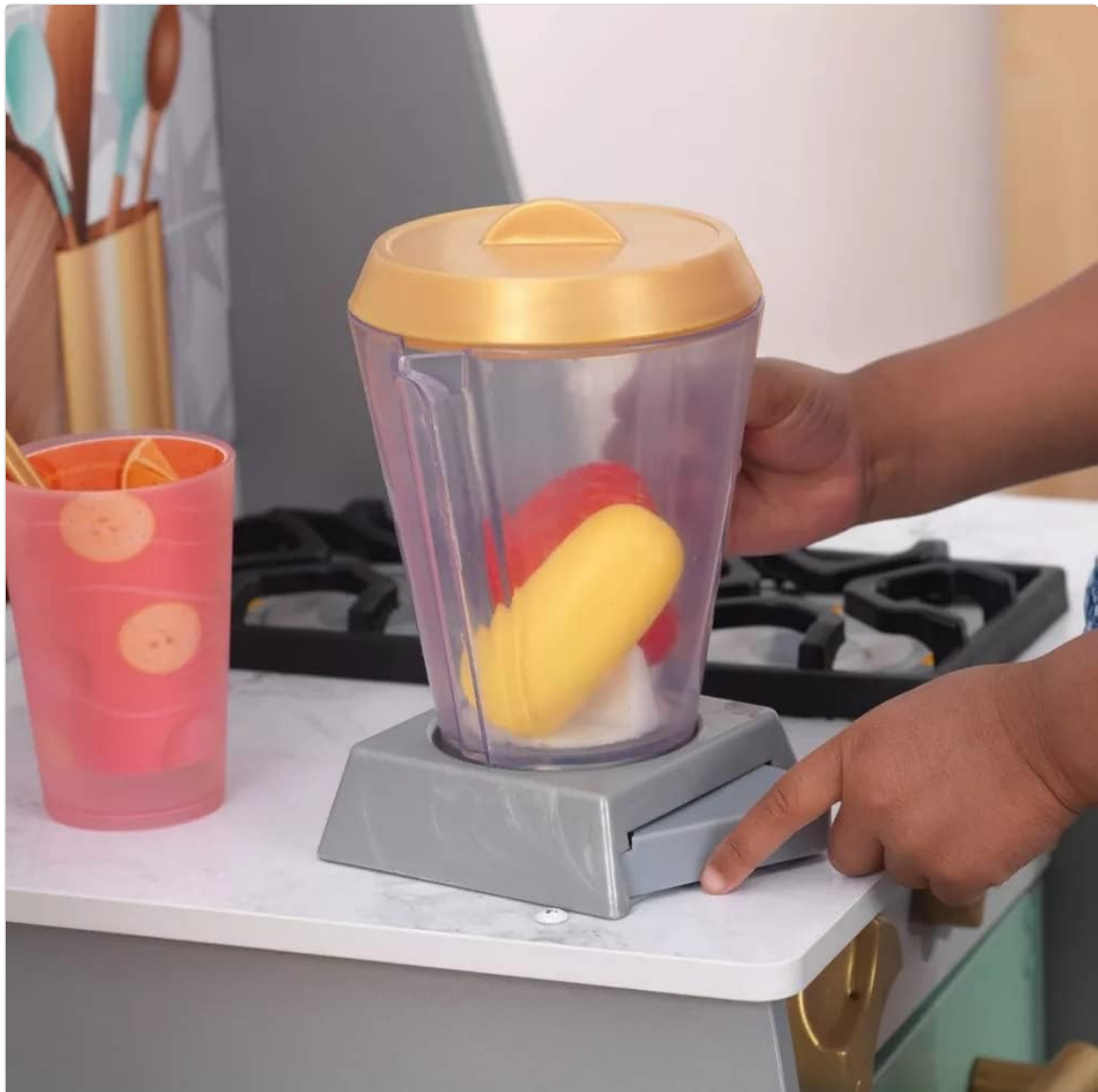
Image Description: A close-up shot focusing on the toy blender of the KidKraft Smoothie Fun Play Kitchen. A child's hand is shown pressing the button at the base of the blender, which contains colorful play fruit, demonstrating the interactive blending feature.