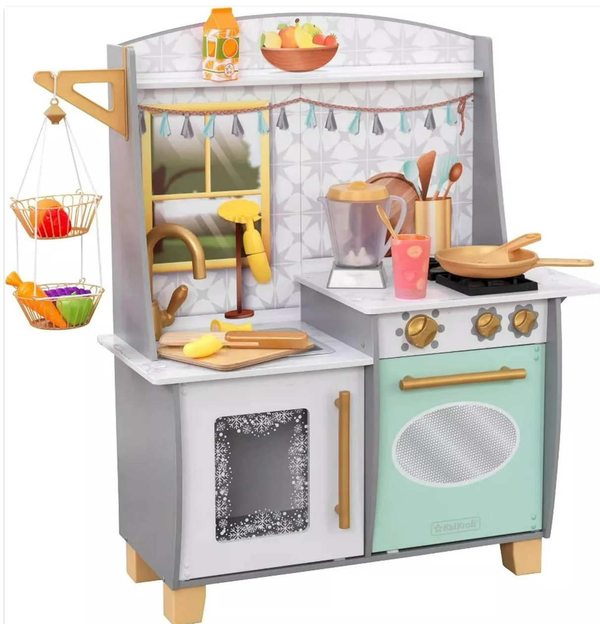
Image Description: A front view of the fully assembled KidKraft Smoothie Fun Wooden Play Kitchen. It features a sink with a golden faucet, a cutting board, a stove with clickable knobs, an oven with a clear door, and a blender on the countertop. Hanging baskets with play fruit are visible on the left side. The kitchen has a light grey and mint green color scheme with golden accents.