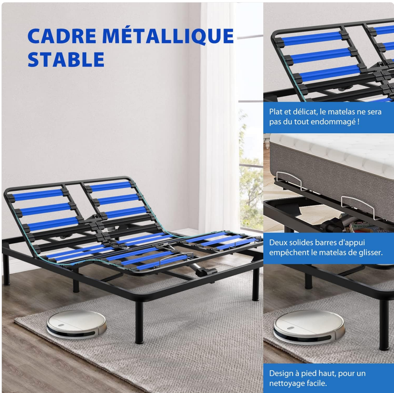
Figure 3.1: Stable metal frame with high feet for easy cleaning and mattress retention bars.