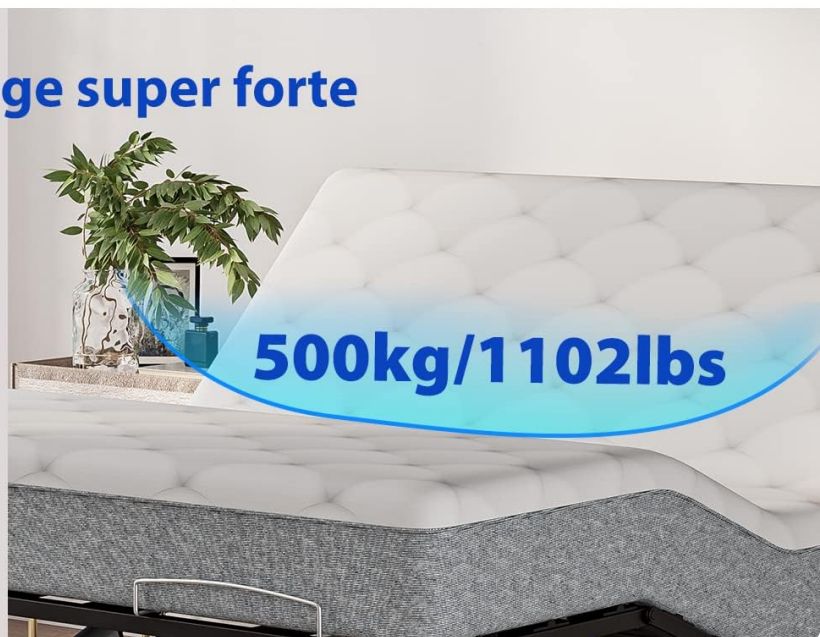
Figure 5.2: The bed's robust design supports up to 500kg, powered by quiet and strong OKIN German motors.

Obtention de nombreuses certifications mondiales connexes telles que la certification FCC aux États-Unis et CE dans l'Union européenne.