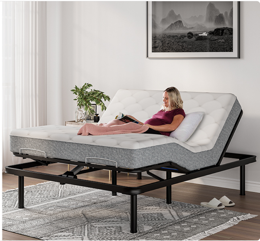
Figure 4.3: The bed's versatility allows for comfortable positions for reading, watching TV, or working on a laptop.

Les lits réglables offrent un meilleur confort en vous permettant de modifier l'élévation de votre tête et de vos pieds, ce qui réduit la pression sur les articulations et favorise la circulation sanguine. Si vous lisez ou regardez la télévision au lit, le fait de surélever le haut du corps vous apportera un meilleur soutien.