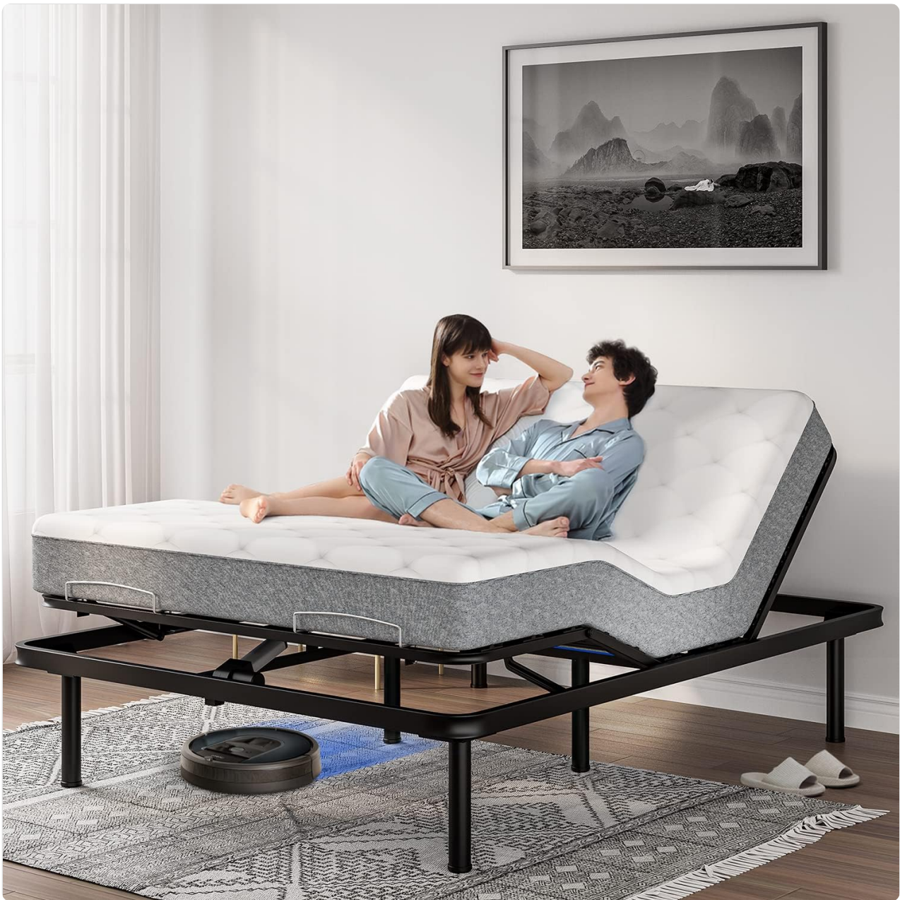
Figure 2.1: Furgle Electric Adjustable Bed Base in use, showing adjustable head and foot sections.