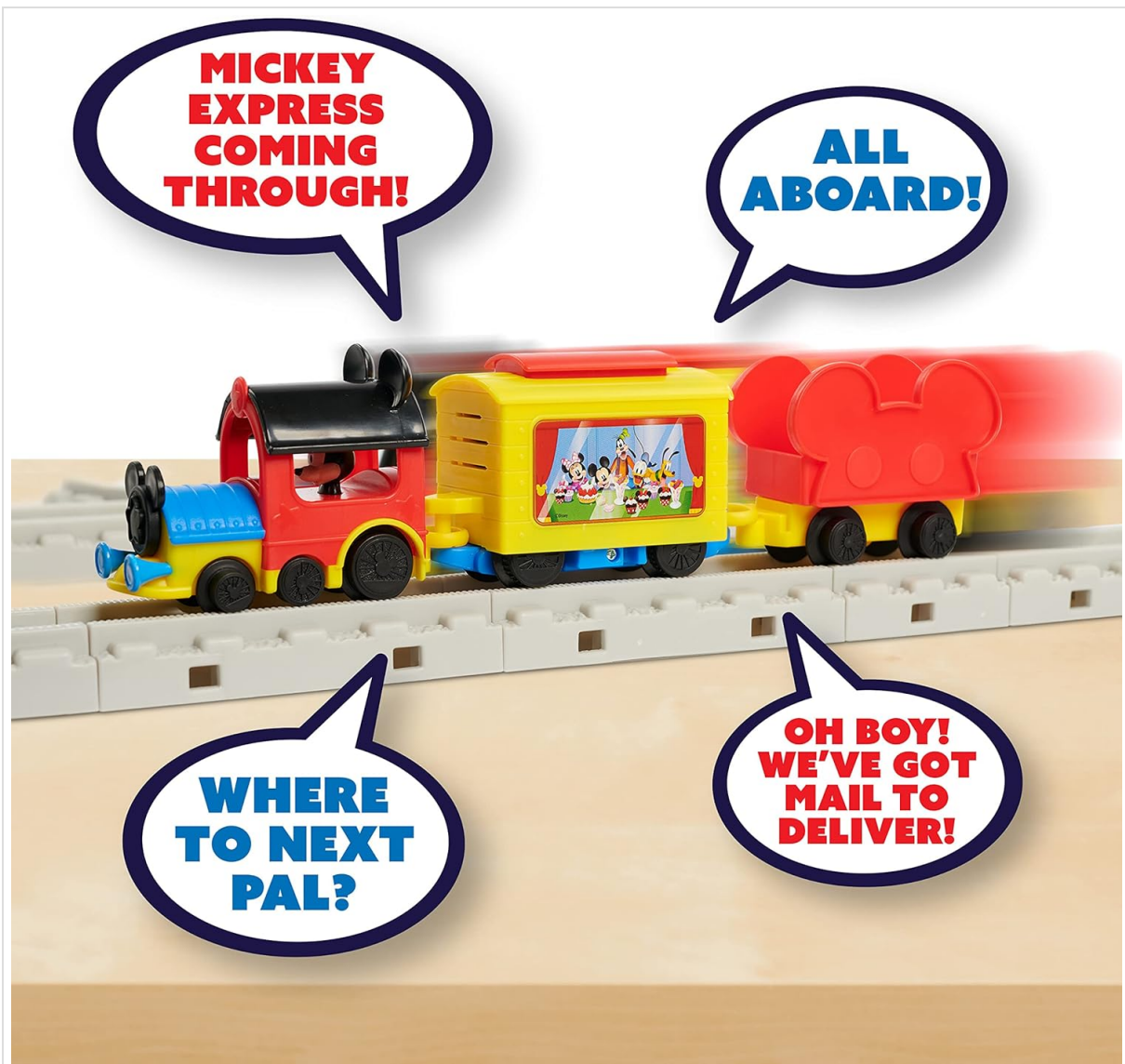
Figure 5: The train activates sounds and phrases during play.