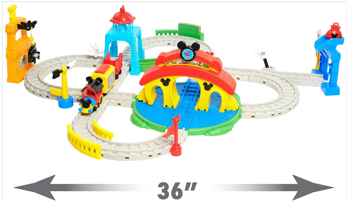
Figure 1: Example of a track layout for the Mickey Train Track Set.

The set includes 22 easy-to-connect track pieces. You can build the track in three different ways to create varied play experiences. Ensure all track pieces are firmly connected to prevent the train from derailing during operation.