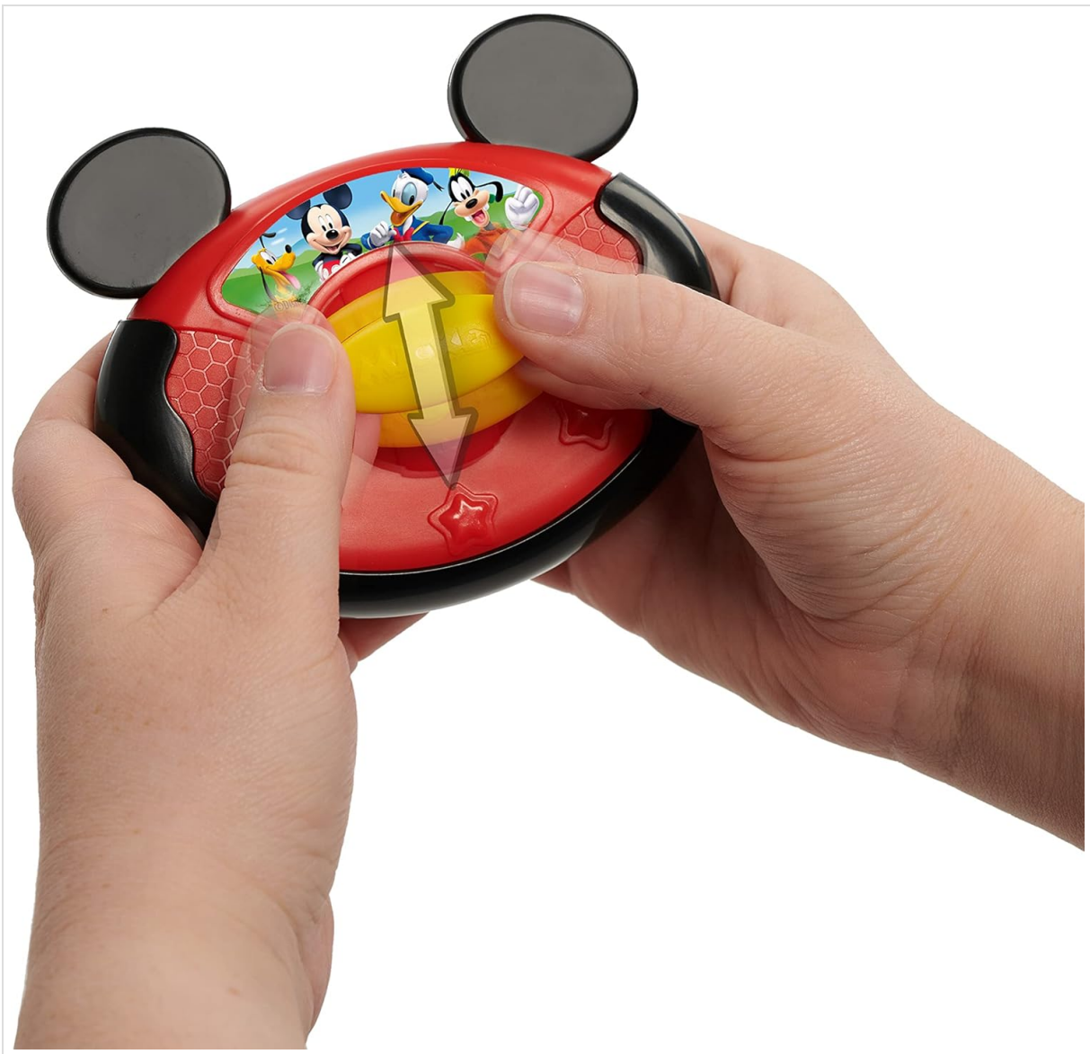
Figure 4: The remote controller for the Mickey Train Track Set.