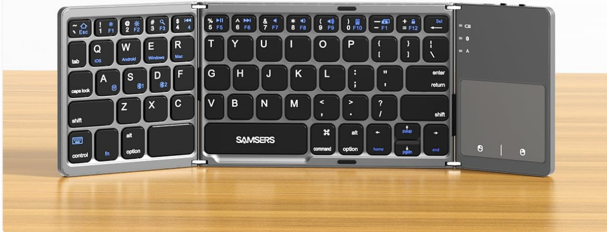
Image: A graphic illustrating the dual-mode connectivity, showing Bluetooth pairing via Fn+S and Fn+D, and 2.4G USB connection via Fn+A.