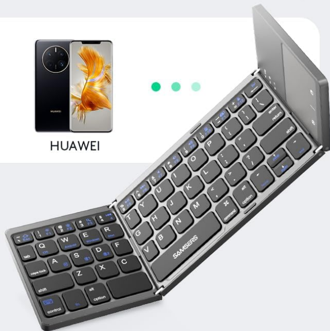
Image: A visual representation of the keyboard's extensive compatibility with various operating systems and devices, including Apple iPad, Samsung, Amazon, Huawei tablets, MacBook, Dell, HP, Lenovo laptops, and Samsung, iPhone, Huawei phones.

The Samsers keyboard is compatible with a wide range of operating systems: