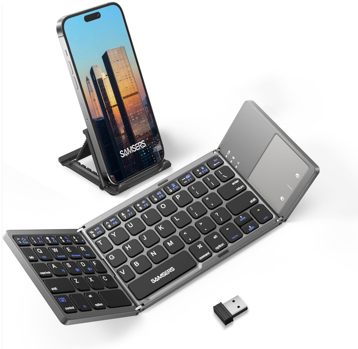
Image: The Samsers foldable keyboard is shown fully unfolded, with a smartphone placed vertically on the included stand, demonstrating a typical setup.

touchpad for mouse functionality and supports connections via both 2.4G wireless and Bluetooth, allowing seamless switching between up to three devices.