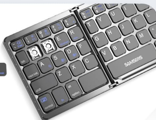
Image: A visual demonstrating the keyboard's auto-sleep feature after 10 minutes of inactivity to save power, and highlighting the scissor switch key mechanism.

To conserve battery life, the keyboard will automatically enter sleep mode after 10 minutes of inactivity. To wake it up, simply press any key. It will automatically reconnect to the last connected device.