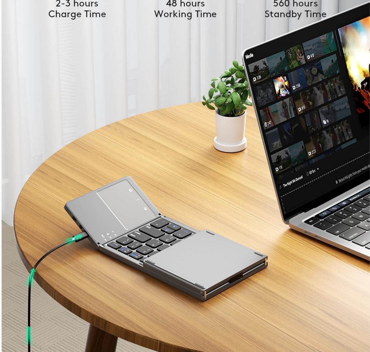
Image: The foldable keyboard is shown connected to a laptop via a USB-C cable, illustrating the charging process. Icons indicate 2-3 hours charge time, 48 hours working time, and 560 hours standby time.

Before first use, fully charge the keyboard. Connect the provided USB-C cable to the keyboard's charging port and the other end to a USB power source (e.g., computer, wall adapter). The charging indicator light will illuminate during charging and turn off when fully charged. A full charge typically takes 2-3 hours, providing approximately 48 hours of working time or 560 hours of standby time.