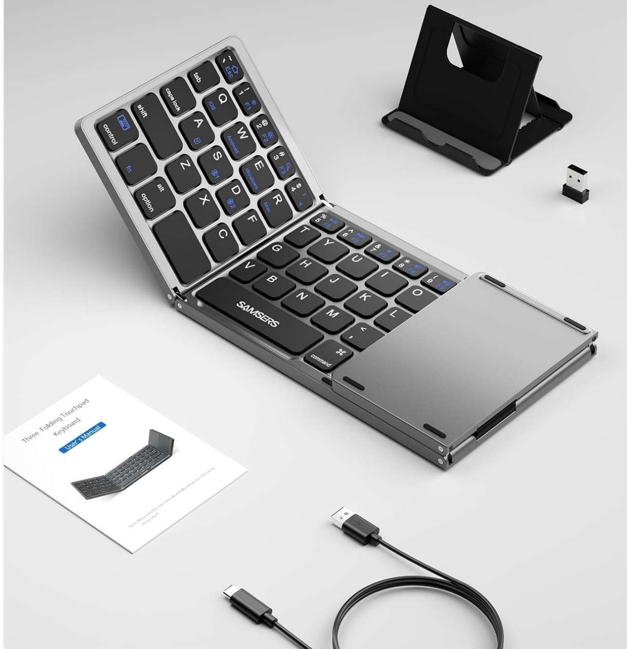
Image: The Samsers Foldable Bluetooth Keyboard, a USB charging cable, a phone stand, and the user manual are included in the package.

Please check the package contents to ensure all items are present: