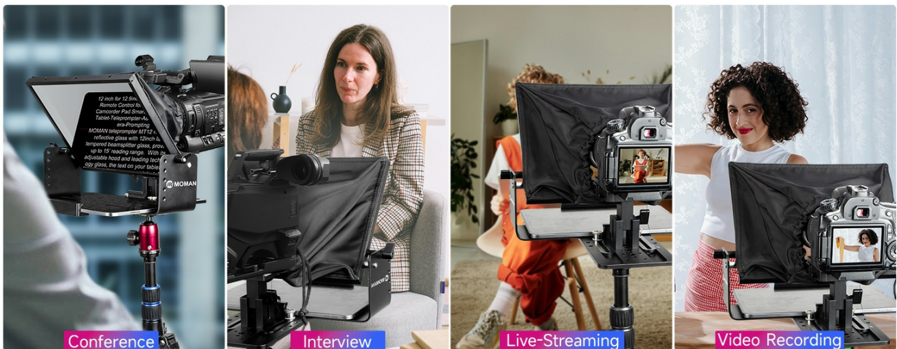
Image: Examples of the teleprompter in use for conferences, interviews, live-streaming, and video recording.

The Moman MT12 Teleprompter is versatile and suitable for various applications, including: