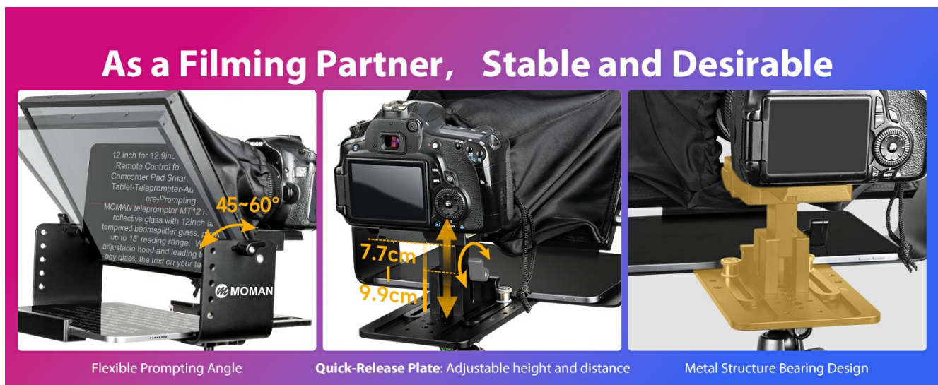
Image: Diagram highlighting key features such as flexible prompting angle, quick-release plate with adjustable height and distance, and metal structure bearing design.

The Moman MT12 Teleprompter is designed for professional video production, offering clear script reflection and broad compatibility.