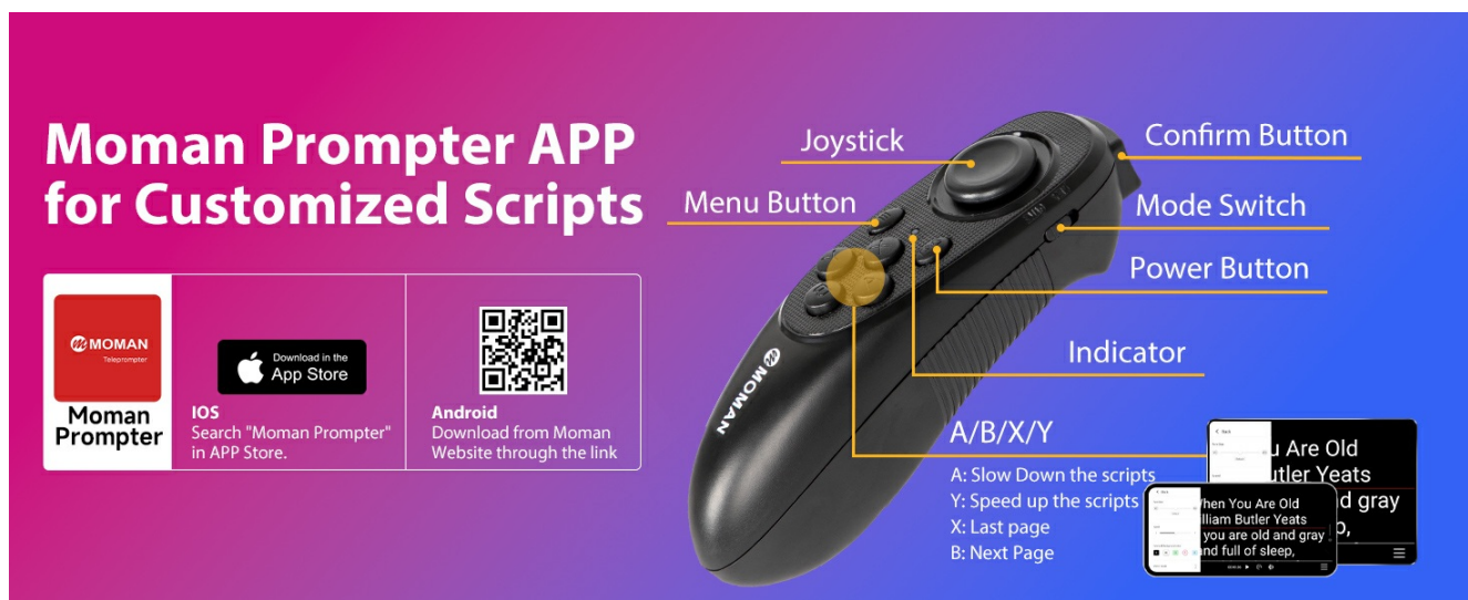
Image: Overview of the Moman Prompter App interface and the functions of the remote control.

The Moman Prompter App allows you to control your script and teleprompter settings.