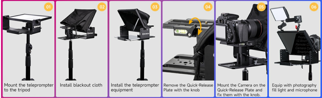
Image: Visual guide for the six installation steps of the teleprompter.