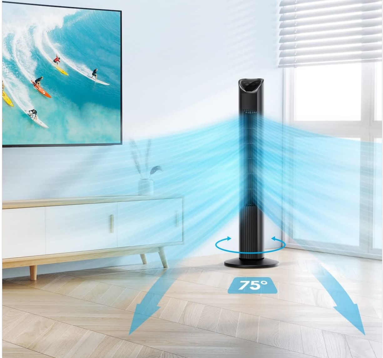
Image: The Govee Smart Tower Fan H7101 operating in Auto Mode, illustrating how fan speed adjusts based on temperature readings from the Govee Thermo-Hygrometer H5177.