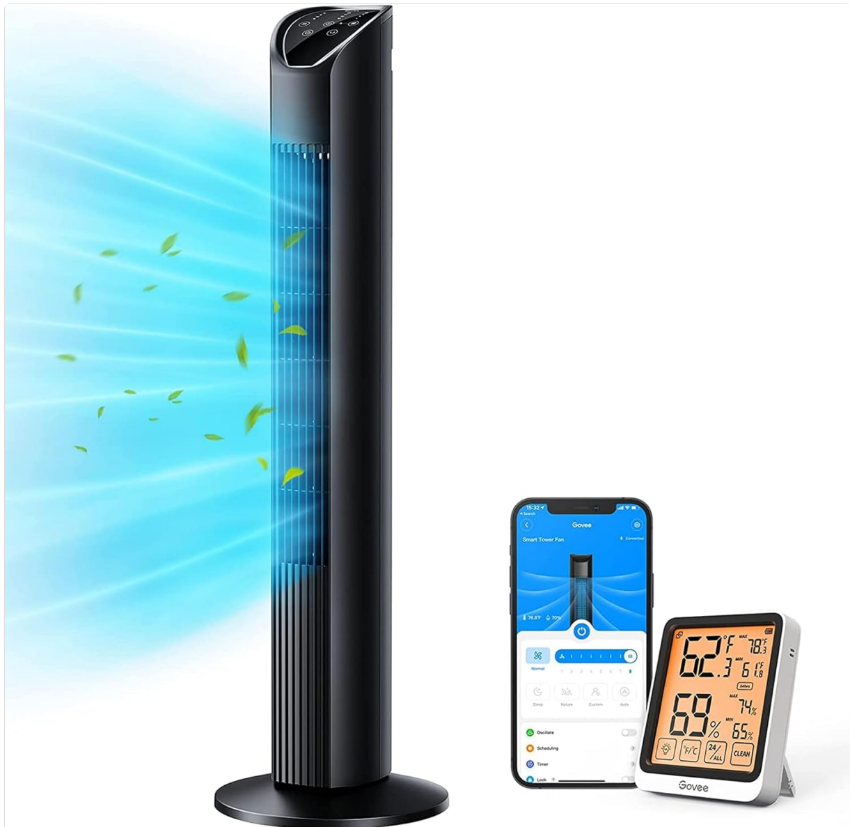
Image: The Govee Smart Tower Fan H7101, showcasing its slim design, the included Govee Thermo-Hygrometer H5177, and a smartphone displaying the Govee Home App interface.

The Govee Smart Tower Fan H7101 is a sleek, oscillating fan designed for optimal air circulation. It features a user-friendly control panel on top and integrates seamlessly with the Govee Home App and voice assistants.