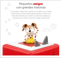
Image: Detailed view of the Tonie figurine, highlighting its hand-painted design.