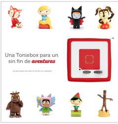
Image: An assortment of Tonie characters alongside a Toniebox, showcasing the wide range of available audio figures.