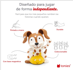
Image: The Tonie figurine interacting with the Toniebox, illustrating how the characters bring stories to life.