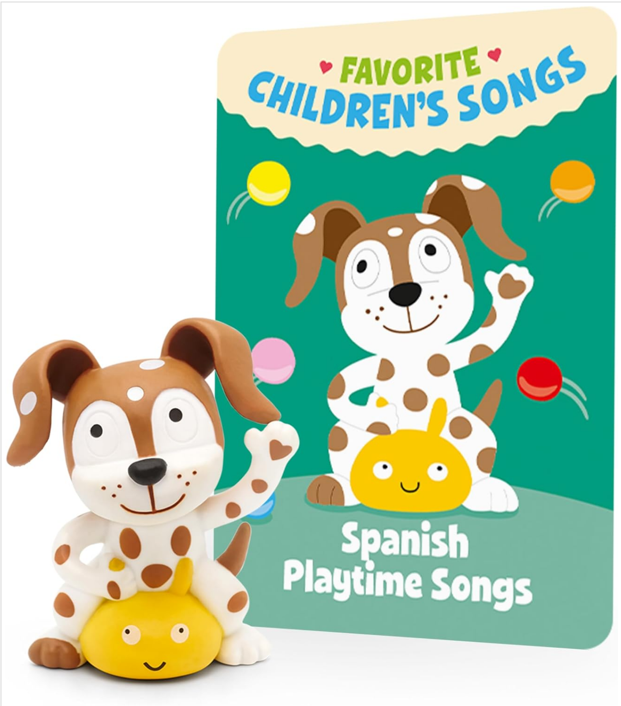
Image: The Tonies Spanish Playtime Songs figurine, a charming spotted dog character, is designed to interact seamlessly with the Toniebox for an intuitive audio experience.