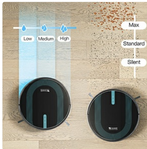
Image: Adjustable suction power and water levels for different cleaning needs.

The Proscenic 850T offers multiple cleaning modes: