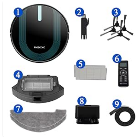
Image: All components included with the Proscenic 850T Robot Vacuum Cleaner.

Verify that all components are present and in good condition upon unpacking.