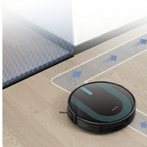
Image: The robot vacuum recognizing a virtual boundary strip to avoid restricted areas.

Use the included boundary strip to set up forbidden areas, preventing the robot from entering specific rooms or zones.