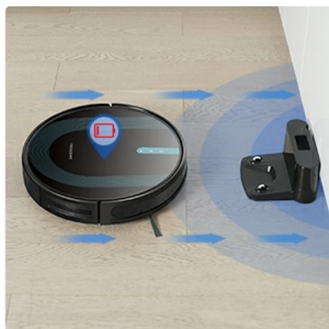
Image: The robot vacuum returning to its charging station.