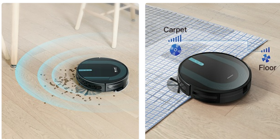
Images: The robot vacuum using sensors to detect obstacles and adapting to different floor types.

The robot vacuum utilizes advanced sensors for anti-collision and anti-fall protection, ensuring it navigates your home safely and avoids drops from stairs or collisions with furniture. It follows a specific logic for