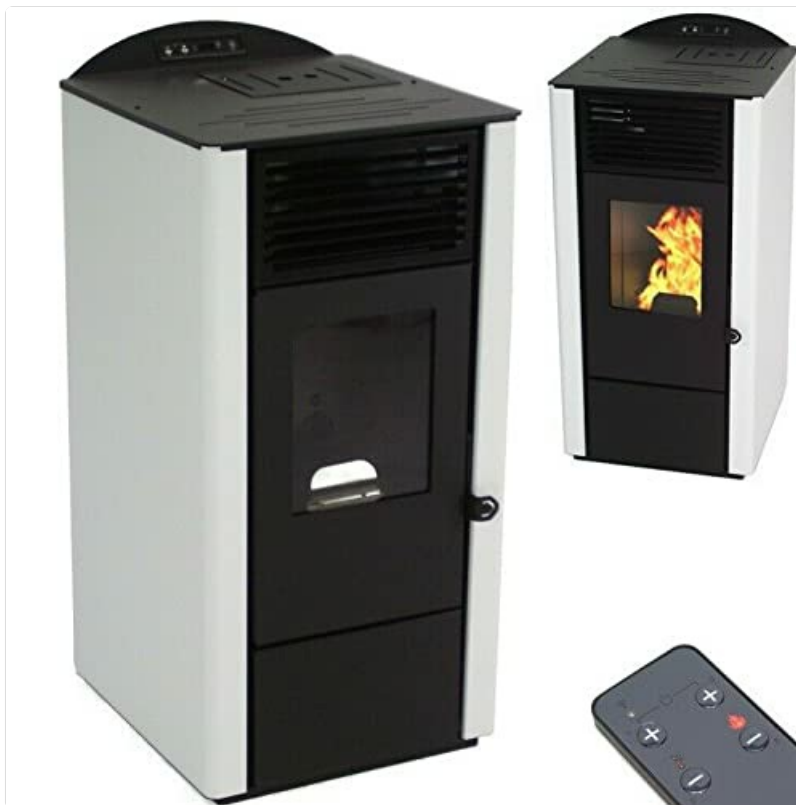
Figure 1.1: The Apex AWZ 56302 Pellet Stove in black and white, with its glass door open, revealing the combustion chamber.

Thank you for choosing the Apex AWZ 56302 9.5 kW Pellet Stove. This appliance is designed to provide efficient and reliable heating for your home using wood pellets. Featuring an A+ energy rating and a stylish glass door, this pellet stove combines performance with modern aesthetics. This manual provides essential information for the safe installation, operation, and maintenance of your new pellet stove.