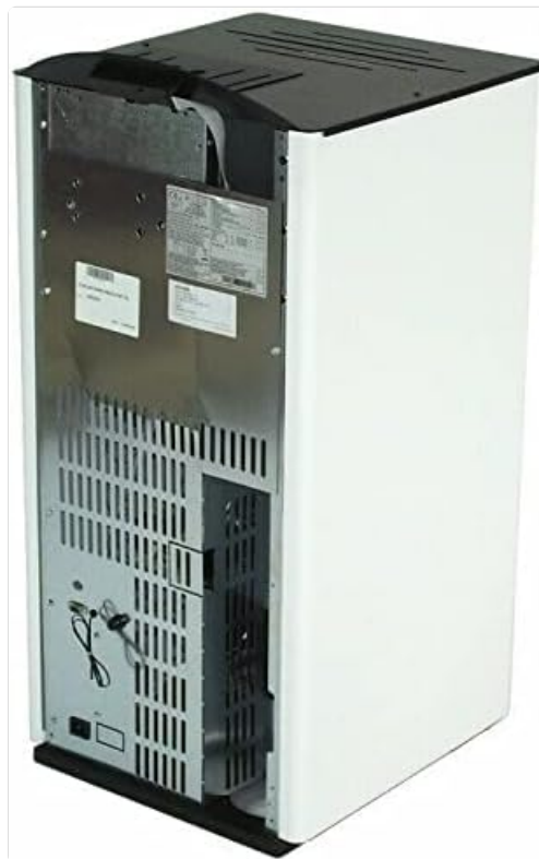
Figure 4.1: Rear view of the pellet stove, illustrating the exhaust outlet and electrical connections. Proper flue connection is essential.