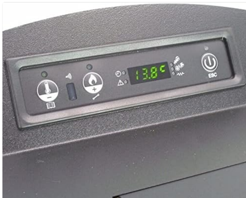
Figure 5.1: Close-up of the pellet stove's control panel, displaying temperature, fan, and power indicators, along with control buttons.

The control panel, located on the top of the stove, allows you to manage the stove's functions. Familiarize yourself with the buttons and display before operation.