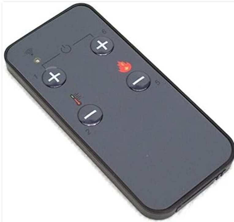
Figure 3.1: The remote control unit for the pellet stove, featuring power, temperature, and flame intensity adjustments.