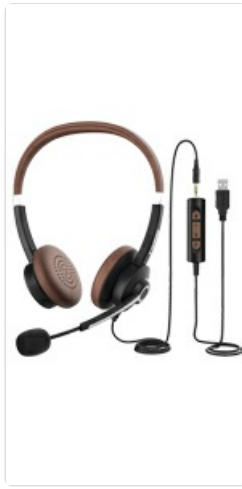
Image: An illustration of the headset, charging cable, and packaging, representing the typical package contents.