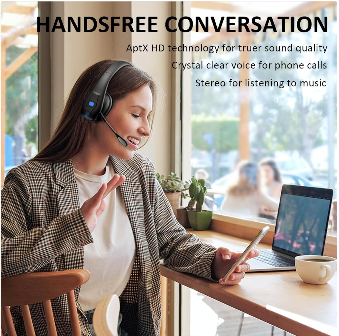
Image: A person using the headset for a hands-free conversation, illustrating the clear voice quality for calls and stereo sound for music.