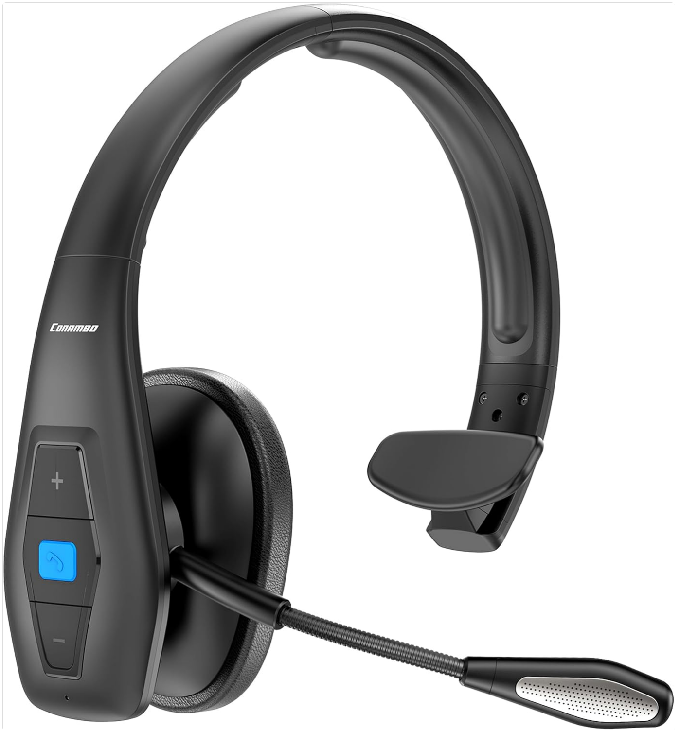
Image: The Conambo Noise Cancelling Bluetooth Headset V5.1, showcasing its design and components.