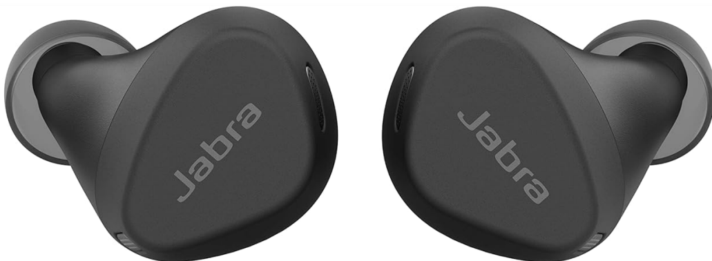
Image: Two black Jabra Elite 4 Active earbuds, showcasing their sleek design.

This manual provides instructions for the Jabra Elite 4 Active in-ear Bluetooth earbuds. These earbuds are designed for an active lifestyle, offering a secure fit, advanced audio features, and durability.