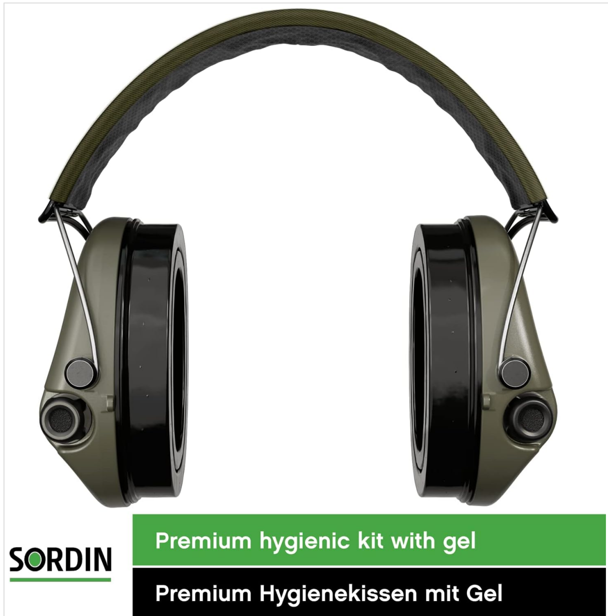
Figure 5.1: A close-up view of the Sordin Supreme Pro-X ear defenders, highlighting the premium gel ear cushions designed for comfort and seal.

For optimal hygiene and performance, inspect the gel ear cushions and foam inserts periodically. Replace them if they show signs of wear, cracking, or hardening. Replacement kits are available from Sordin.