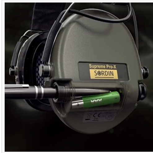
Figure 3.1: Illustration showing the correct method for inserting AA batteries into the Sordin Supreme Pro-X ear defender's compartment.