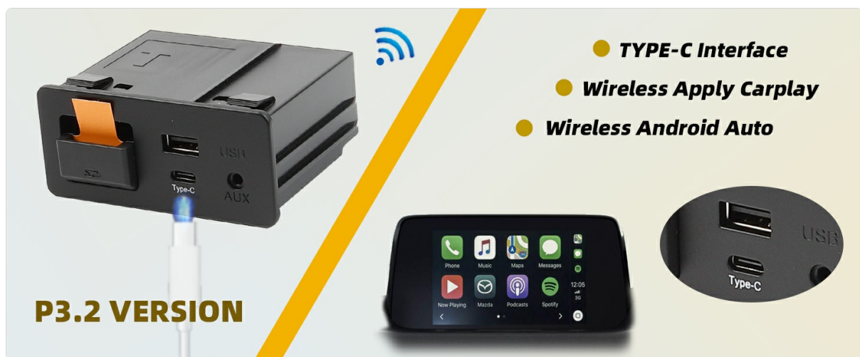
Figure 7.1: Support for Android phones and iPhones.