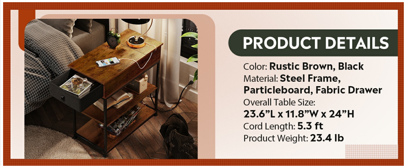
Image: Graphic summarizing key product details and specifications, including color, material, dimensions, and cord length.