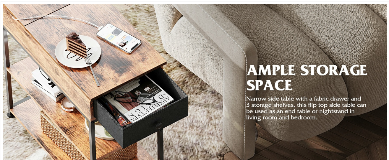
Image: The side table displaying its ample storage capabilities, including the fabric drawer and two open shelves.