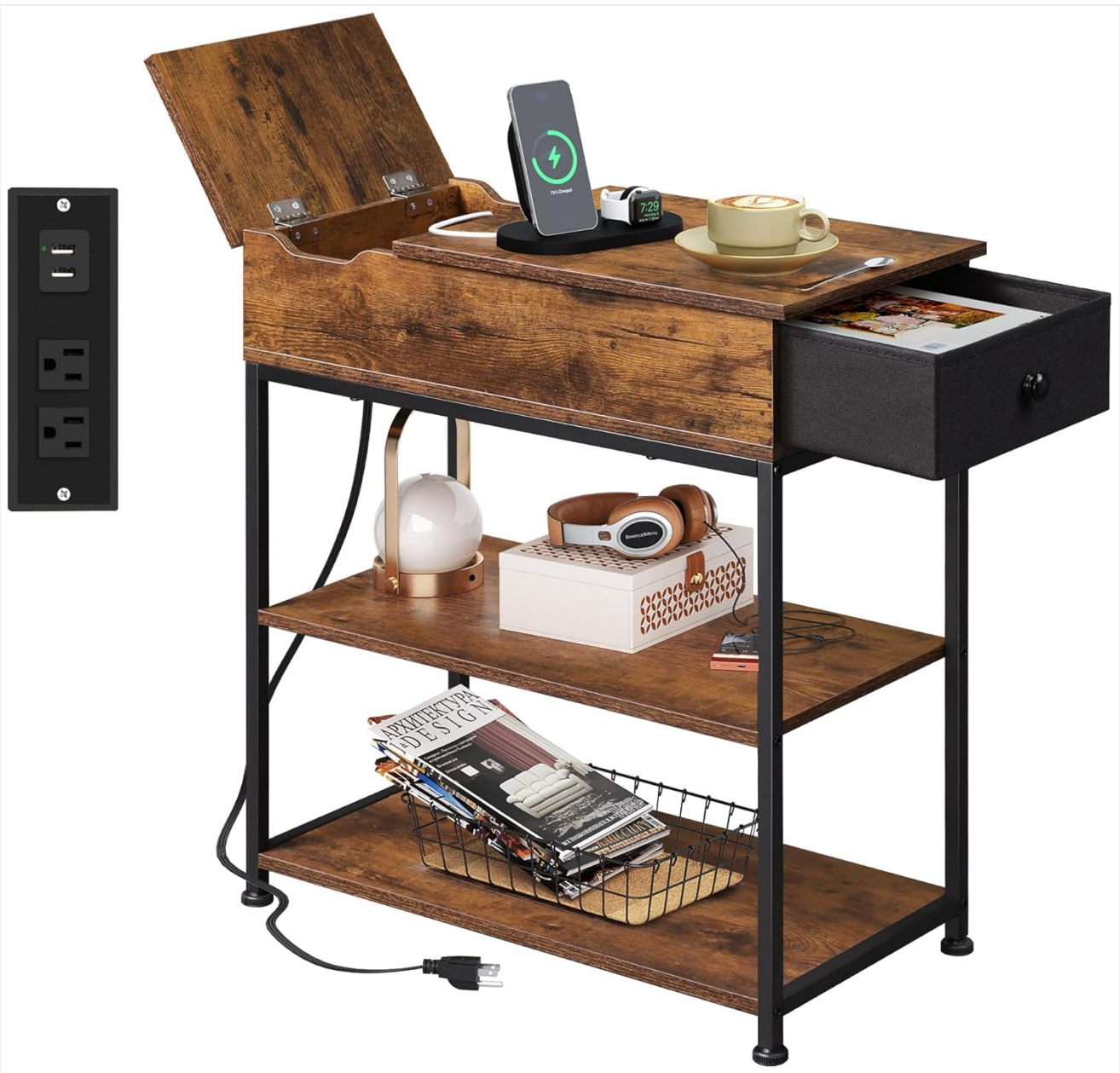
Image: The WLIVE Narrow Side Table in Rustic Brown, showcasing its charging station, fabric drawer, and open shelves.