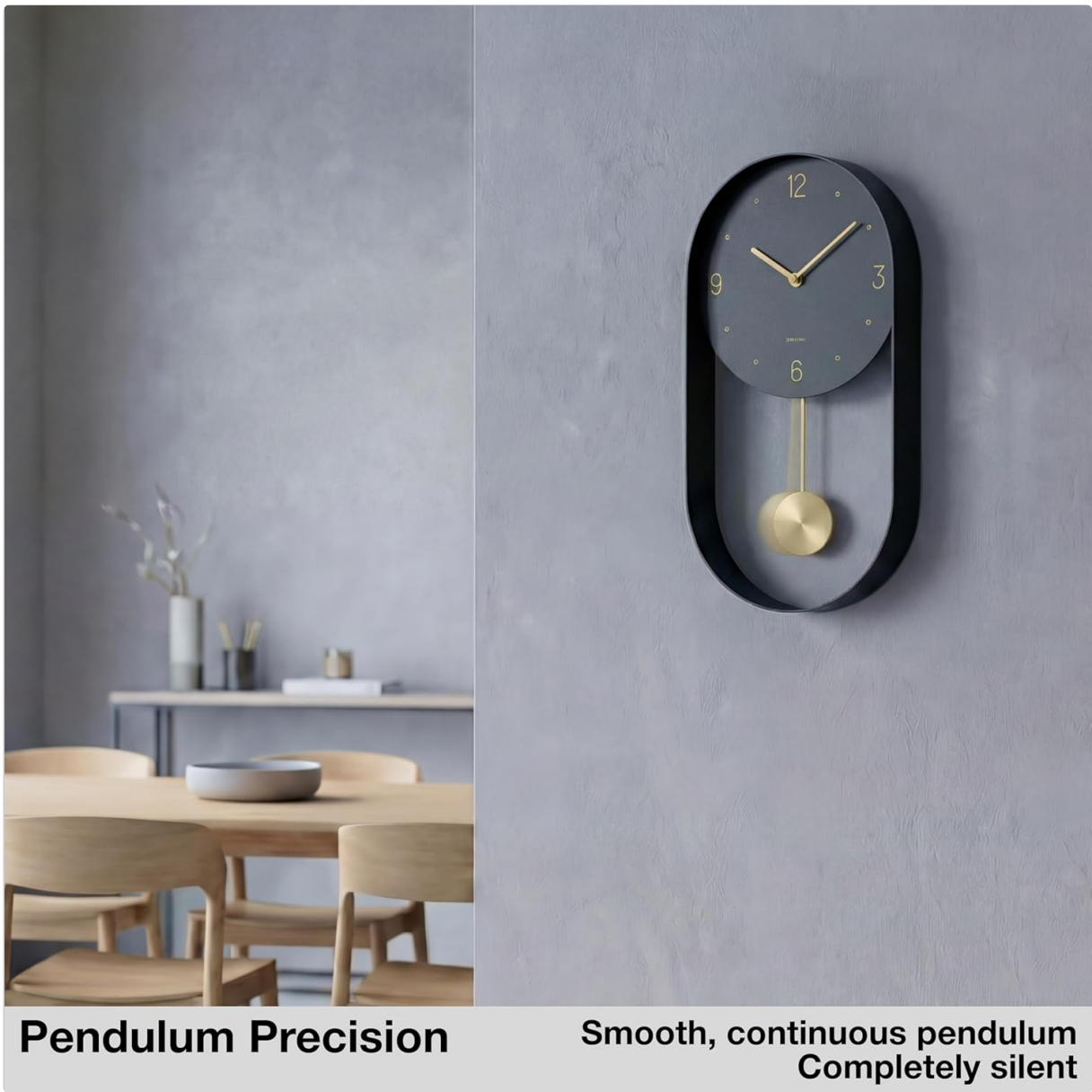
Figure 4: The clock's pendulum in motion, demonstrating its smooth and continuous swing.