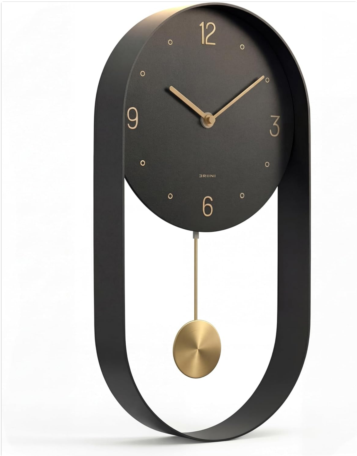
Figure 1: Driini Modern Pendulum Wall Clock (Black and Gold variant).