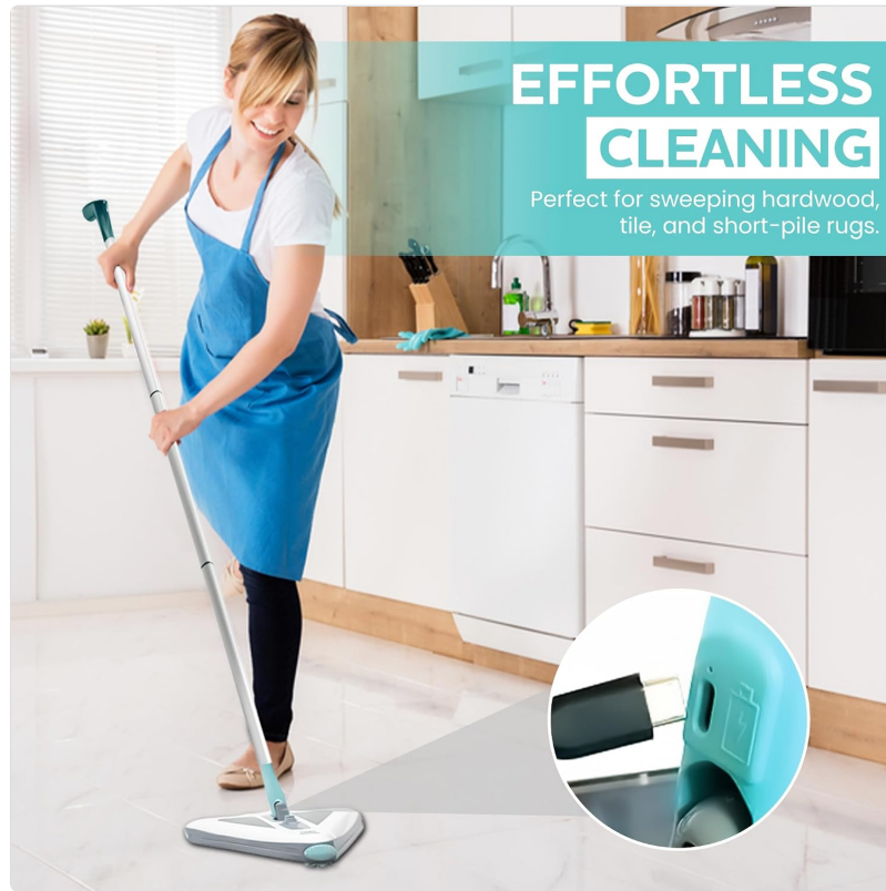
Figure 5.1: Charging Port Location. This image highlights the charging port on the sweeper handle, indicating where to connect the adapter.