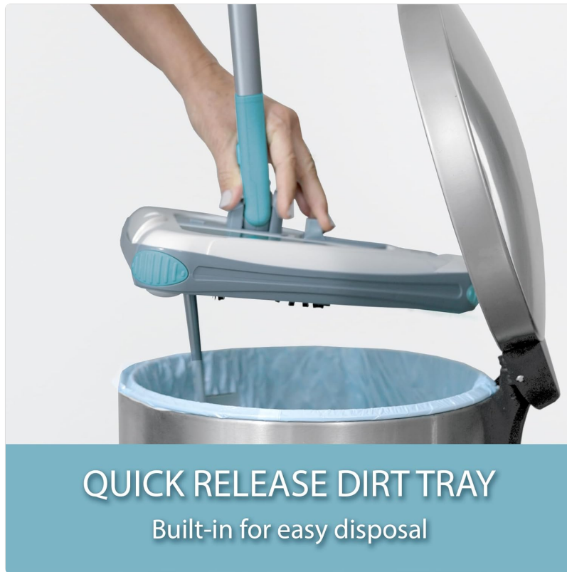
Figure 7.1: Quick-Release Dirt Tray. This image demonstrates the process of emptying the sweeper's dirt compartment for convenient disposal.