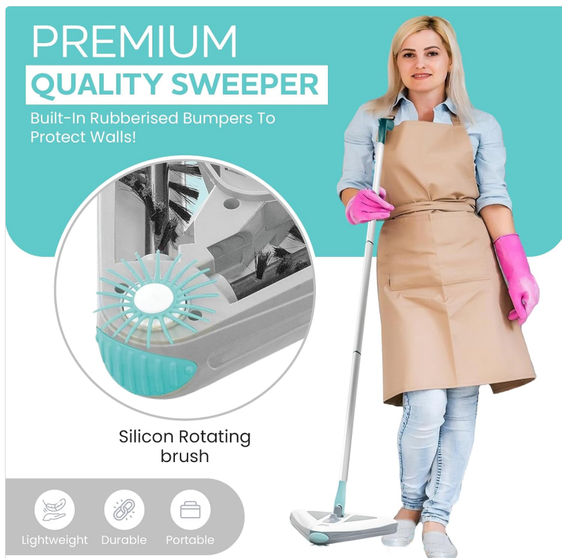
Figure 7.2: Silicon Rotating Brush. A detailed view of the sweeper's silicon brush, which should be kept clean for optimal performance.