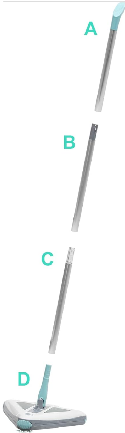
Figure 4.2: Exploded View of Components. This diagram shows the individual handle sections and the sweeper head, indicating how they fit together.