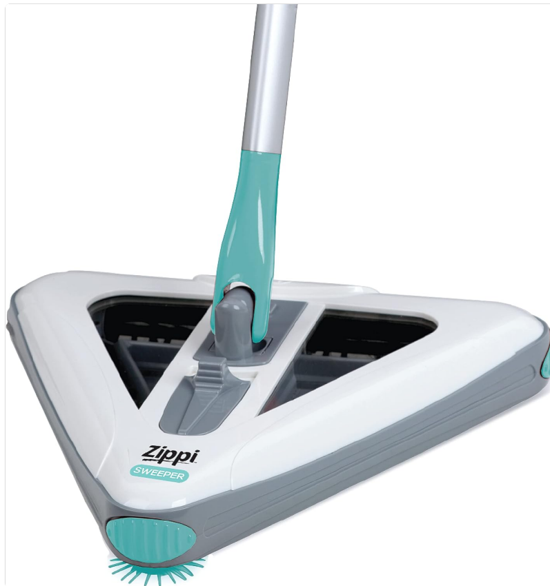
Figure 6.1: Zippi Sweeper Standard. A general view of the sweeper, illustrating its design.