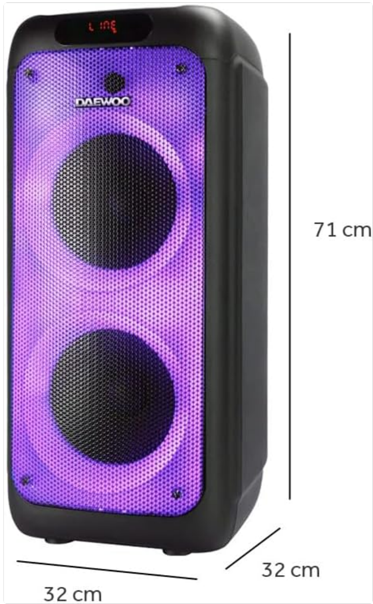
Image 3: Speaker Dimensions. This image illustrates the physical dimensions of the Daewoo DW-2000 speaker, showing its height and width measurements.