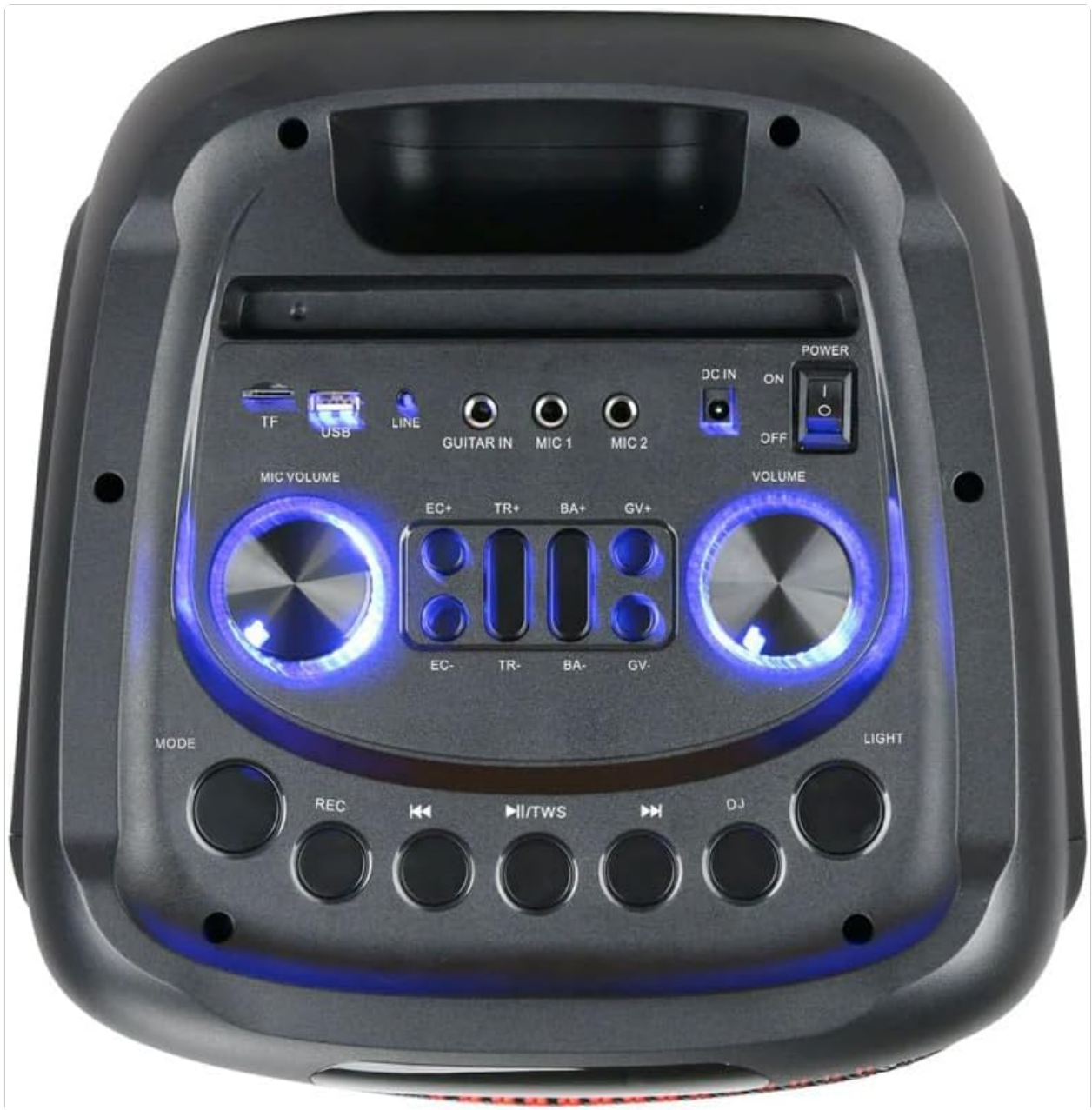
Image 2: Top Control Panel. This image displays the top control panel of the Daewoo DW-2000 speaker, showing various buttons and ports for operation, including volume knobs, input jacks, and control buttons.