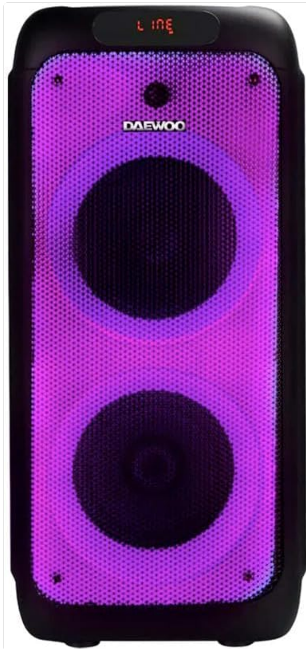
Image 1: Front View. A front view of the Daewoo DW-2000 portable speaker, showcasing its dual speaker grilles and vibrant LED illumination.

Familiarize yourself with the various parts of your DW-2000 speaker.