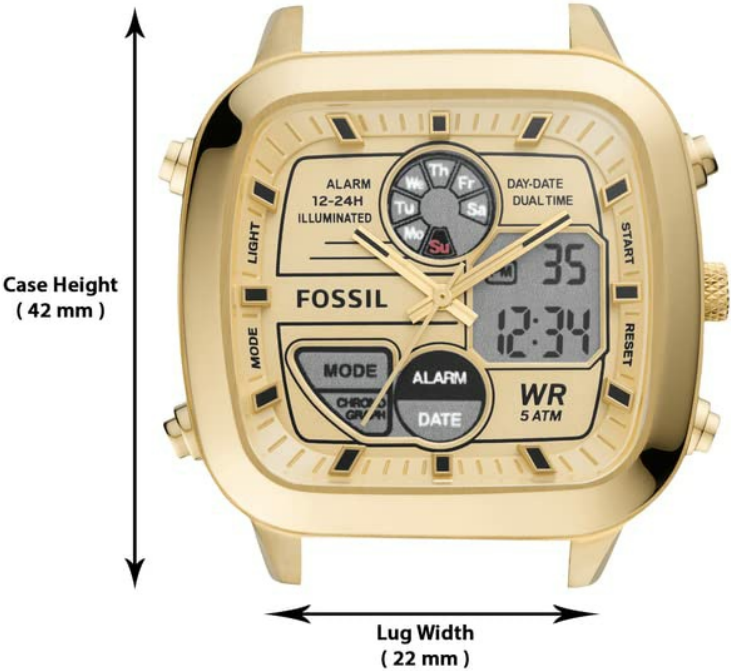
Image 6.1: Diagram illustrating the case height (42 mm) and lug width (22 mm) of the Fossil FS5889 watch.