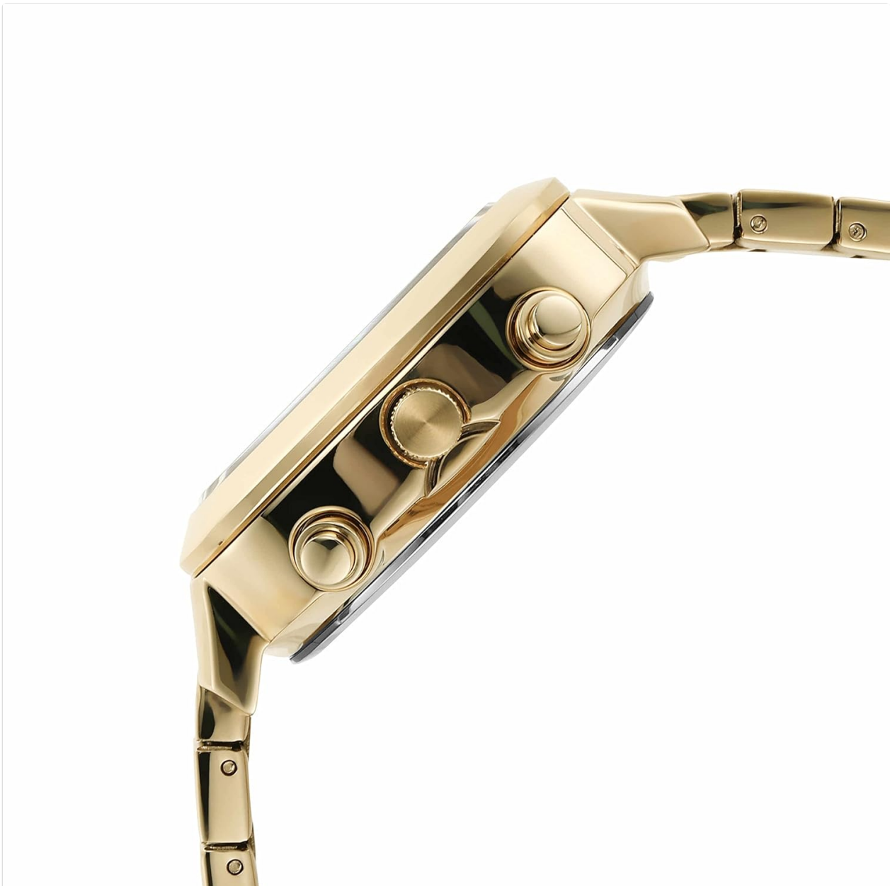
Image 3.1: Side view of the watch, highlighting the control buttons. These buttons are used to navigate modes, set time, activate the light, and control chronograph functions.

The Fossil FS5889 watch features multiple buttons for various functions. Familiarize yourself with their locations and purposes.