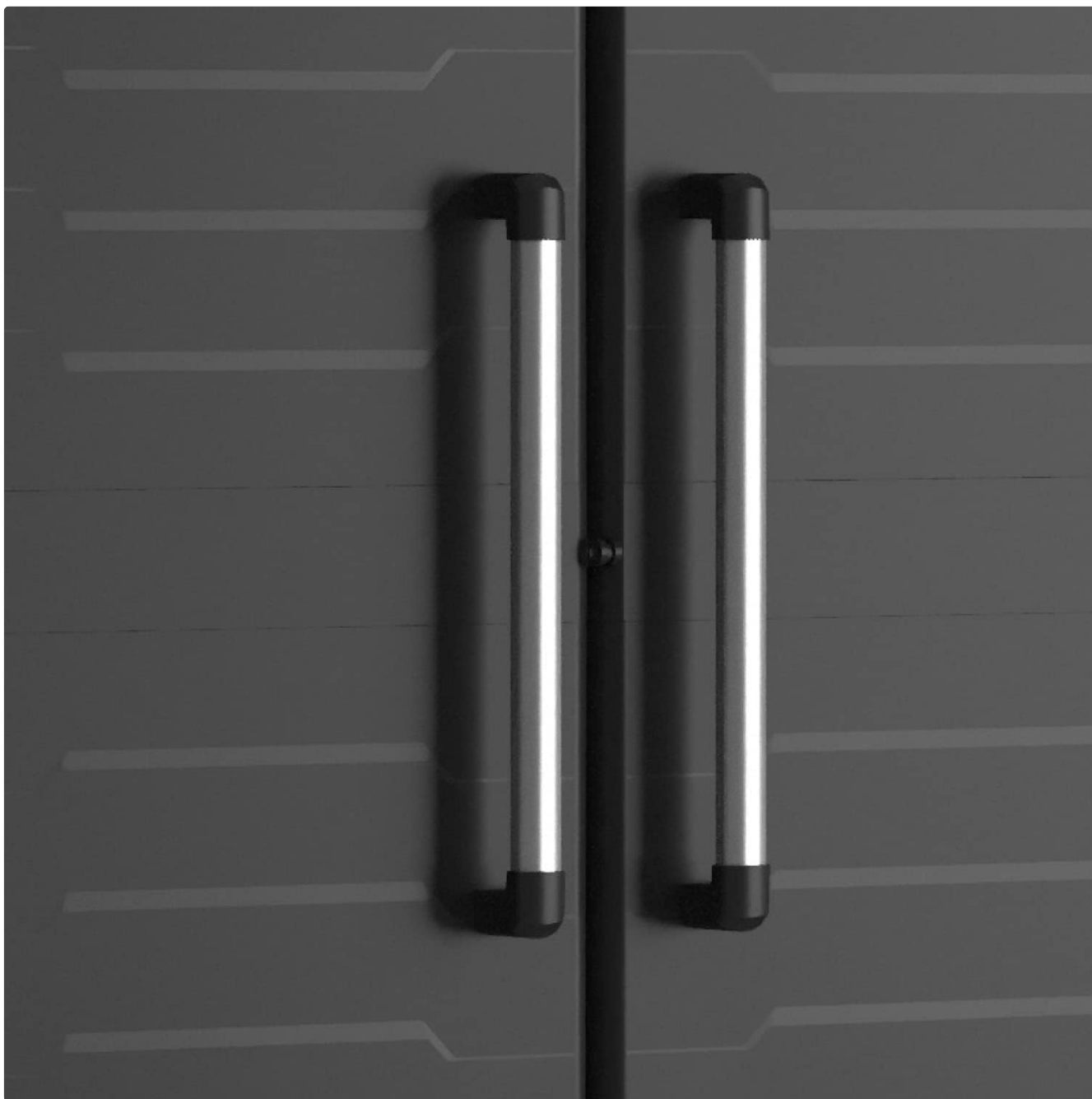
Figure 3: Close-up view of the Keter Detroit Multipurpose Storage Cabinet handles. The image highlights the design and material of the cabinet's handles, which are typically made of durable plastic with a metallic finish for ergonomic grip and aesthetic appeal.