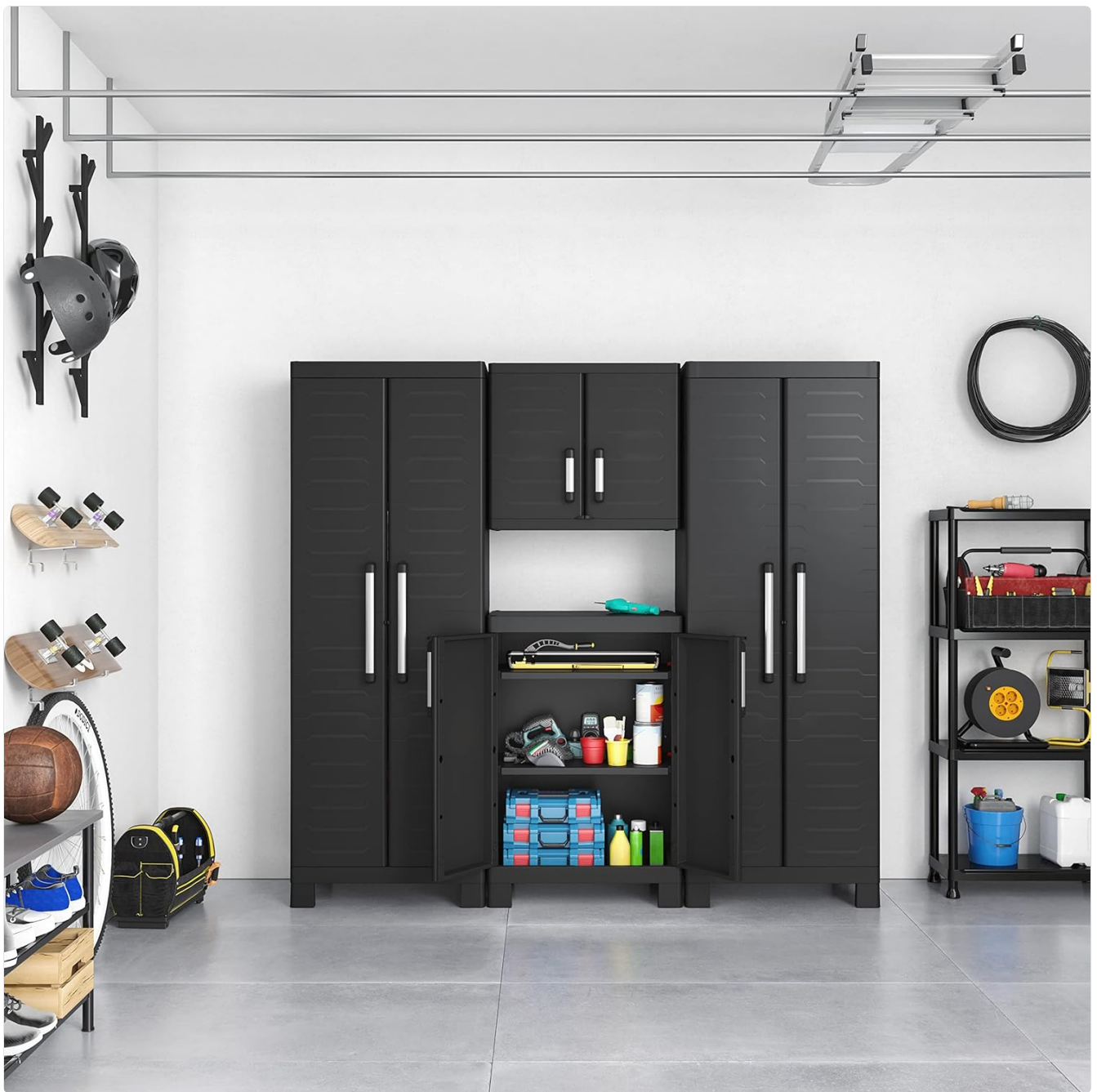
Figure 2: Keter Detroit Multipurpose Storage Cabinet integrated into a garage storage system. This image demonstrates how multiple Keter Detroit cabinets can be arranged together to form a comprehensive storage solution in a garage or workshop environment.