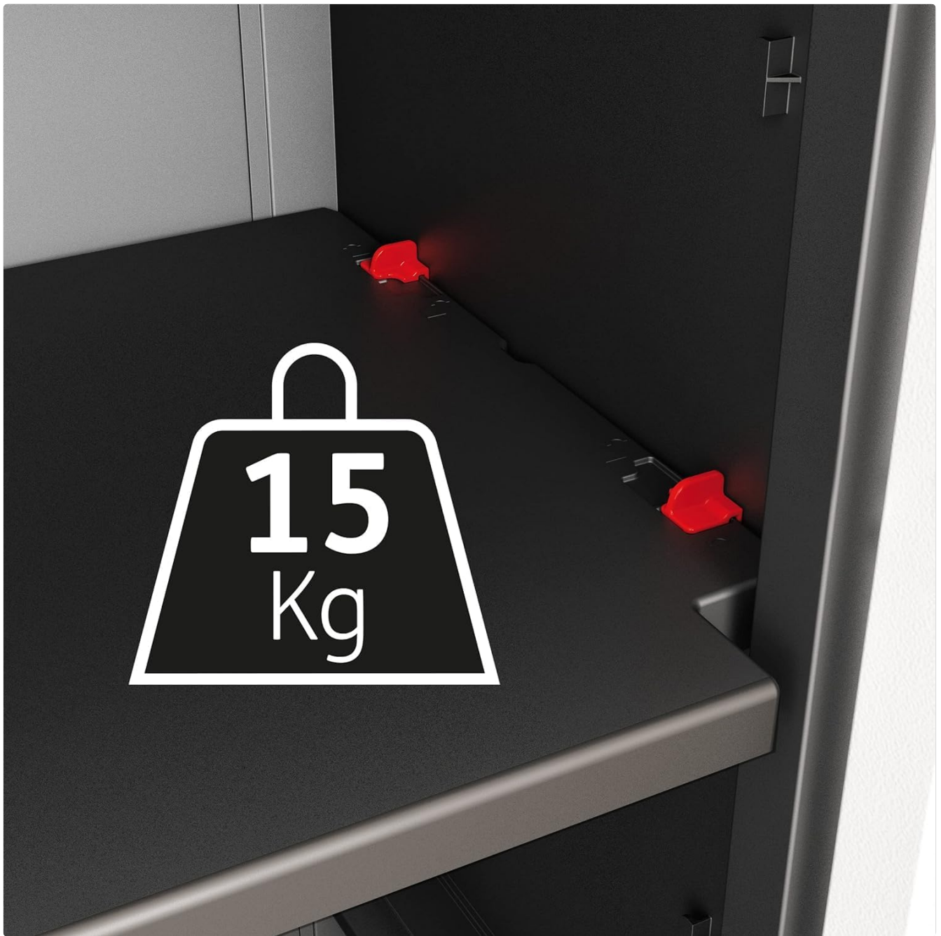
Figure 4: Close-up of a shelf within the Keter Detroit Multipurpose Storage Cabinet, indicating a 15 kg weight capacity. This image specifically shows the fixed shelf, highlighting its robust design and the maximum weight it can safely support.