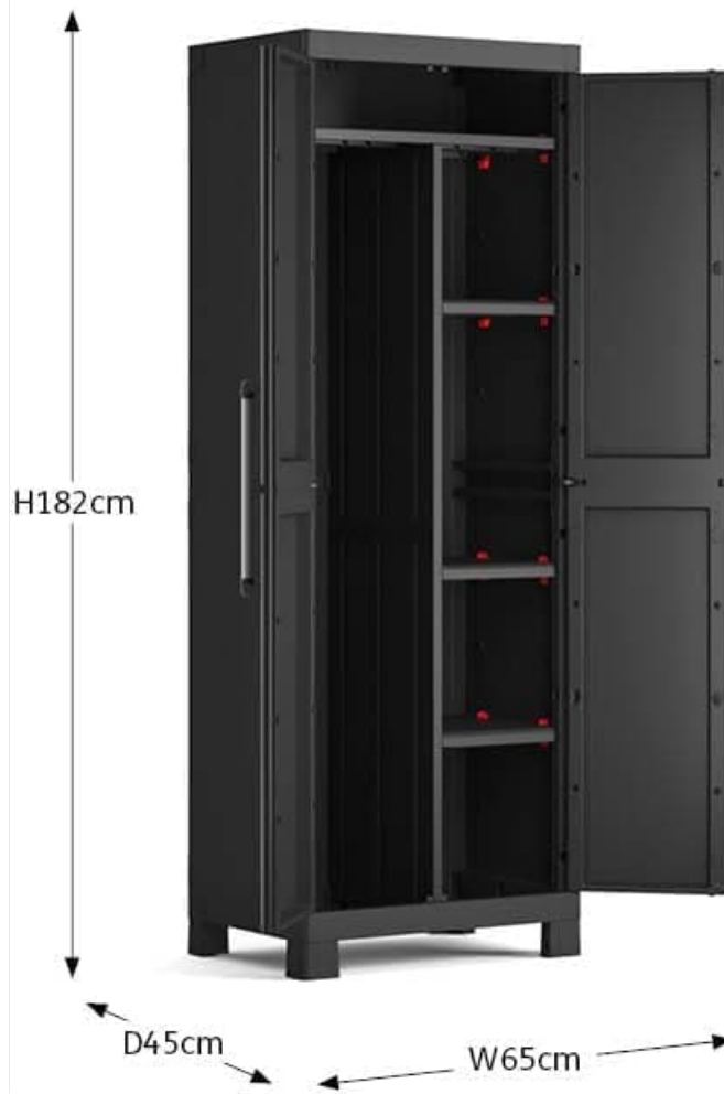
Figure 5: Keter Detroit Multipurpose Storage Cabinet with key dimensions. This diagram illustrates the height (H182cm), depth (D45cm), and width (W65cm) of the cabinet, providing a clear visual reference for its size.