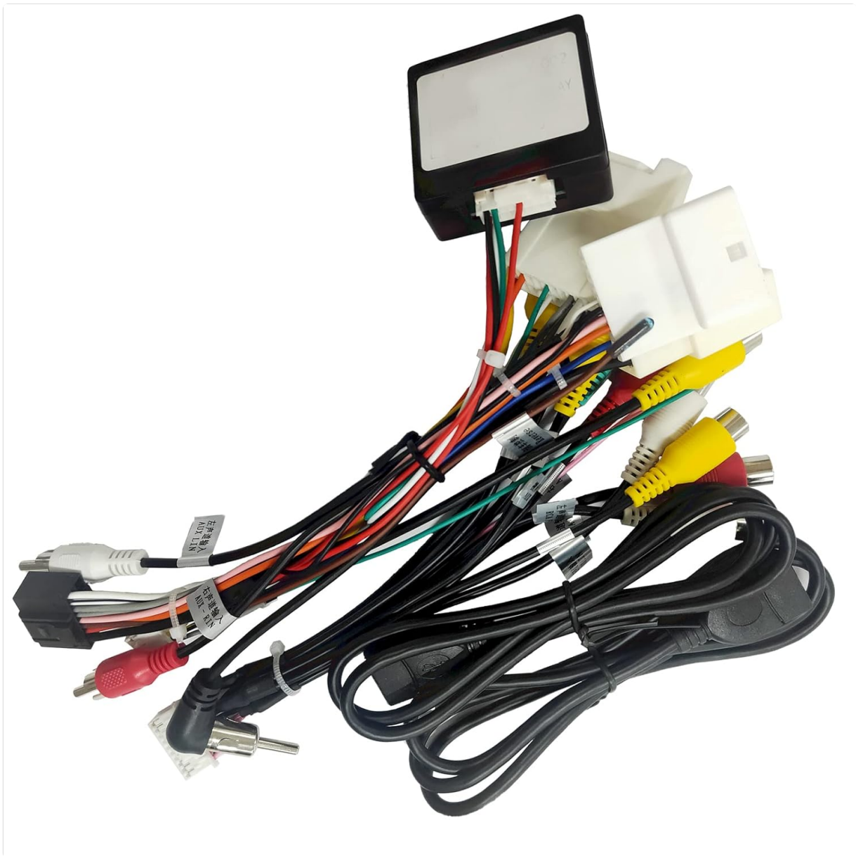
Image 1: The AWESAFE J BL Adapter Wiring Harness. This image displays the complete wiring harness assembly, including various connectors and cables, bundled together for packaging.