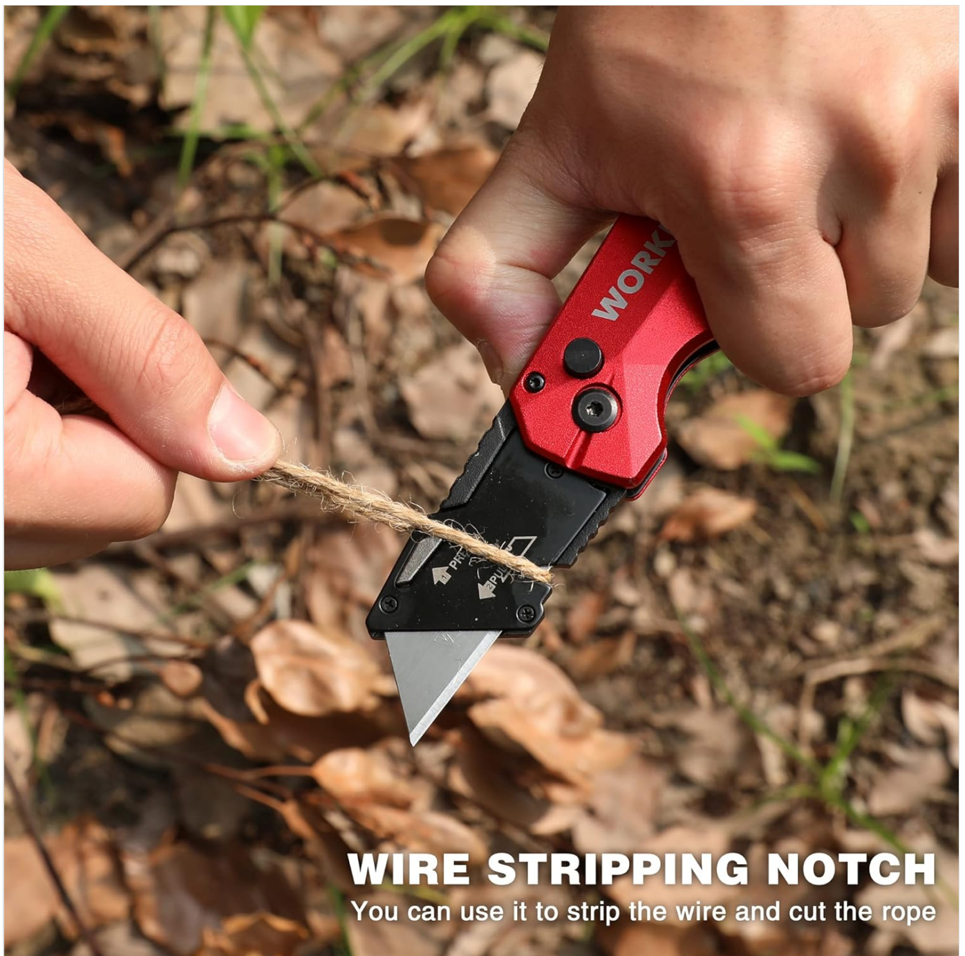
Figure 7: Using the Wire Stripping Notch