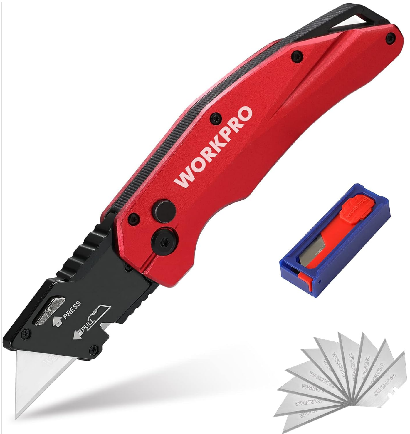
Figure 1: WORKPRO Folding Utility Knife (Red)