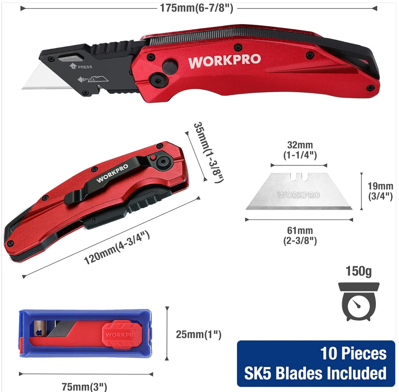
Figure 3: Product Dimensions