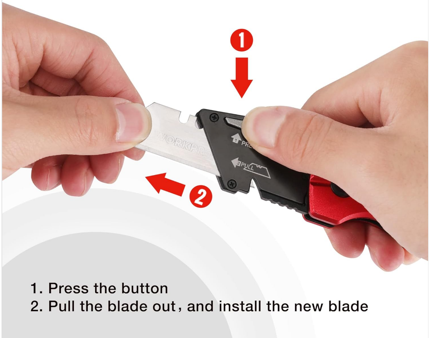
Figure 4: Quick Blade Change Process