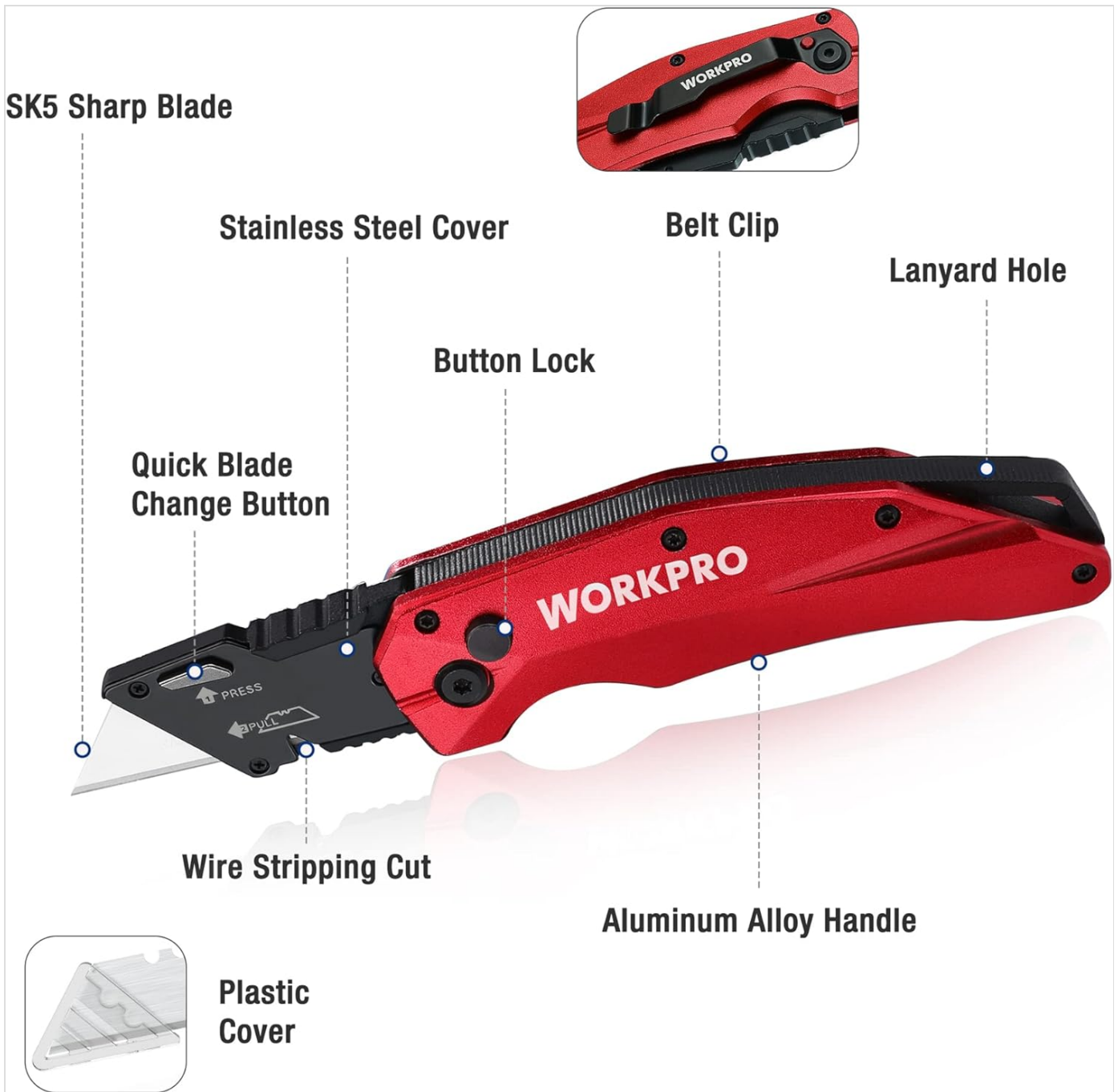
Figure 2: Labeled Components of the Utility Knife

The WORKPRO Folding Utility Knife features a robust design for various cutting tasks. Key components are illustrated below: