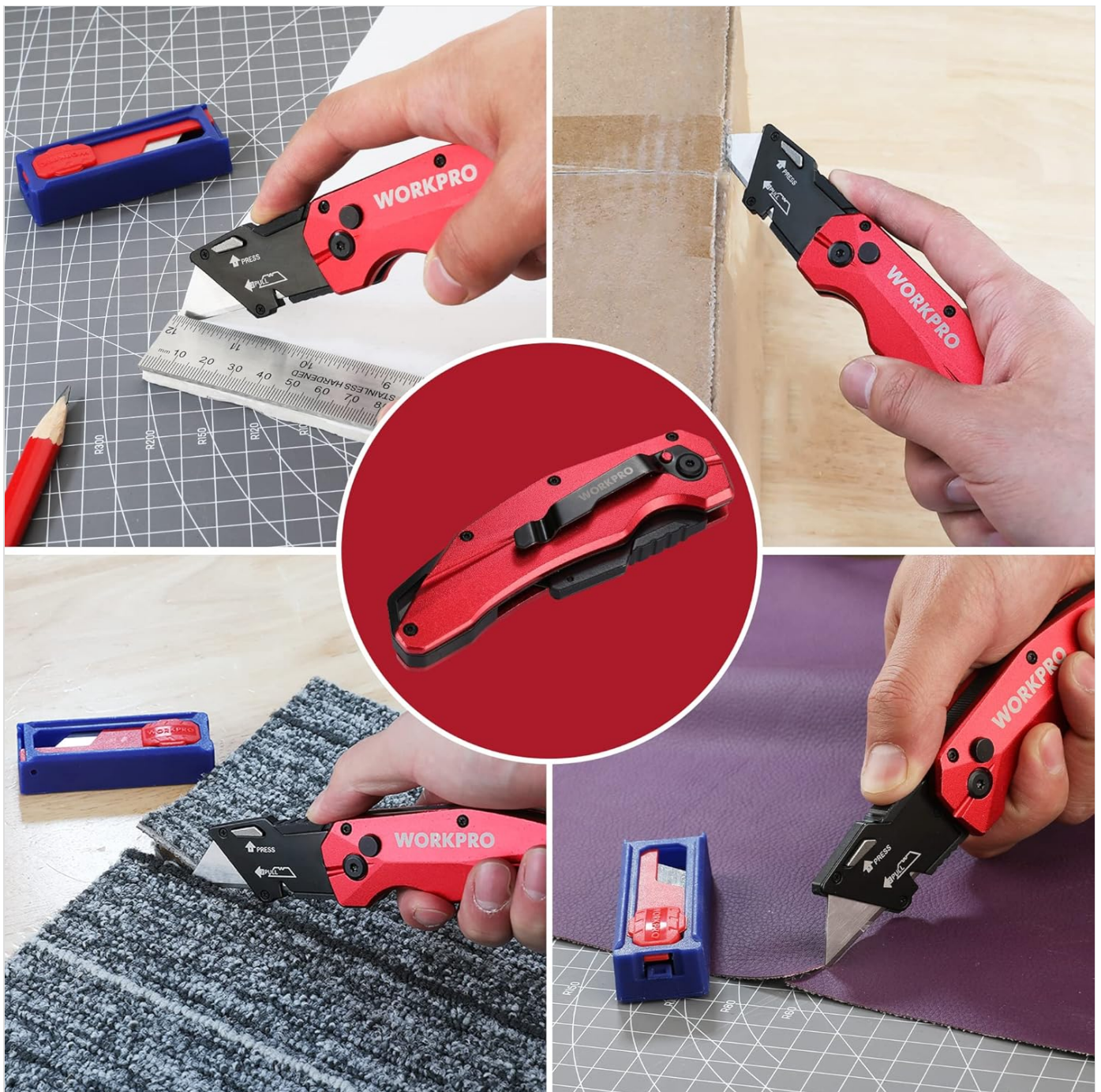
Figure 6: Versatile Cutting Applications