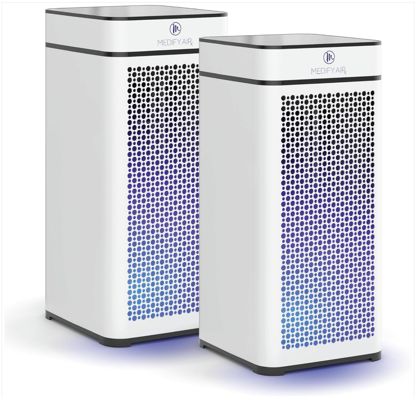
Image: Two Medify MA-40 UV Light Air Purifiers, showcasing their sleek white design and perforated air intake panels.