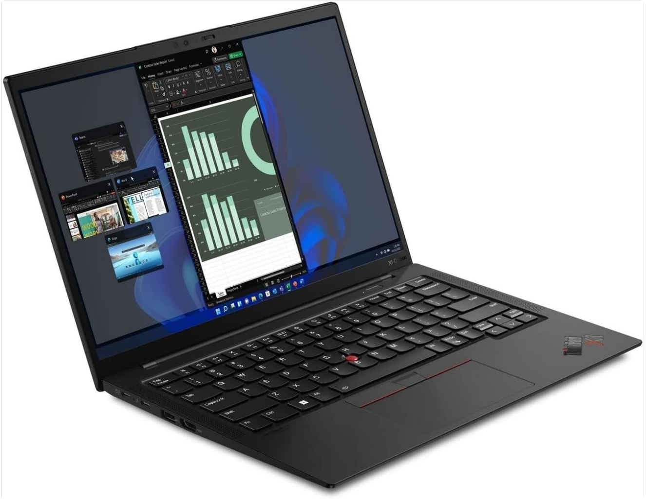
Figure 3.1: Multi-tasking on the ThinkPad X1 Carbon Gen 10 display.

Your laptop is equipped with a 14-inch WUXGA (1920x1200) Low Power IPS 400nits Anti-glare touch display, powered by Integrated Intel Iris Xe Graphics. This display offers clear visuals and touch functionality for enhanced interaction.