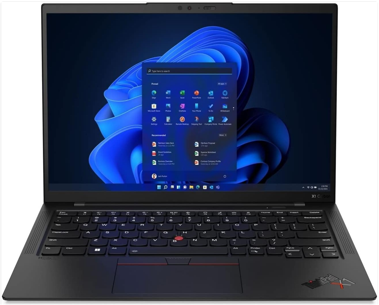
Figure 2.1: Lenovo ThinkPad X1 Carbon Gen 10 powered on with Windows 11.