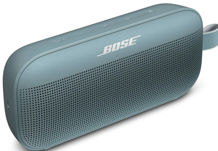
Image 1: The Bose SoundLink Flex Bluetooth Speaker, showcasing its sleek design.

The Bose SoundLink Flex is a portable Bluetooth speaker designed to deliver deep, clear, and immersive audio. Engineered for durability, it features a rugged, waterproof, and dustproof design, making it suitable for various environments, both indoors and outdoors. Its compact size and robust construction ensure it can accompany you on any adventure.